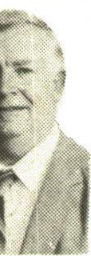
AB GENOE Sales Rep.