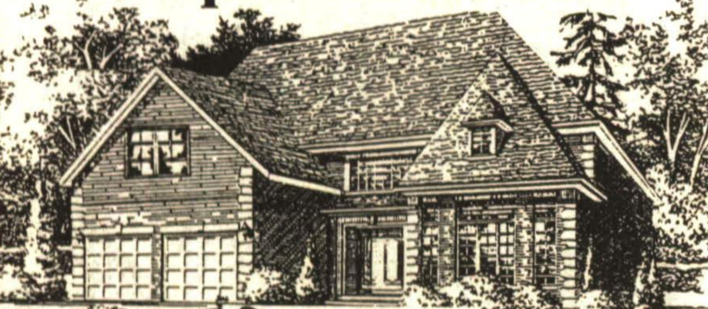
RICCIUTO CUSTOM HOMES