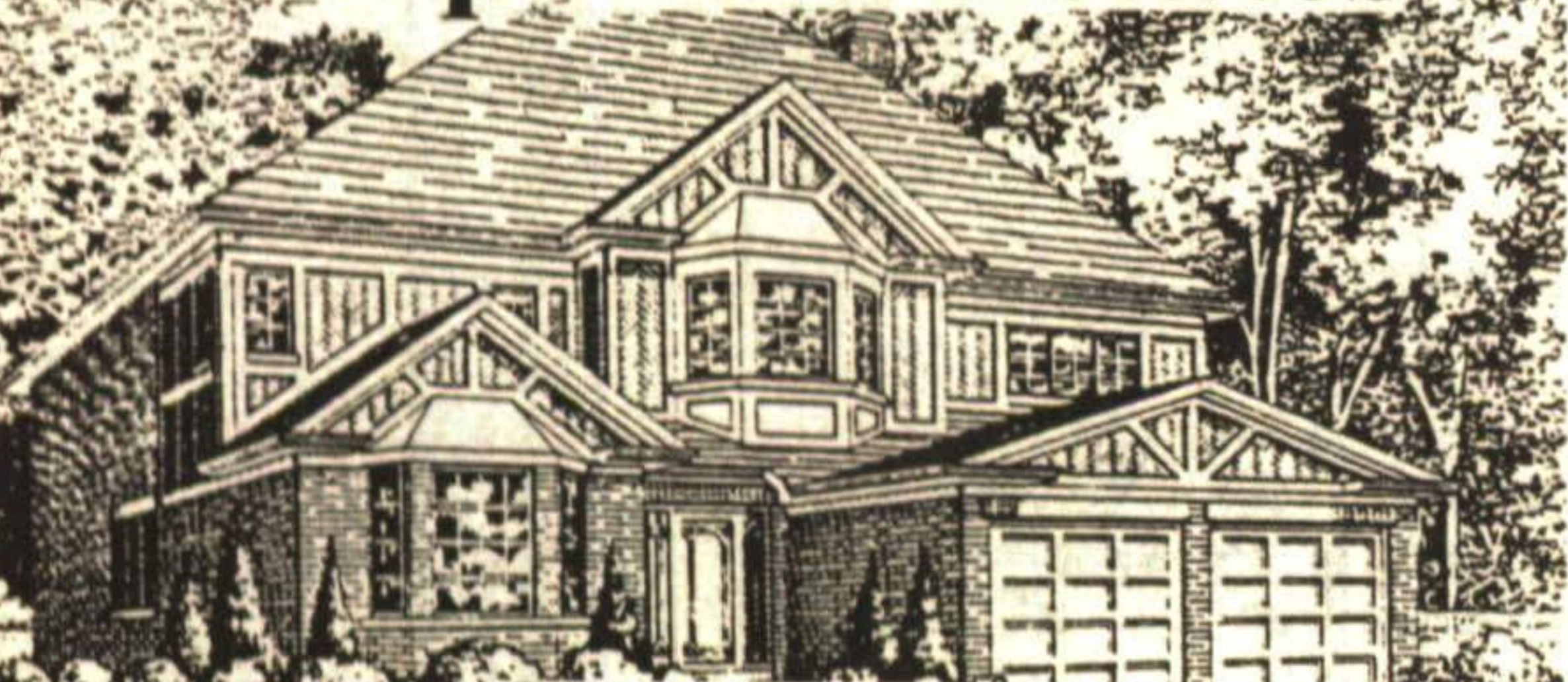
RICCIUTO CUSTOM HOMES