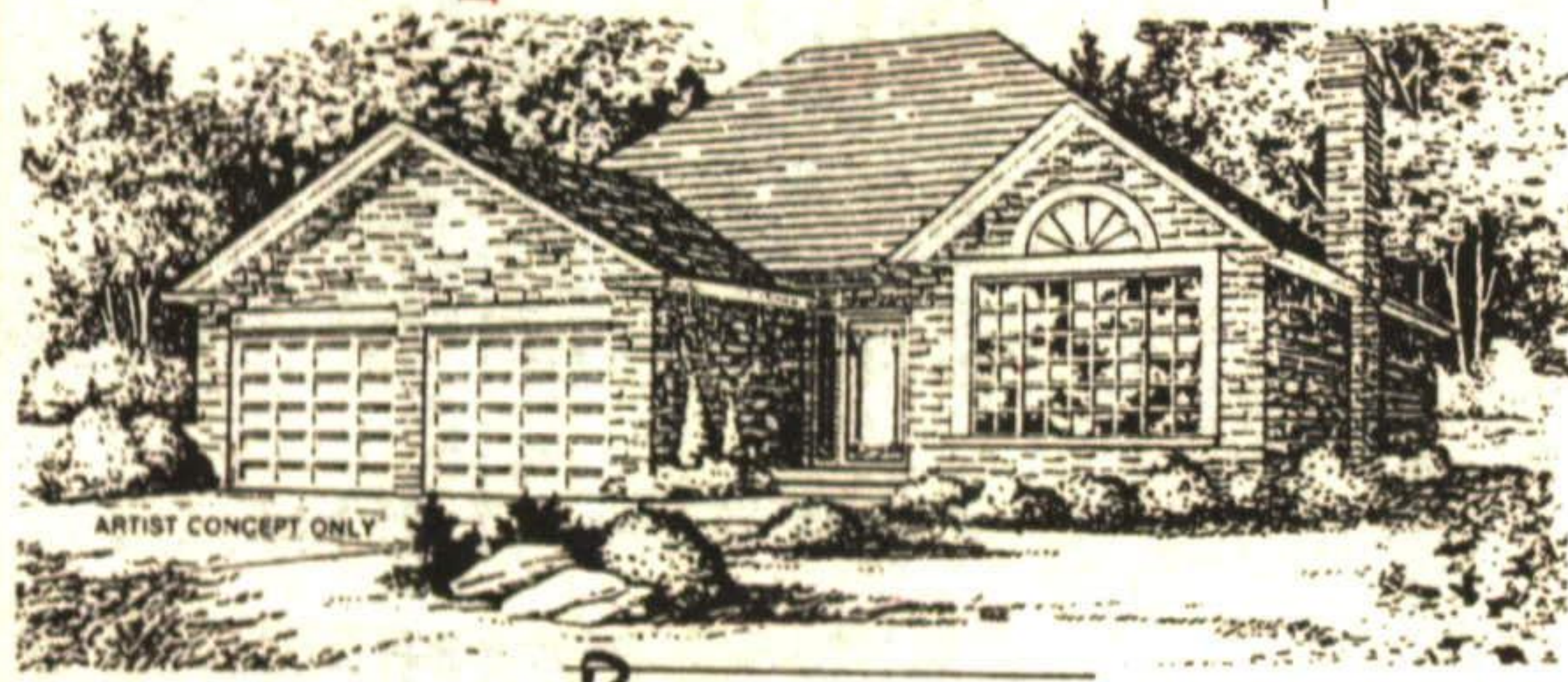
RICCIUTO CUSTOM HOMES