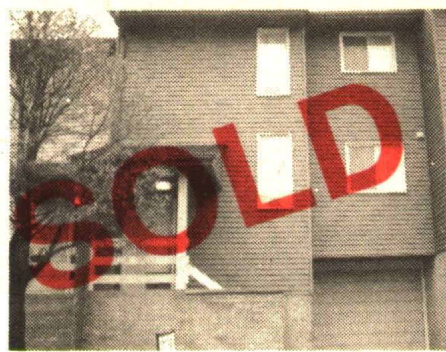
A GREAT START

A clean, well-maintained "B" model River Run townhome with upgraded carpeting throughout. Single car garage. Good complex. Newly listed at $134,000. Call Madeline Davies*. 92-2-515