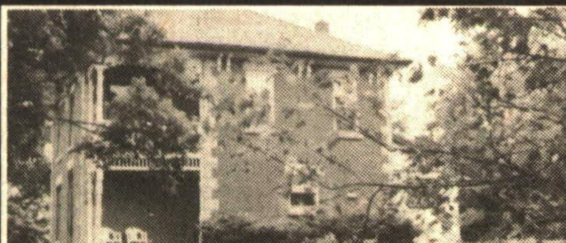
ORANGEVILLE 10 ACRES HUGE POND $329,000

A delightful reminder of the way we were (1850 and all that), situated on a rise amid mature trees this charming home offers 3 bedrooms... the master is large and has an ensuite bath, large living room, plus a formal parlour, an office and a den, in the new addition which has been so carefully matched in stone, is a welcoming kitchen/family room with a huge fireplace, oak cupboards etc. The workmanship is exemplary. Also a dining room with exposed stone walls and walkout to the stone terrace and lawn. Main floor laundry and powder room, attached garage. Two small outbuildings. All this is located on 2.47 acres in a charming hamlet south and east of Cambridge. Asking price is $395,000. If you are in the market for something distinctive and charming, don't discount this one before you've seen it. Call Gladys Scott* at 416-838-3830. JD93-018