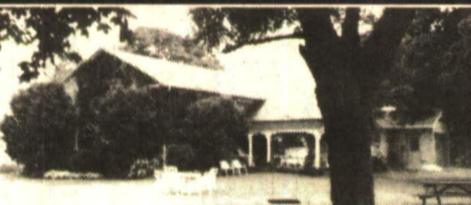
TREASURED HEIRLOOM STONE COTTAGE

Excellent opportunity to operate at home business. Currently operating as corner variety store. 2 storey home contains 2 apartments. Prime Huttonville location with great potential all for only $249,900. Call Madeline Davies*. 93-2-121