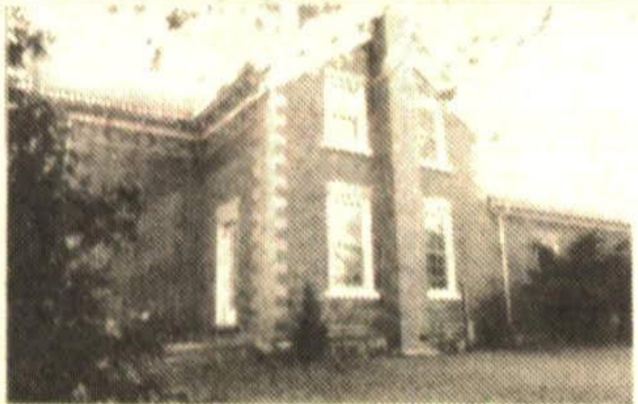
10 PRETTY ACRES - HUGE BARN $339,000

This home says 'welcome' as you walk through the door. By no means perfect, but well worth adding the finishing touches. At present there are 5 bedrooms, cosy sitting room, farmhouse kitchen with woodstove, main floor laundry. Pine board floors and pine clad windows in living room. Pool too - above ground. Pottery workshop too. 2 car garage. Magnificent maples line the driveway. You should see this one - soon. Call Gladys Scott* 416-838-3830. JD93-019