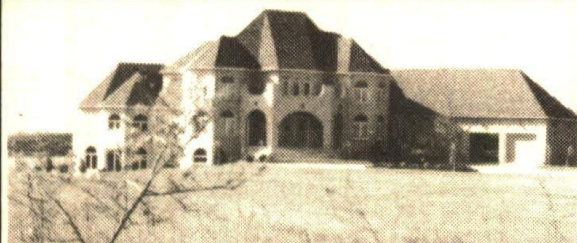
CLASSIC GRACE - CONTEMPORARY FLAIR

This home says 'welcome' as you walk through the door. By no means perfect, but well worth adding the finishing touches. At present there are 5 bedrooms, cosy sitting room, farmhouse kitchen with woodstove, main floor laundry. Pine board floors and pine clad windows in living room. Pool too - above ground. Pottery workshop too. 2 car garage. Magnificent maples line the driveway. You should see this one - soon. Call Gladys Scott* 416-838-3830. JD93-019