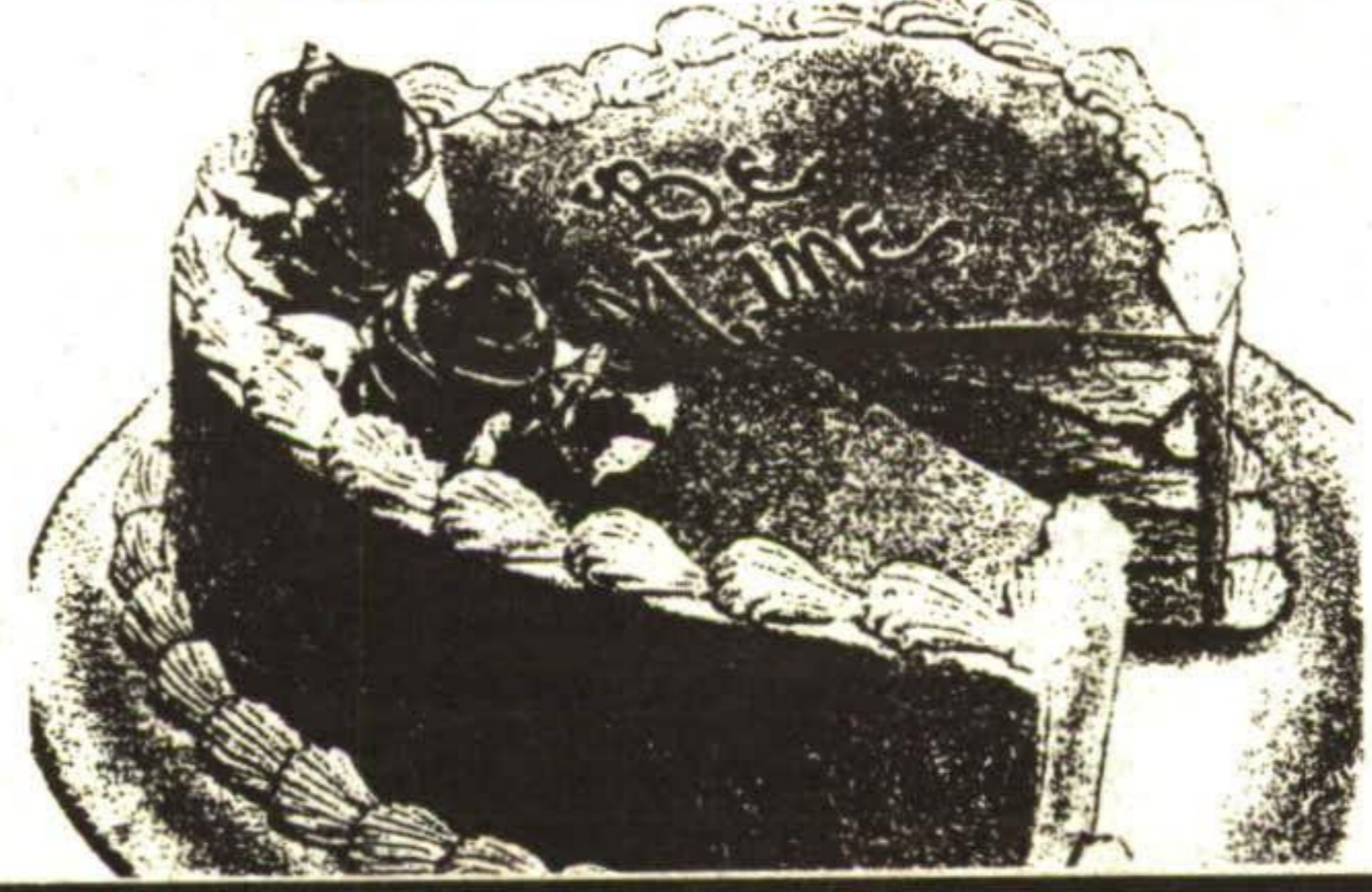
A cake for the winning couple

Baskin Robbins Special orders 873-4873 Ice Cream & Yogurt Georgetown Marketplace Mall