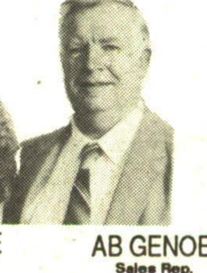
AB GENOE Sales Rep.