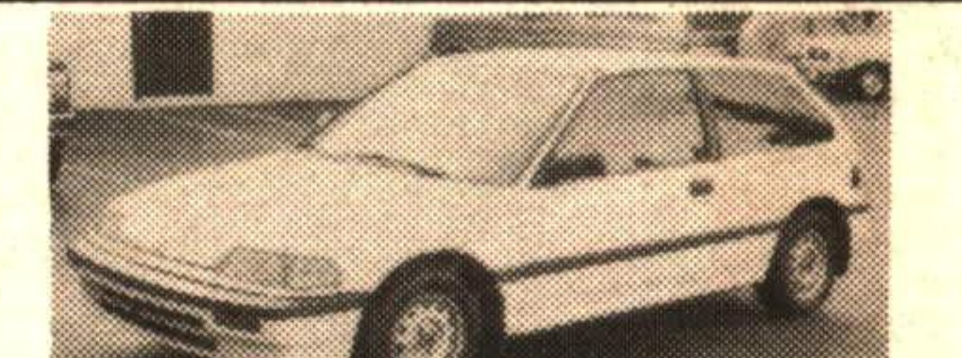
1989 HONDA CIVIC DX 2 dr. Hatchback, 4 cyl., auto, AM/FM. STK#8315A $7,995.