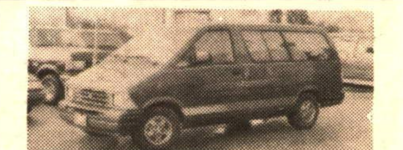
1990 AEROSTAR XL EXTENDED 7 pass., 6 cyl., auto, air, P.S., P.B., AM/FM Cass., Two tone. STK#92127 $14,595.