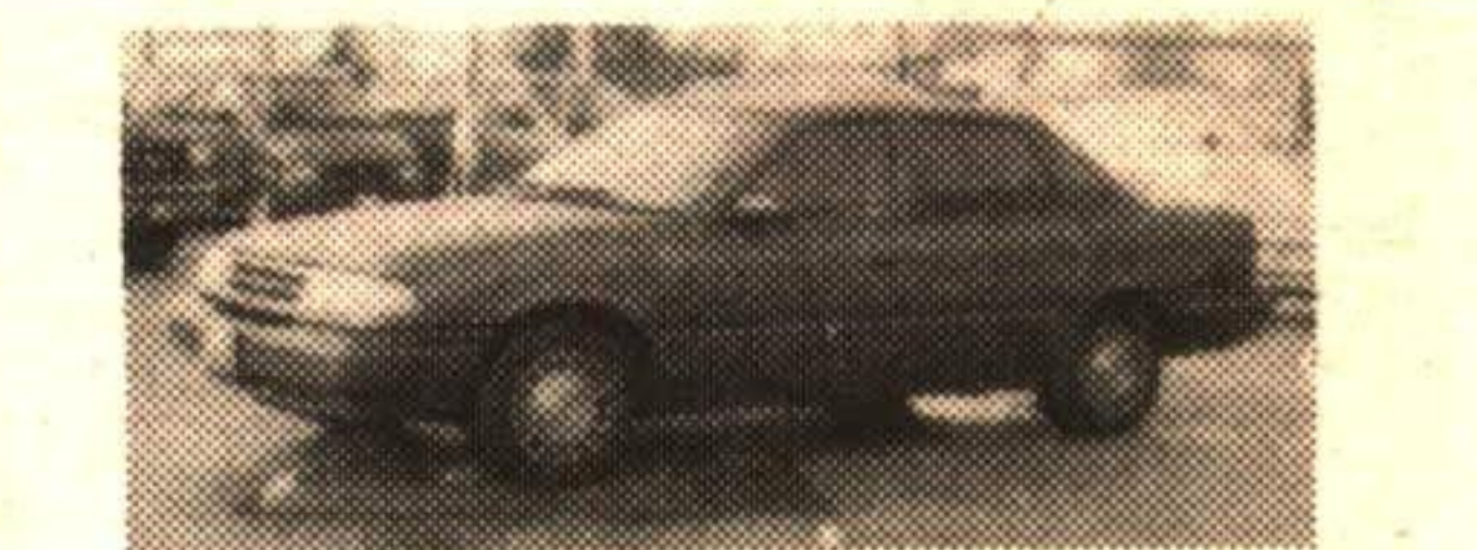
1991 TEMPO L 4 door, 4 cyl., auto, p.s., p.b., air. Very clean. 34,000 kms. STK#92126 $8,495.