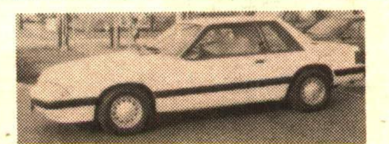
1989 MUSTANG LX COUPE 4 cyl., auto, air, P/Locks/Windows, Tilt & Cruise. STK#92146 $7,995.