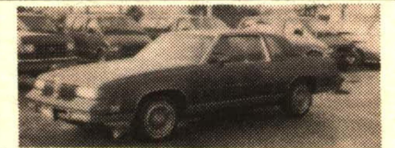
1988 CUTLASS SUPREME 6 cyl., auto, air, P/Locks/Windows/Seats & much too much to list. Very Clean. STK#7223A $8,995.