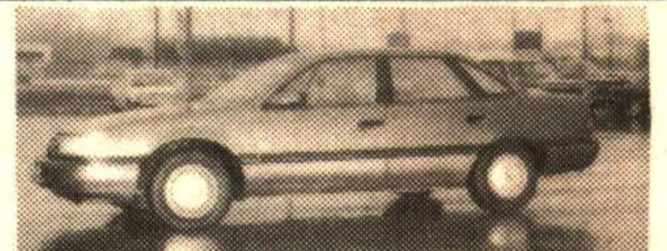
1989 TAURUS L v6, auto, air cond., P/S/B, AM/FM Cass., very clean. STK#92108 $8,495.