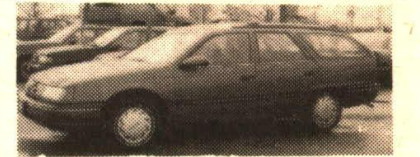
1991 TAURUS WAGON v6, auto, p.s., p.b., air, AM/FM Cass., 3rd seat. Only 45,000 kms. STK#92132 $15,595.