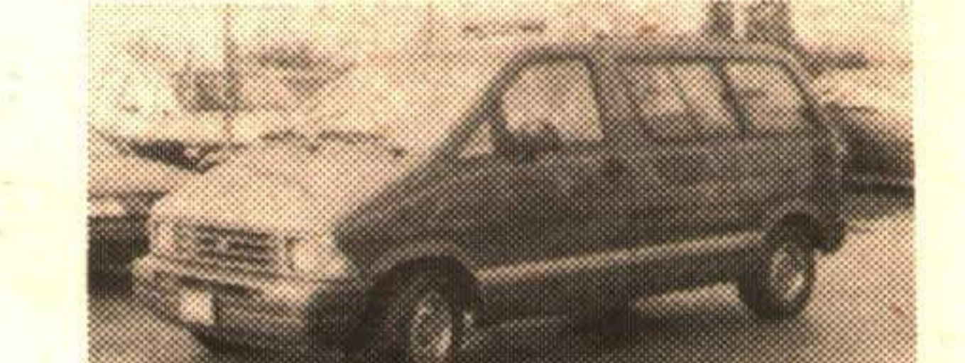
1988 AEROSTAR XL Air, auto, P.S., P.B., AM/FM. 6 cyl., STK#92124 $9,995.