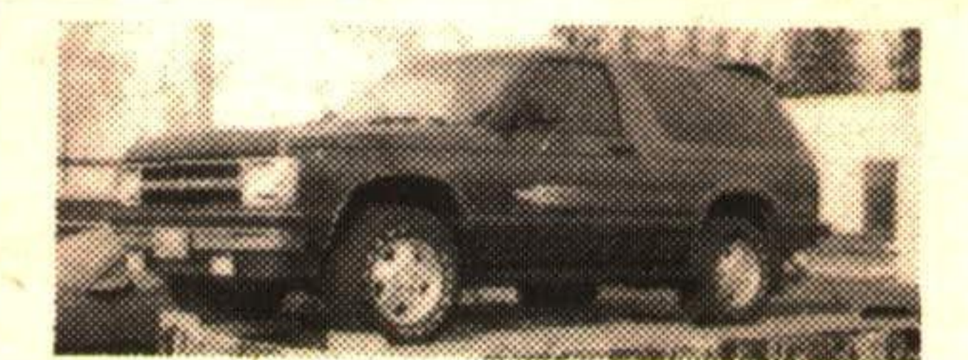
1991 CHEV BLAZER 4 X 4 v6, auto, air, P.S., P.B., AM/FM Cass., 67,000 kms. STK#92147A $17,995.