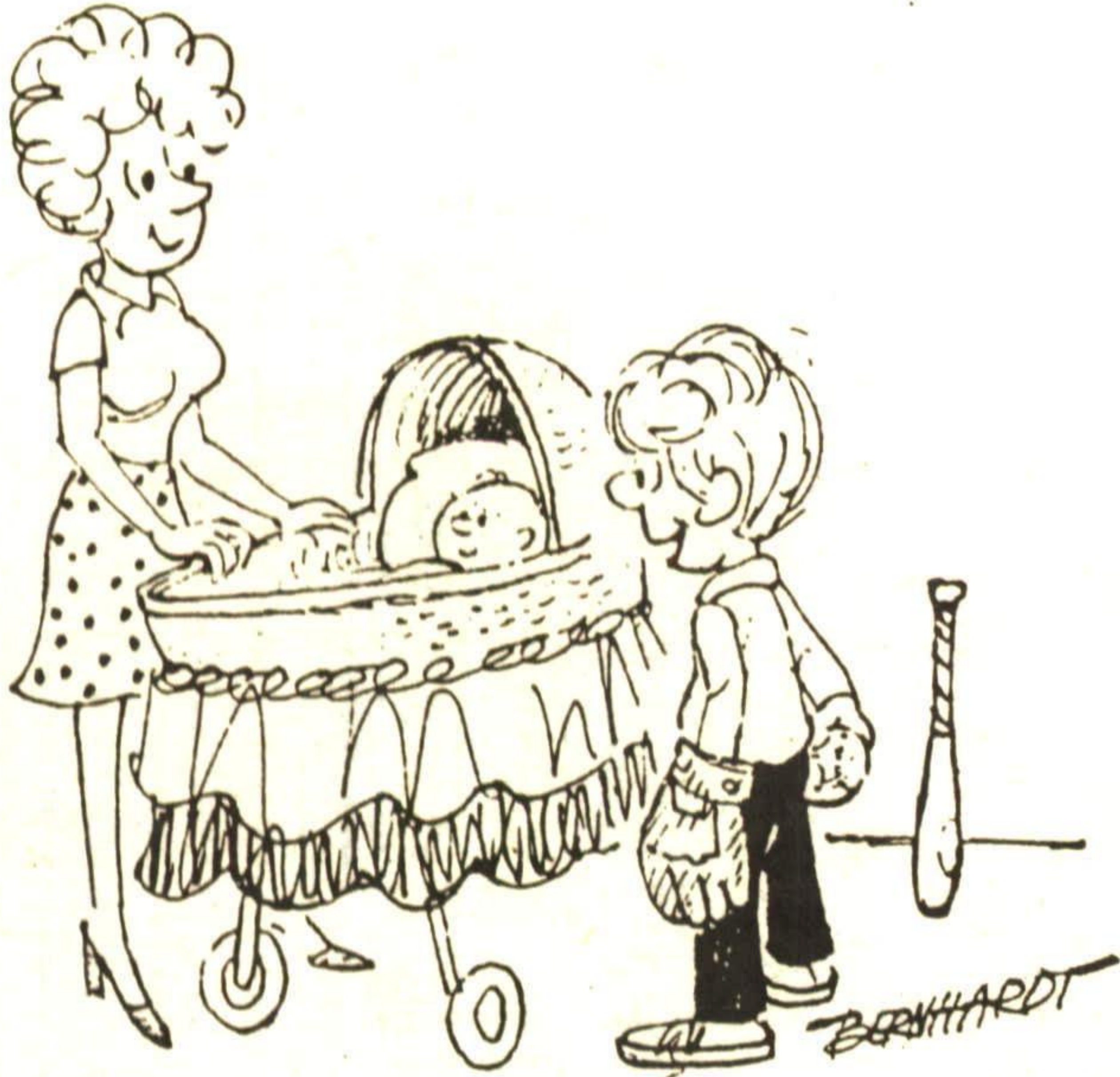
"Teach him to do things left-handed, will ya Mom? We could use some left-handed power at the plate."

For more information about Acton Baptist Church, call 853-0690.