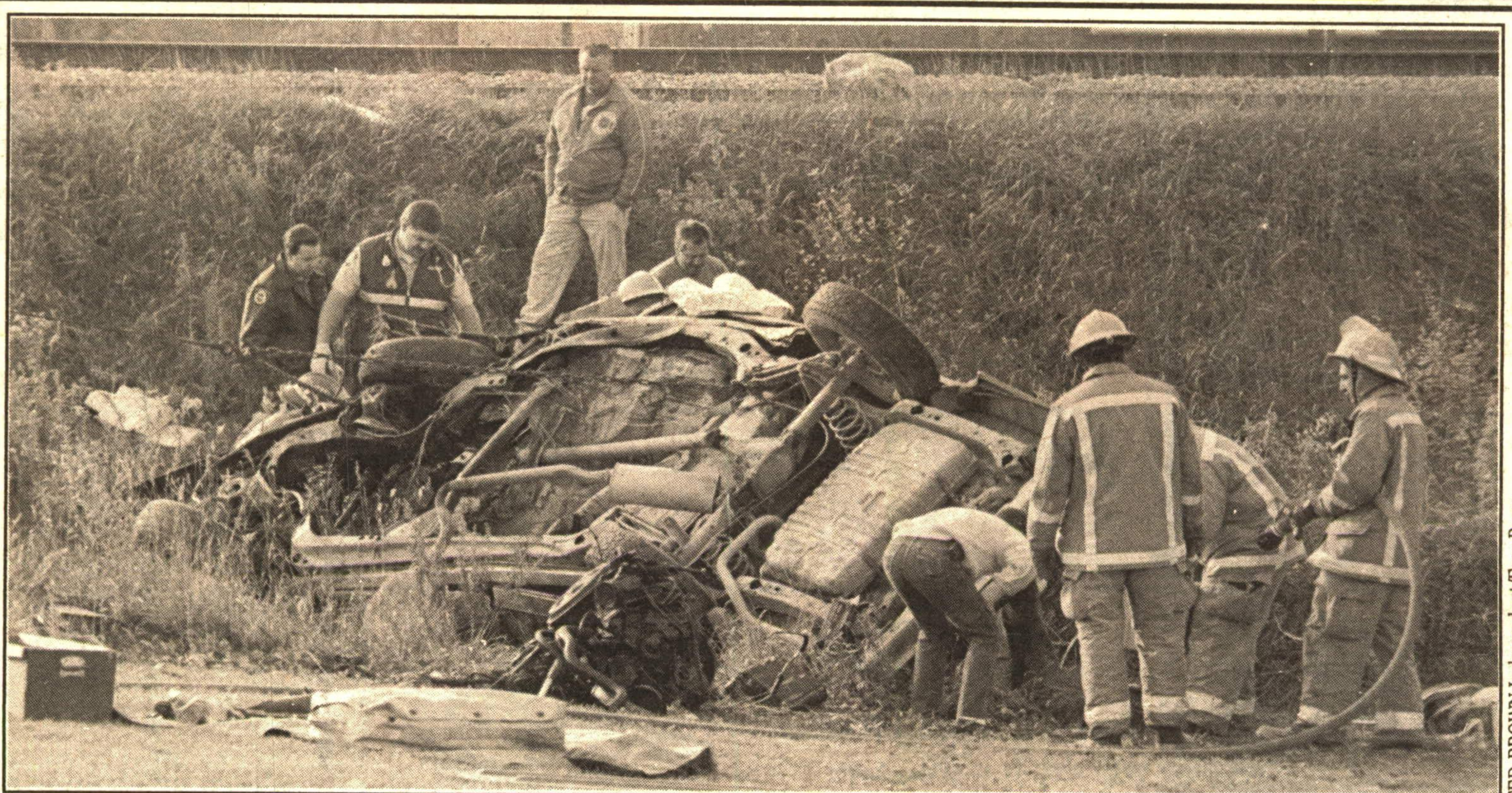
Firefighters and ambulance attendants work to free a woman trapped in a vehicle following a collision with a VIA/Amtrak train in Acton Friday morning.

Think fitness.....page 2 Officially open.....page 11 Entertainment.....page 12 Rebels rolling.....page 17