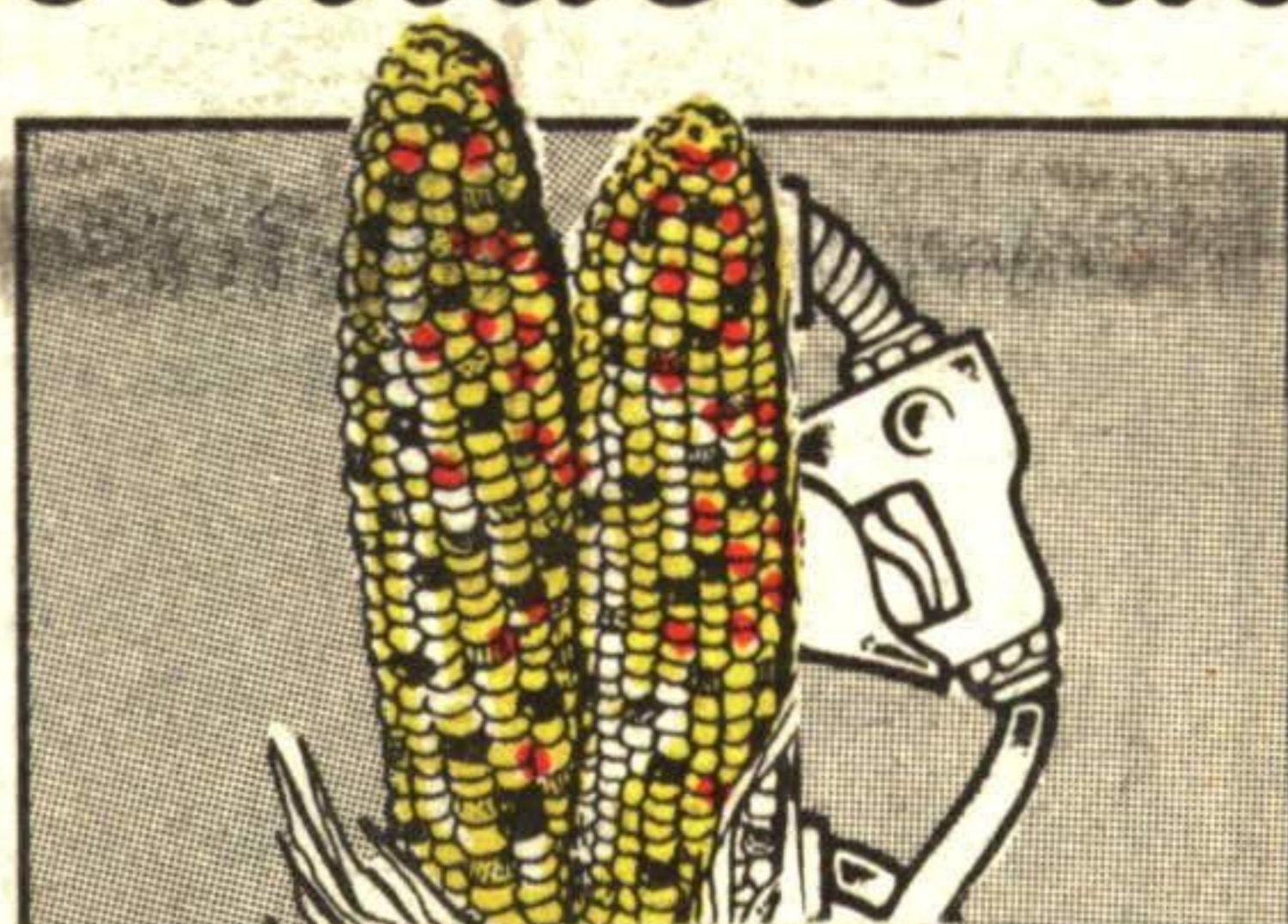
To produce the green fuels, gasoline is blended with five to 10 per

Although priced to compete with conventional mid-grade and premium gasolines, these two ethanol-blended gasolines have a distinct environmental and economic advantage for Ontario. They carry the EcoLogo designating them as an Environmental Choice product. Their use cuts carbon dioxide and carbon monoxide tail-pipe emissions by up to 10 per cent and 30 per cent respectively.