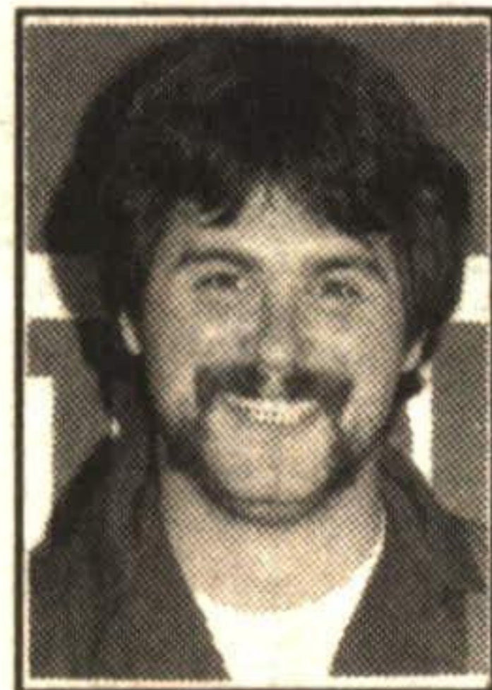
NORM 7 yrs. experience