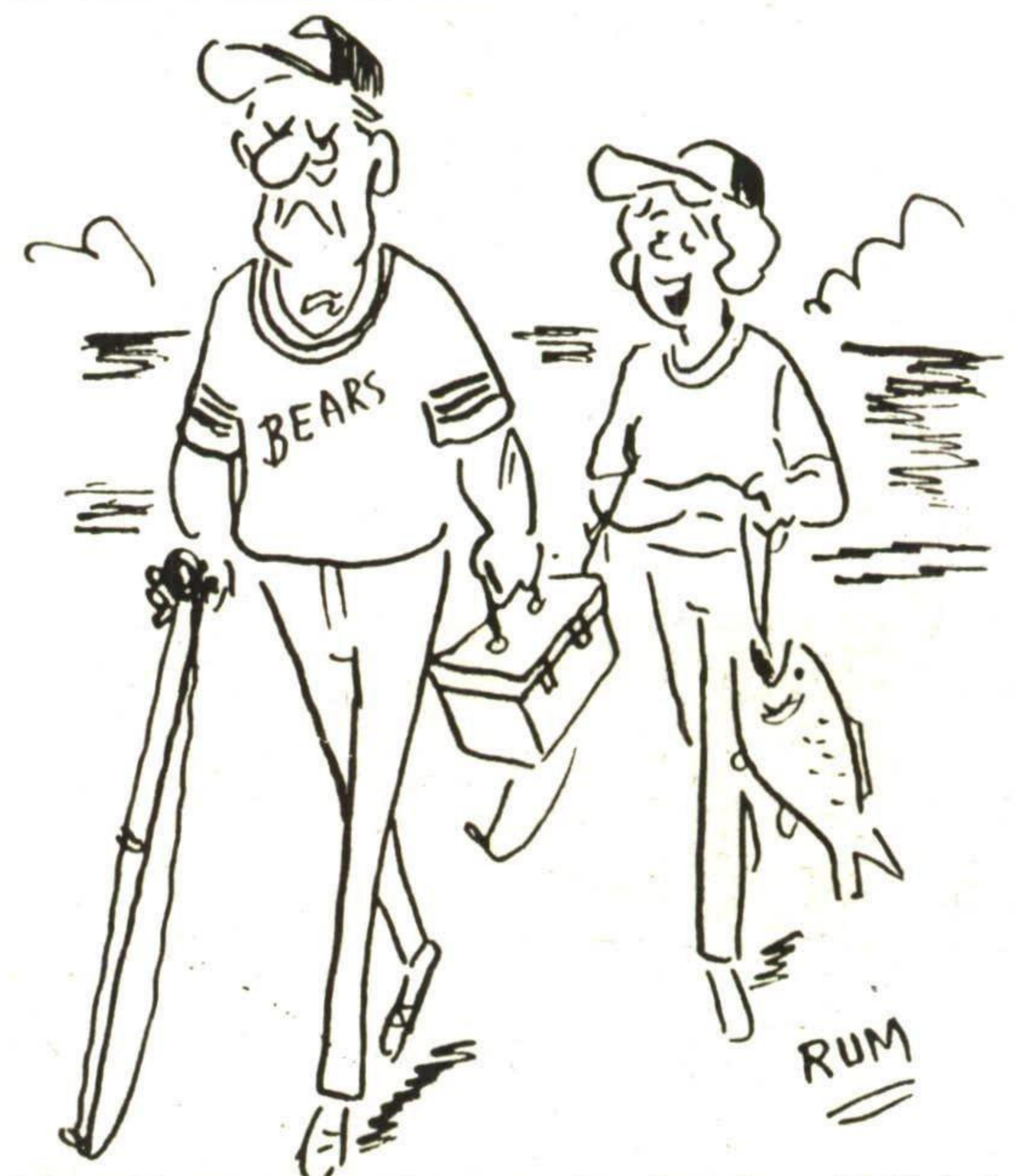
"You told me to do what you do—but I couldn't help catching this one!"

"Your Hometown Real Estate Professionals"