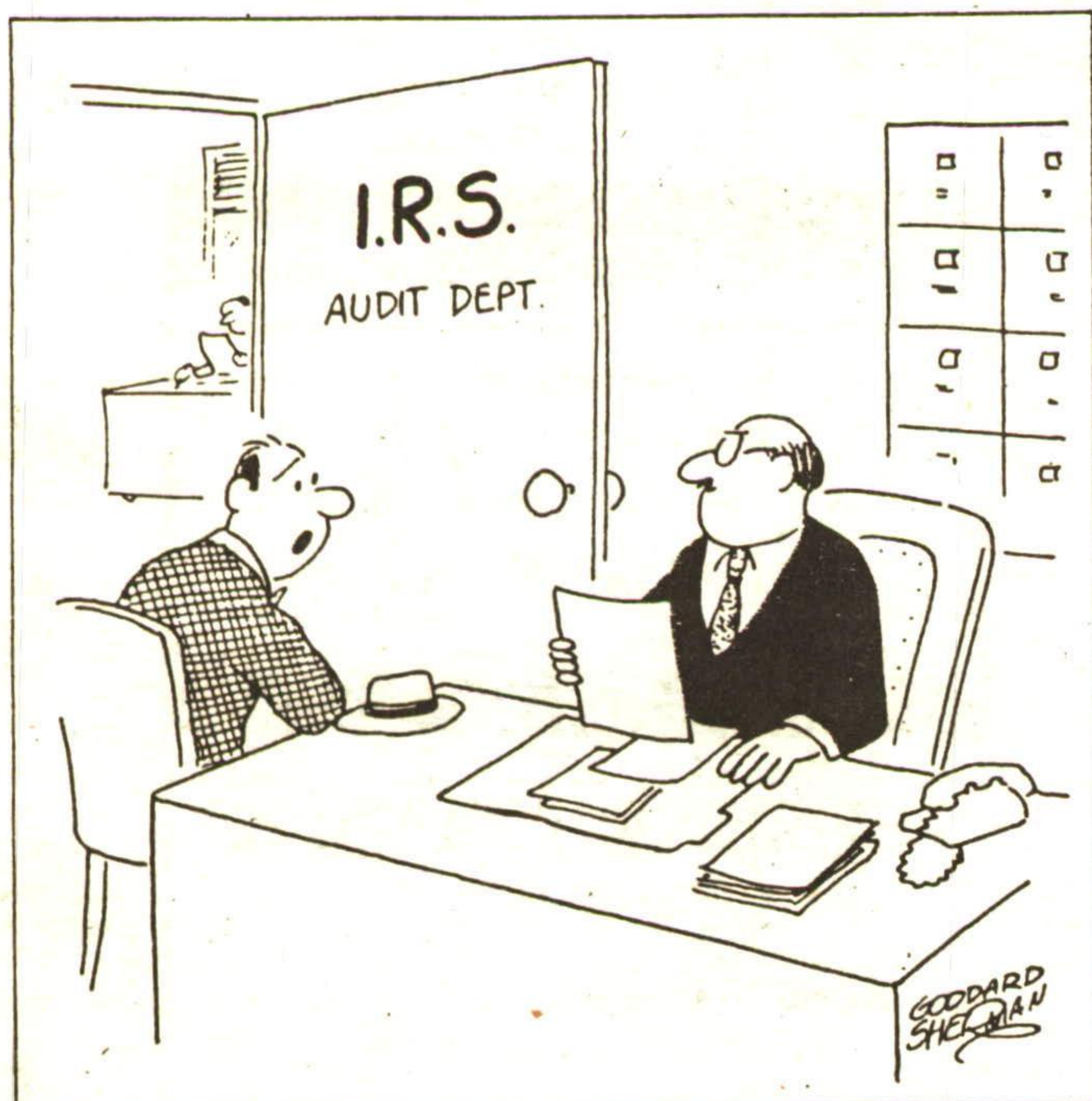
"Am I still middle class?"

The creation of the detachment follows a government decision, to reorganize RCMP operations, moving the provincial headquarters to London, and forming new detachments at Bowmanville, Newmarket and Milton. This will help reduce federal policing costs, while also easing housing and commuting expenses for RCMP personnel and public servants employed by the national force. The RCMP perform several federal policing functions ranging from drug enforcement to unemployment insurance fraud investigations.