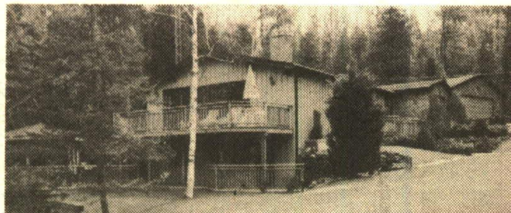
PONDS, TREES & PRIVACY

This 3 bedroom country squire has an eat-in kitchen overlooking the family room, beautiful hardwood floors and a fabulous garden. At only $199,900. you should see it soon. 9845