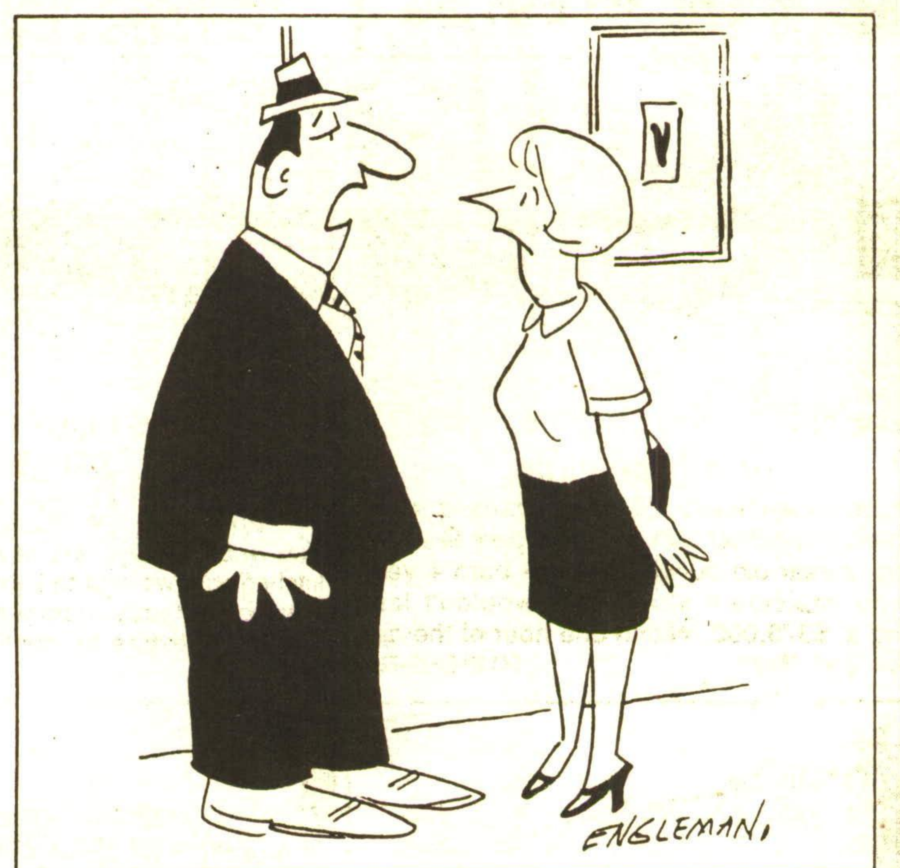
"My doctor told me to slow down or else and my boss told me to speed up or else!"