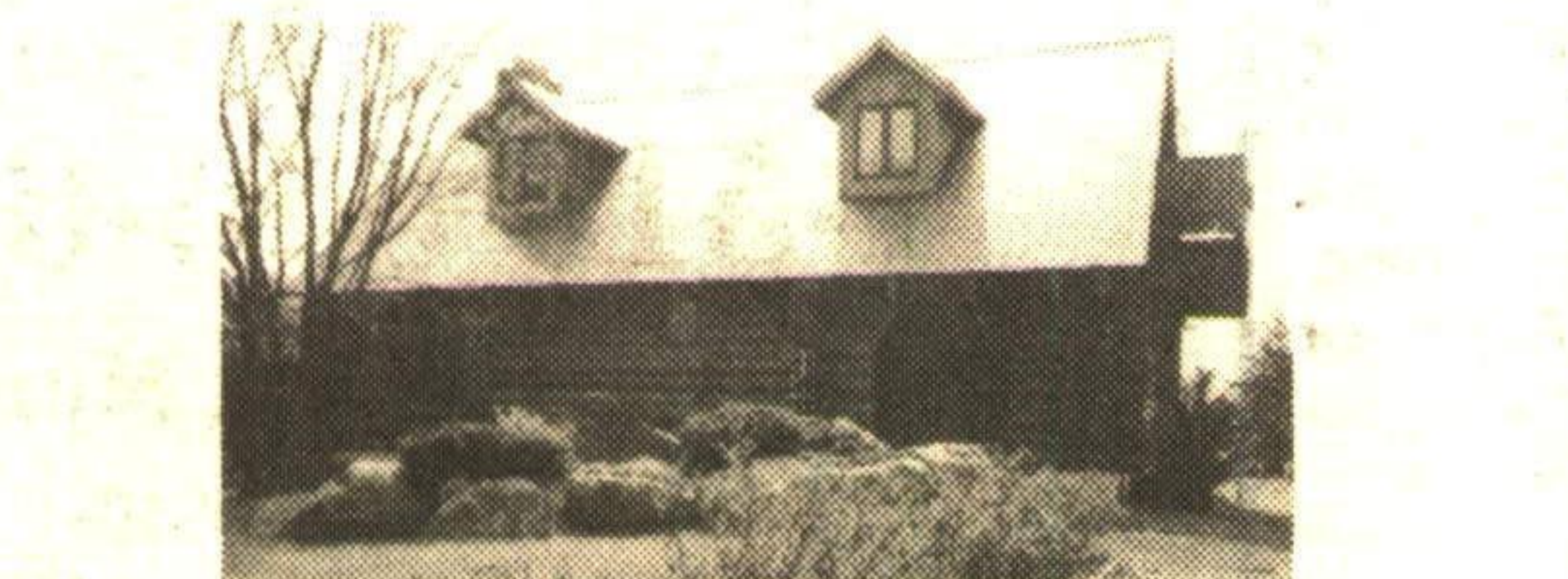
IF YOU LOVE LOG...

Call now to see the last new home in this builders clearance. Almost 3000 sq. ft. - main floor family room, 4 bedrooms, 2 1/2 baths etc. etc. Only $249,900. CALL RENÉE GOOD* . 9705