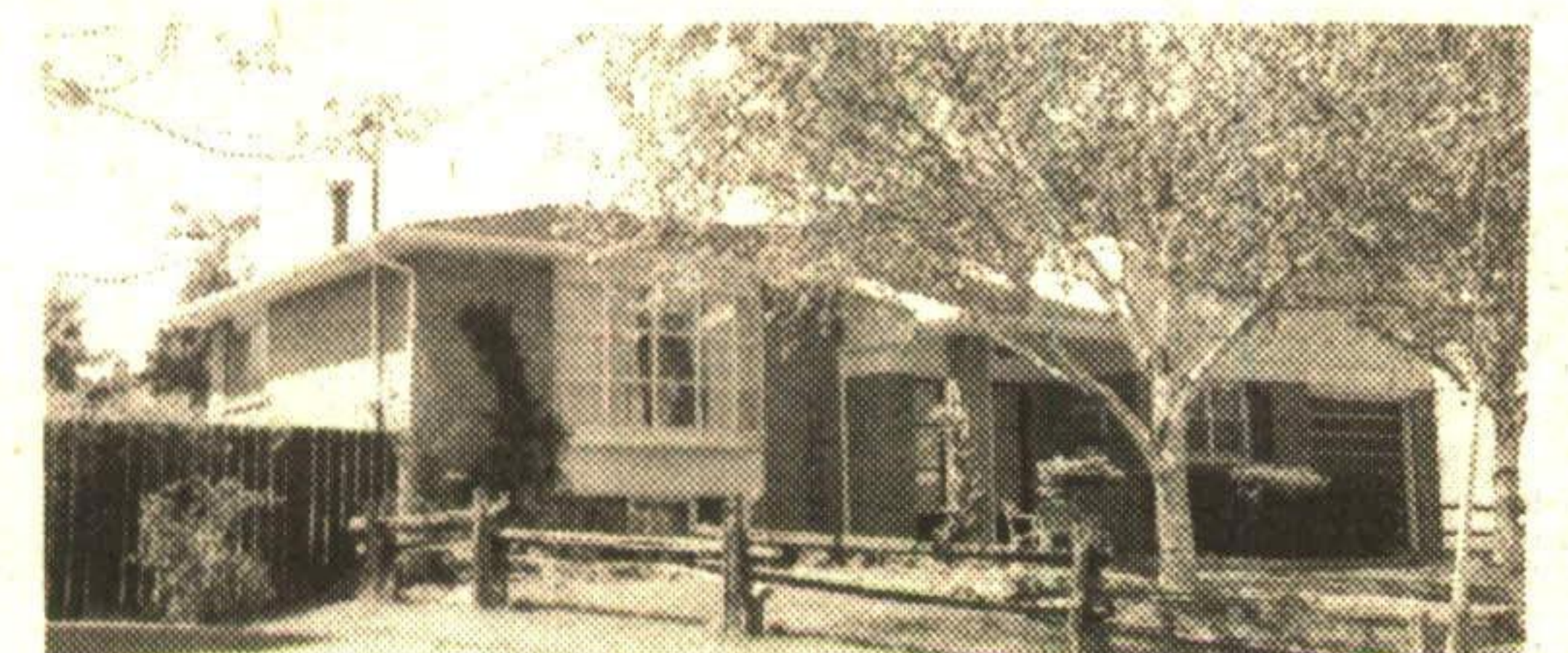
A SUMMER PARADISE

It's magic how good you'll feel in this custom built home on 22 rolling Erin acres with fabulous views. Over 4000 sq. ft. of luxury living space including a walkout lower level. Excellent value at $415,000. 9770