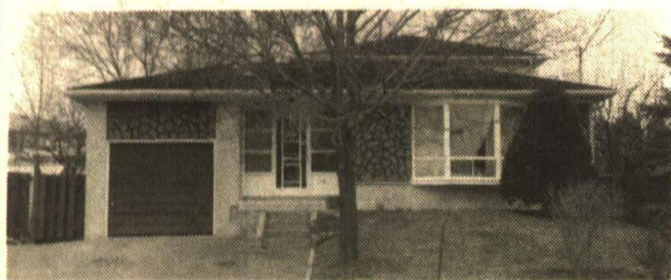
PIE SHAPED LOT

This 3 bedroom country squire has an eat-in kitchen overlooking the family room, beautiful hardwood floors and a fabulous garden. At only $199,900. you should see it soon. 9845