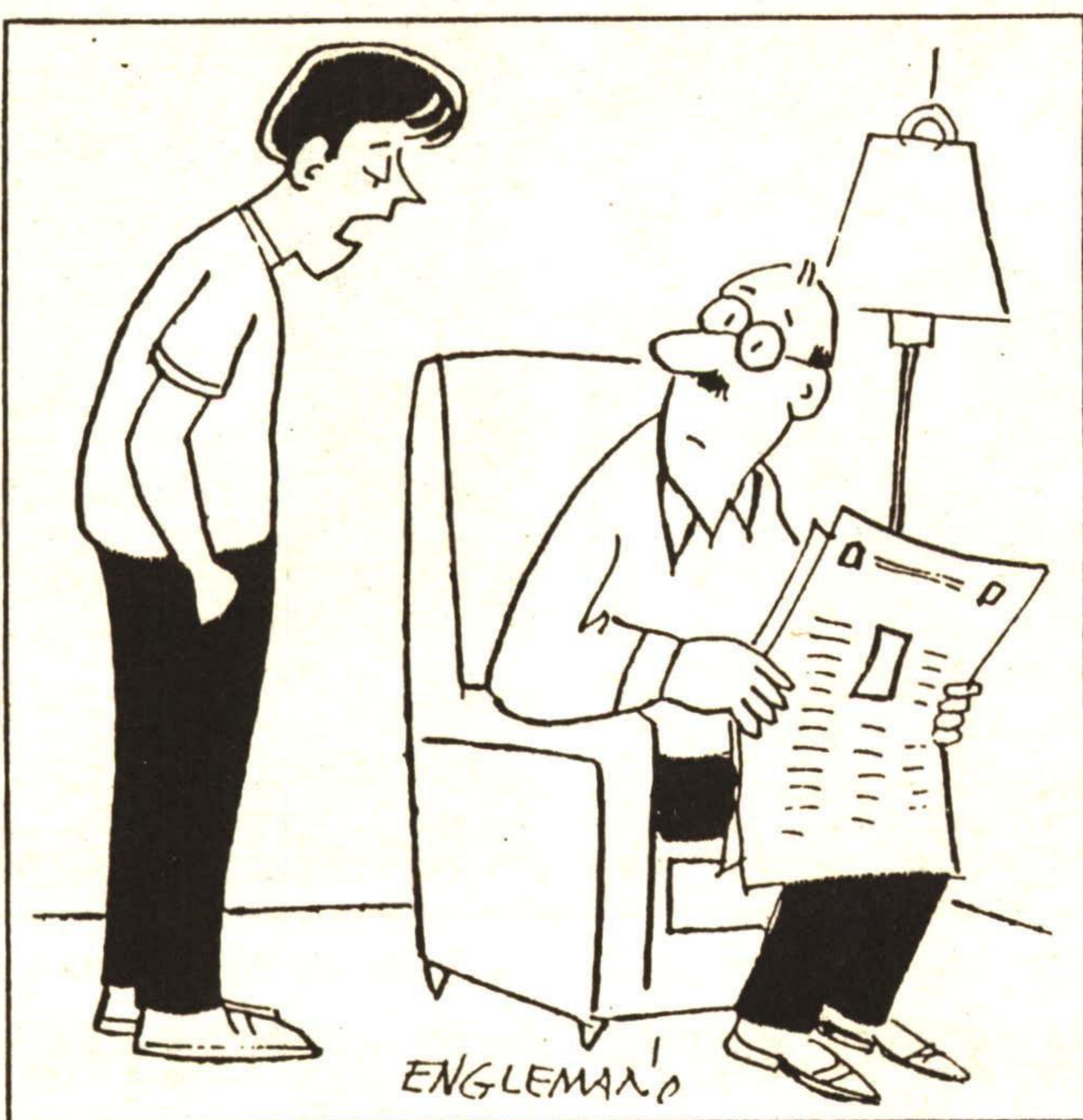
"If the dollar is worth so little, why do you make such a fuss when I ask you for a couple of bucks?"