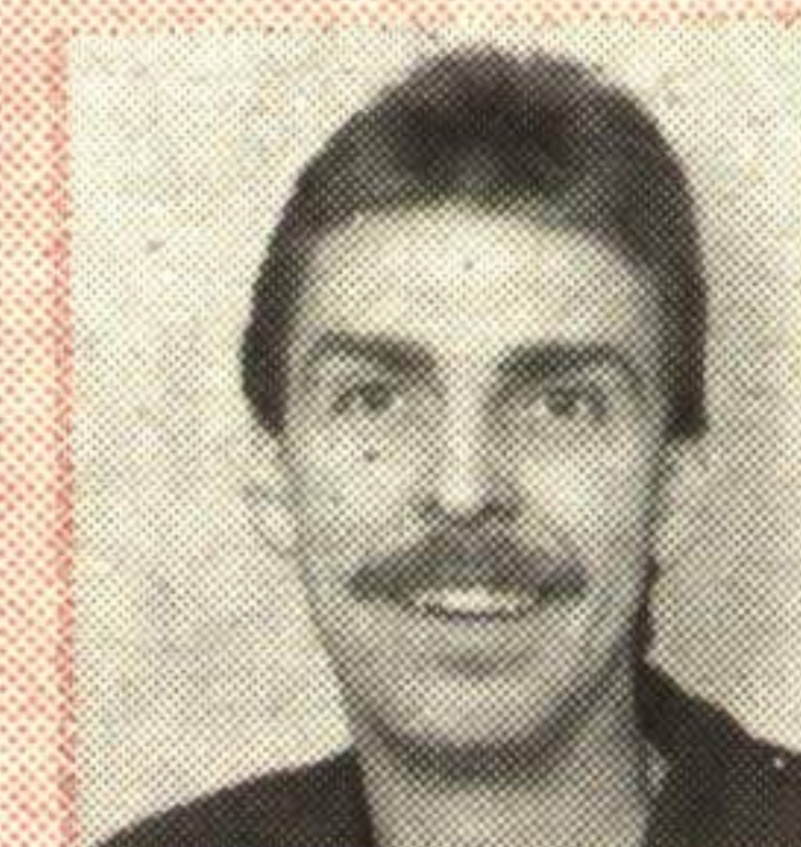
ROB Service Manager

The computer printout tells us exactly where your vehicle needs help to improved its ride and handling. It's a wise investment that could save your tire's tread life.