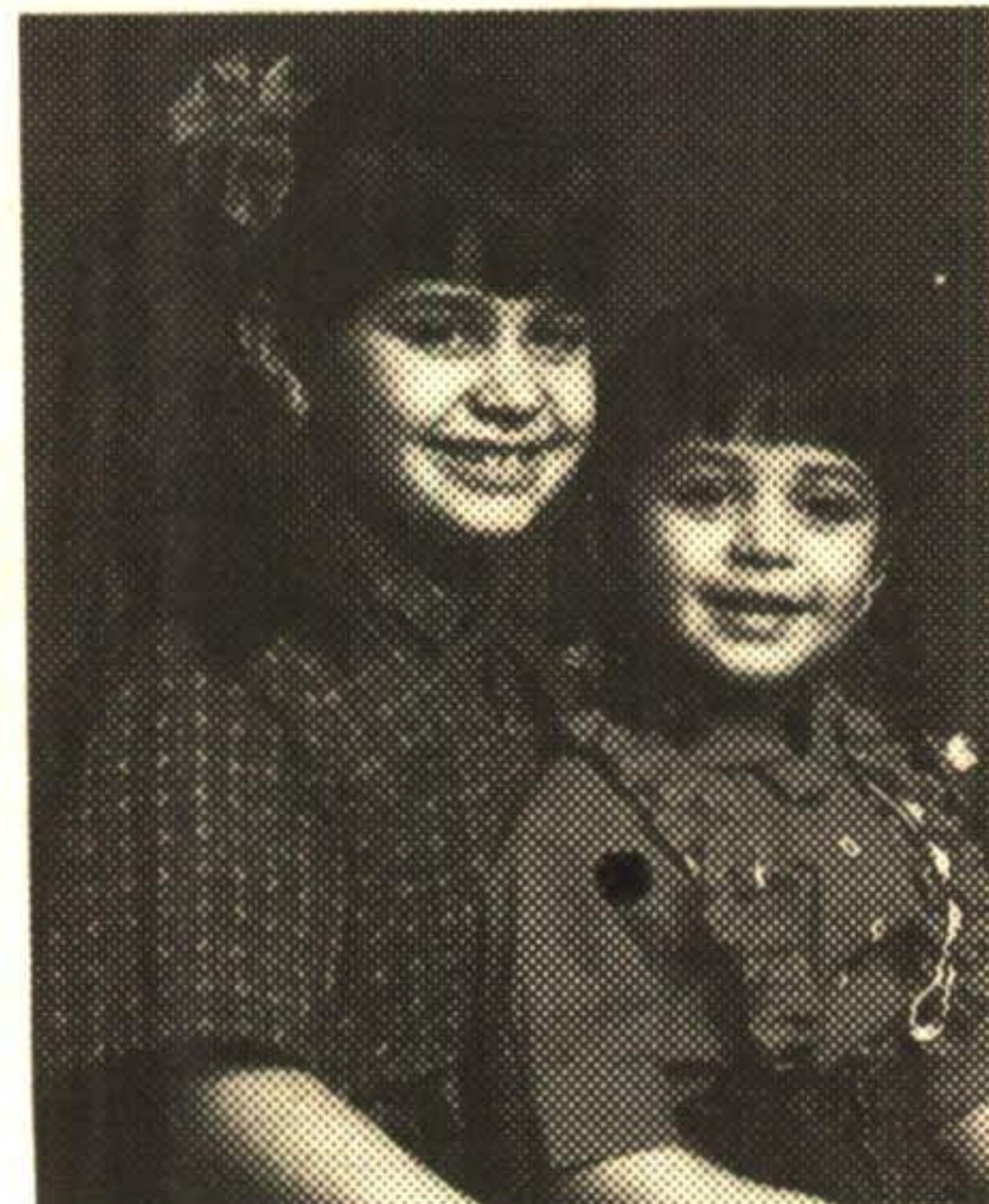
* PORTRAIT SIZES ARE APPROXIMATE. $2.00 Sitting Fee Per Person.

Special includes one 8x10*, two 5x7's* and 16 Wallets (2x1)* on traditional blue background only (1 pose). One offer per family. Additional portraits are available. Customer satisfaction is guaranteed.