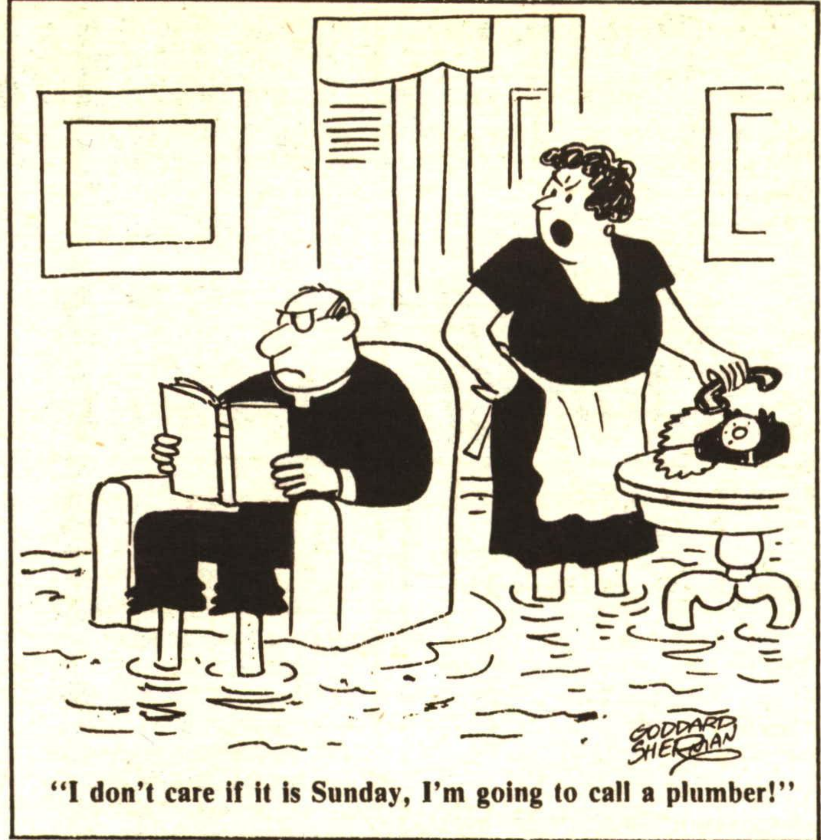
"I don't care if it is Sunday, I'm going to call a plumber!"