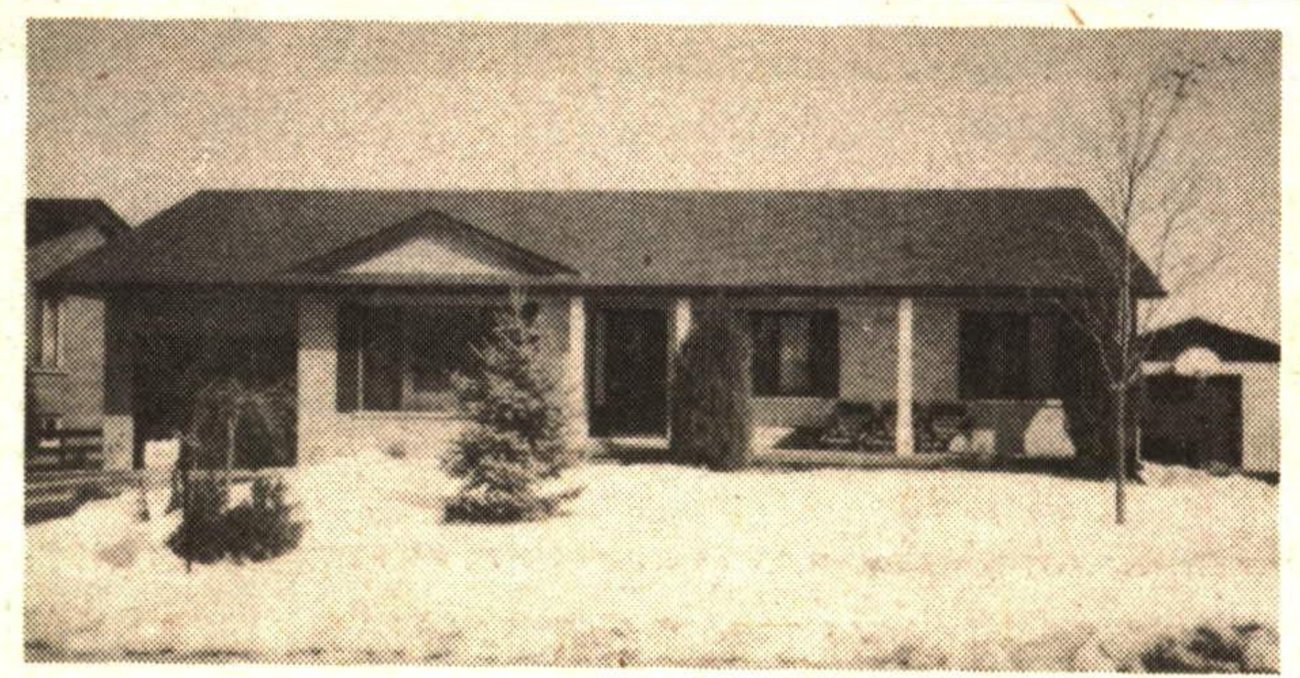
GREAT BUNGALOW ROCKWOOD

Pretty acreage some mature maple bush, about 10 ac; clear. Lge home features 3/4 b/rms, huge loft studio, potential for more rooms, 2 1/2 baths, finished basement, balcony, professional workshop. Asking $399,000. Open to offers. Gladys Scott, Sales Rep. 838-0198.