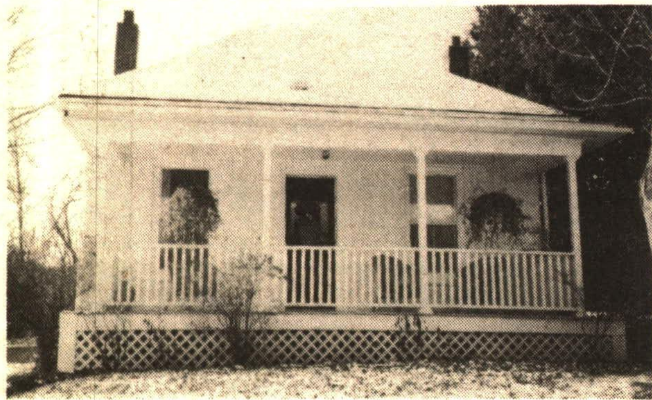
INGLEWOOD CENTURY JUST WAITING FOR YOUR ANTIQUES...

Custom built well maintained on lge village lot, lge dine in oak kitchen 2 1/2 baths whirlpool tub, high eff: heat pump, full a/c beautifully finished basement, many extras, walk to churches & stores. MOVE IN CONDITION. $235,000. waiting for your offer! Gladys Scott, Sales Rep. 838-0198.