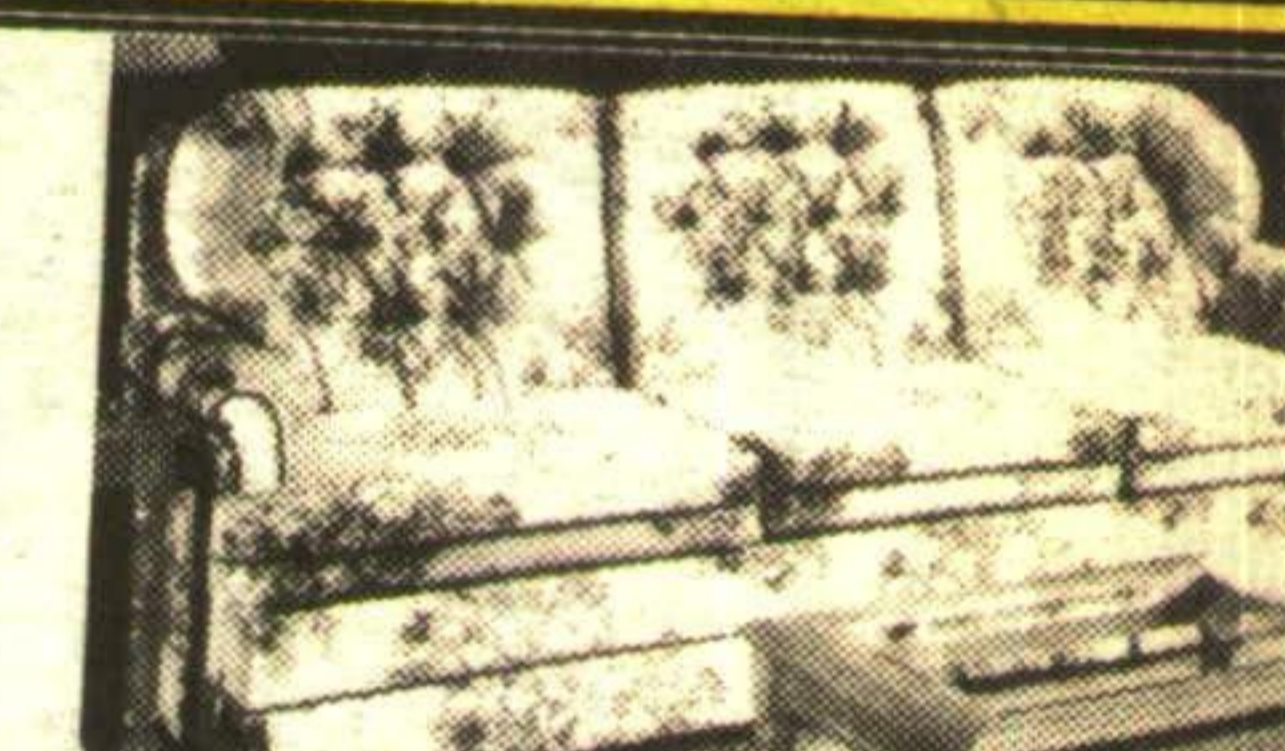
2 PC CUSTOM SOFA Many styles to choose from. Many, many fabrics to choose from. Starting from REG. $1099 2 Pc.

• 2 Tone Dining Room Suite, Buffet and Hutch drawers; 4 - Windsor Side chairs, available