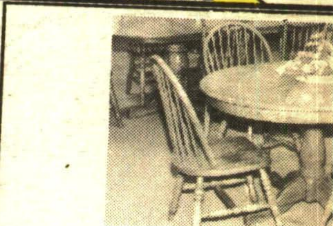
SOLID OAK KITCHEN 2-10" Leaves 4 Solid Oak Side Chairs Choice of Finishes REG. $1499.00