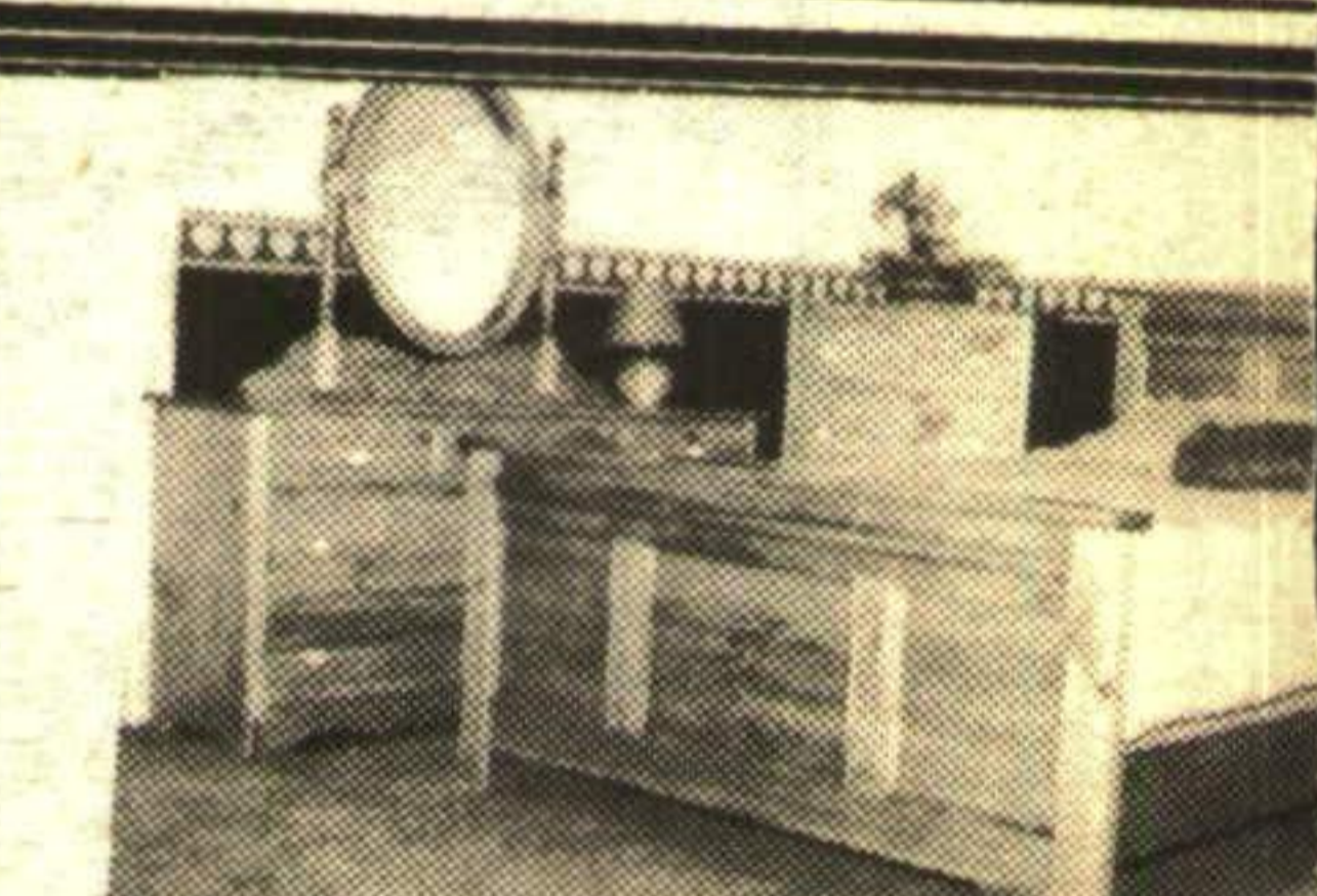
HAND CRAFTED PILGRIMAGE Solid Pine, Headboard, Footboard & Rails, Dovetailed 70" Night table. Choice of finishes. REG. $3459.00