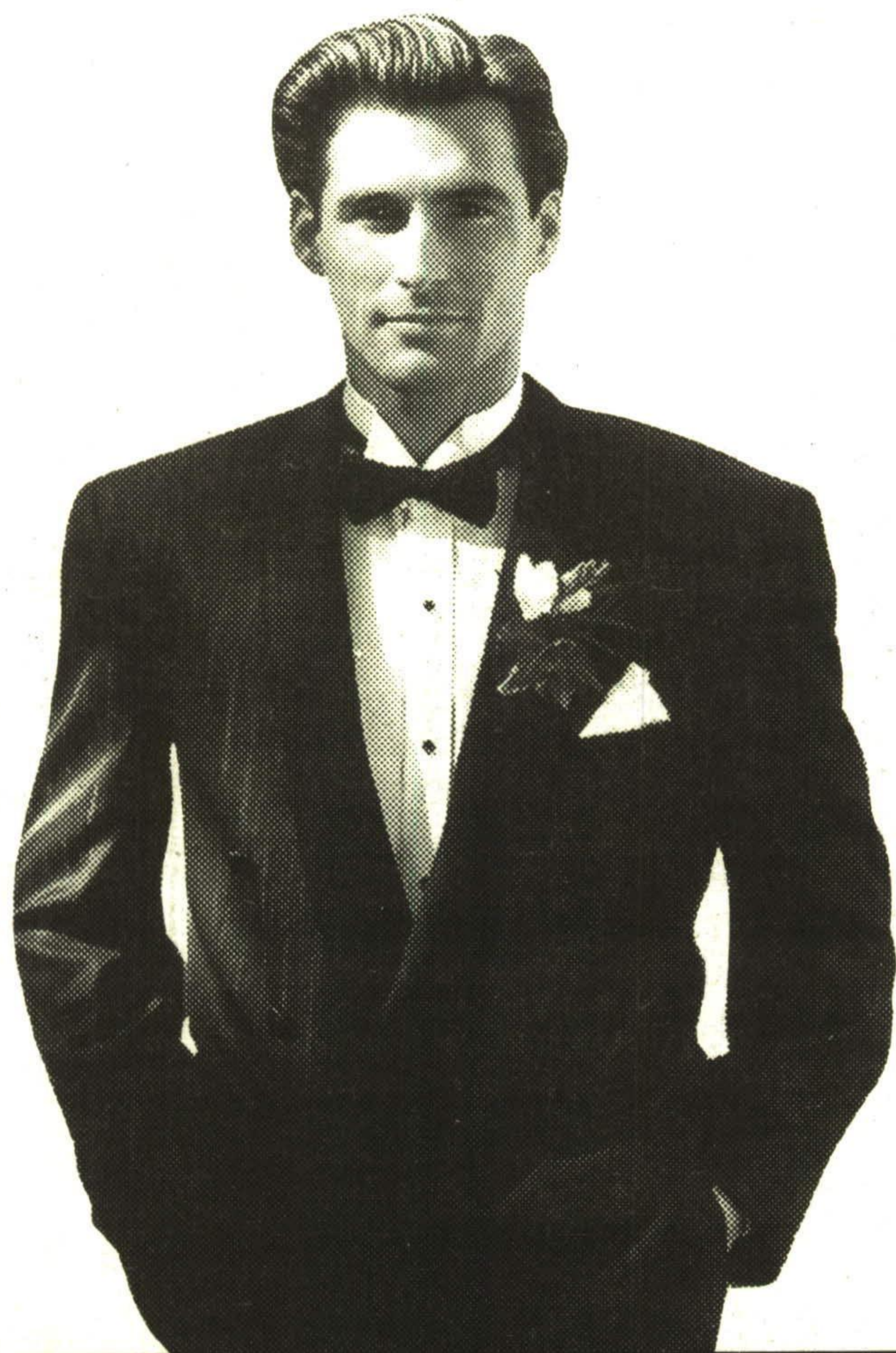
Adorato, from the Uomo Classico collection, a Classy exclusive