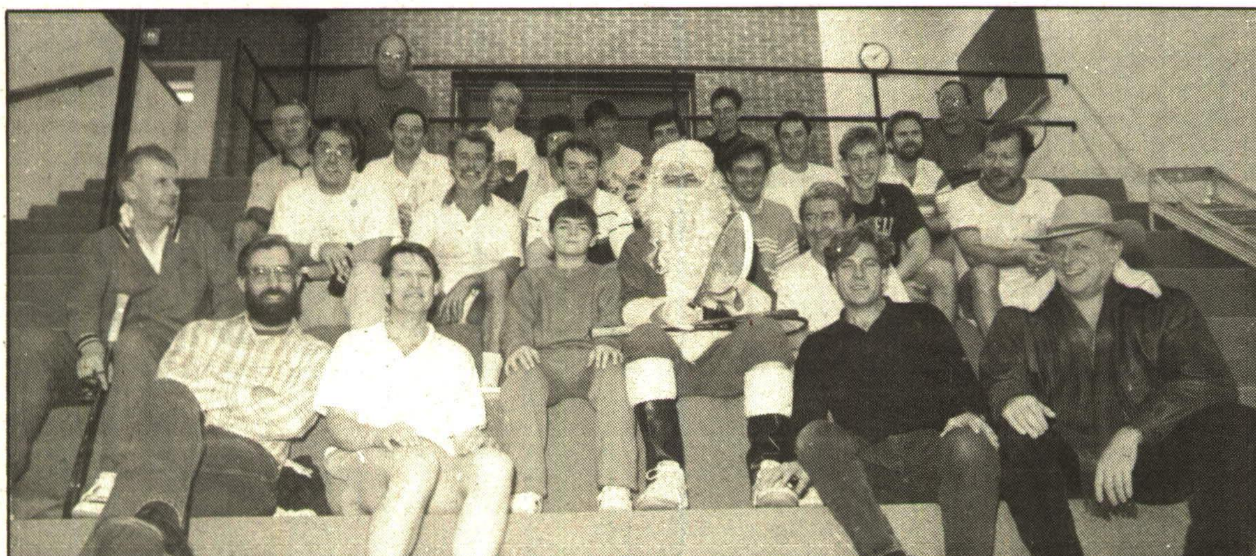
Men's house league players at the Georgetown Racquet Club greeted Santa Claus during their pre-Christmas open house. Fond of squash himself, St.Nick vowed to return in the new year to try and

The league resumes Jan. 6. That's your lot. A Guid New Year tae all.