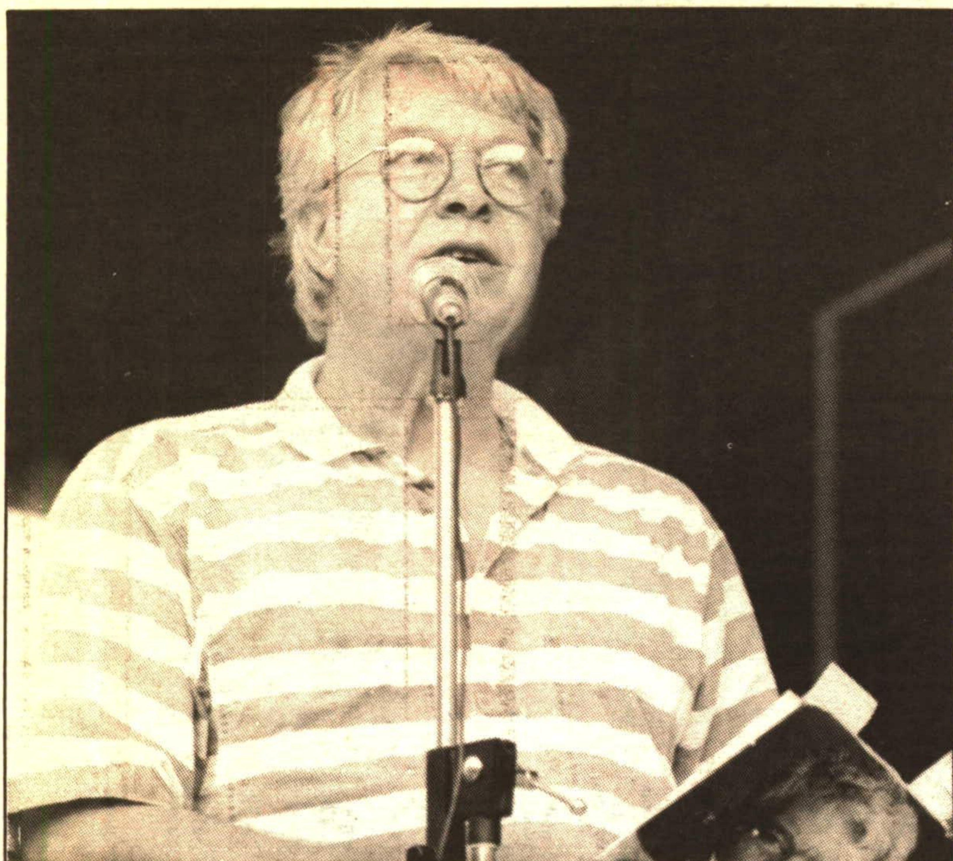
Timothy Findley made the trek to Eden Mills for the writers' festival. His novel, Not Wanted on the Voyage , is being transformed into a stage play.