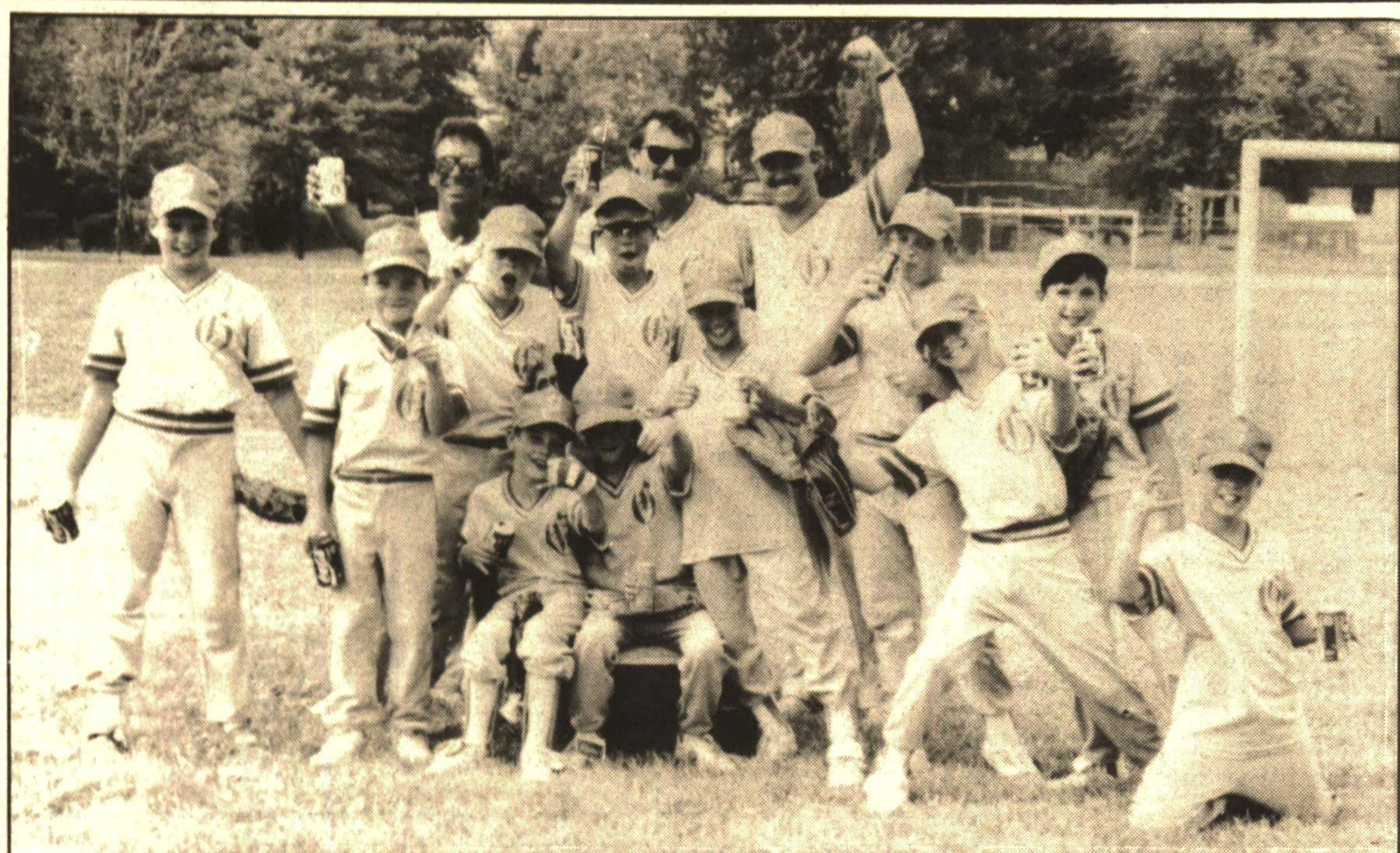
The Georgetown O'Tooles squad is looking pretty hot after some confidence-building wins.