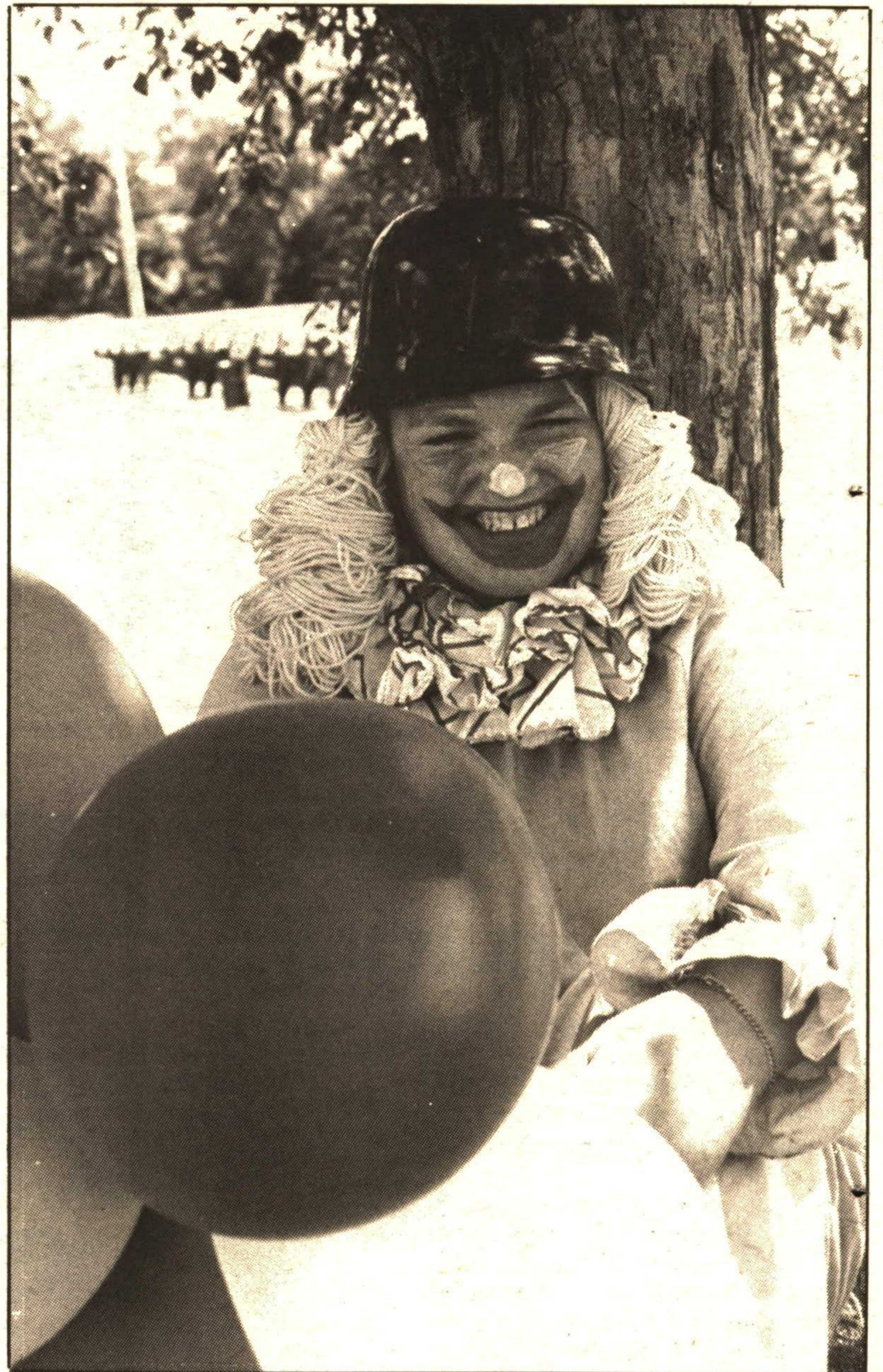
Come see the clowns at the Circus of Color summer carnival put on the Recreation and Parks Department, July 17, 7-9 p.m. at the Acton Community Centre. It will be a nickel carnival with all the participants from the Rec Department's various day camps in the area.

Out of ten, Terminator 2: Judgment Day rates a ten.