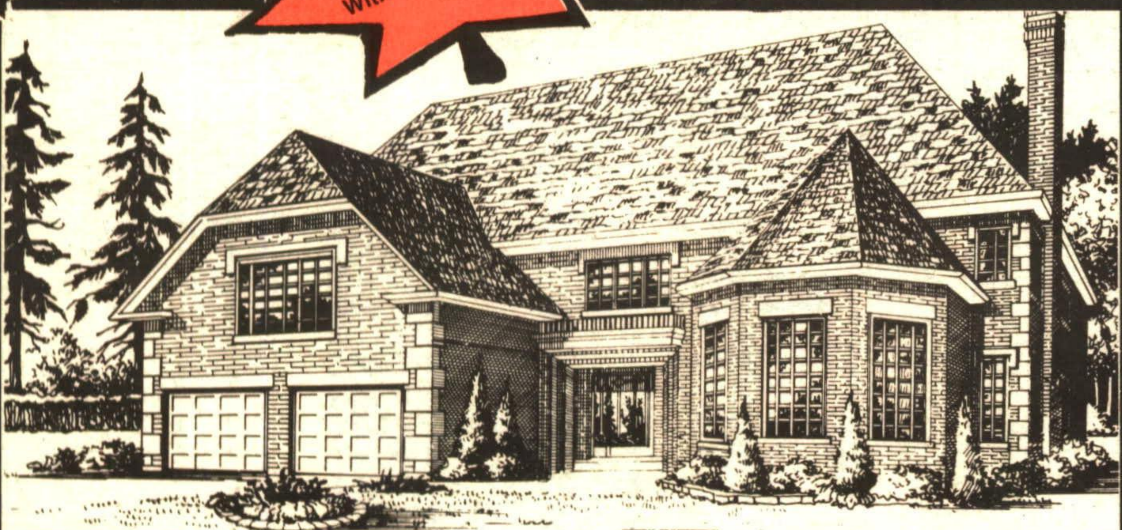
ARTIST CONCEPT ONLY