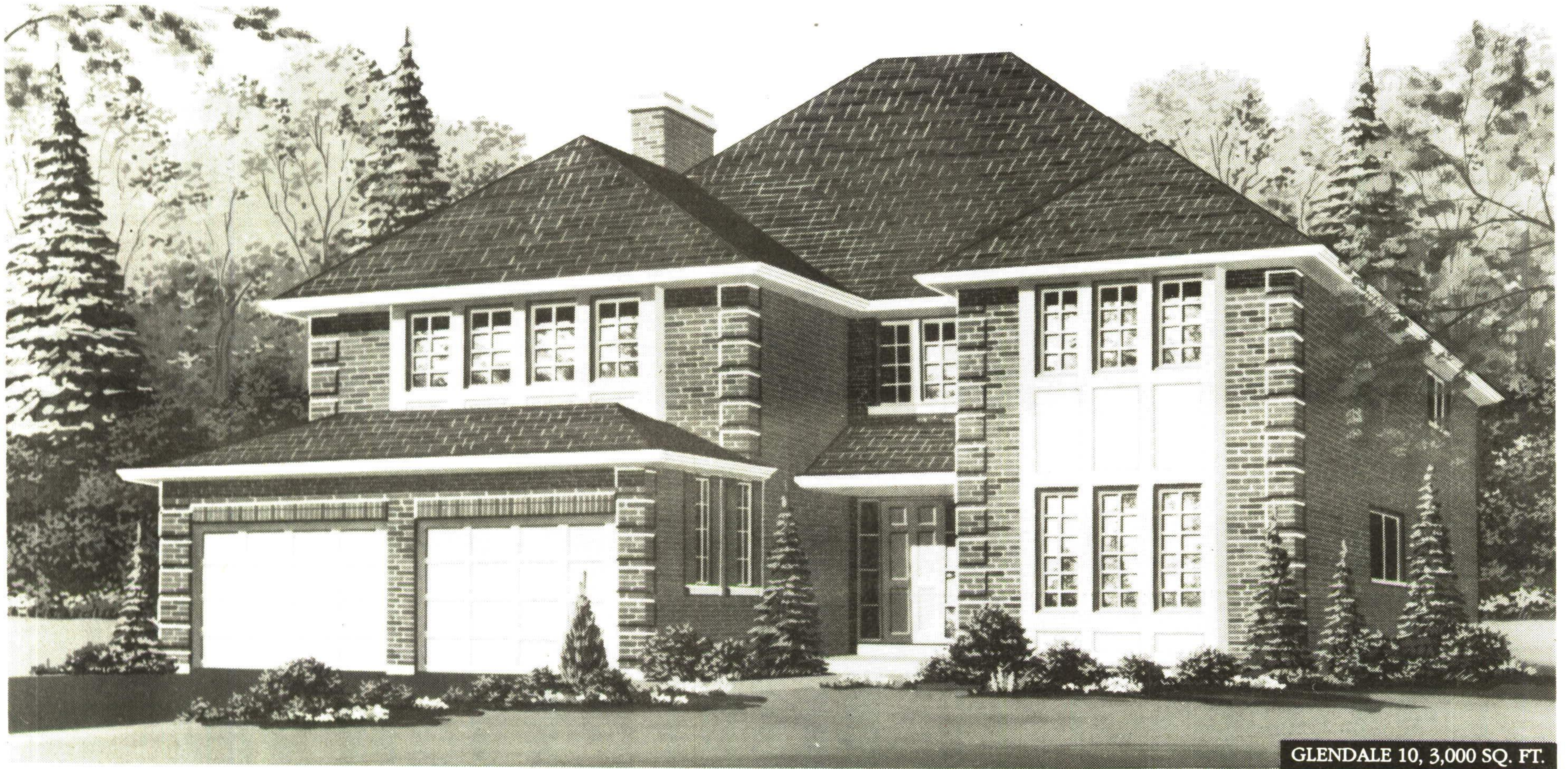
GLENDALE 10, 3,000 SQ. FT.

The public knows what it wants. And at River Oaks, our buyers have helped make us the most sought-after neighbourhood in Oakville!