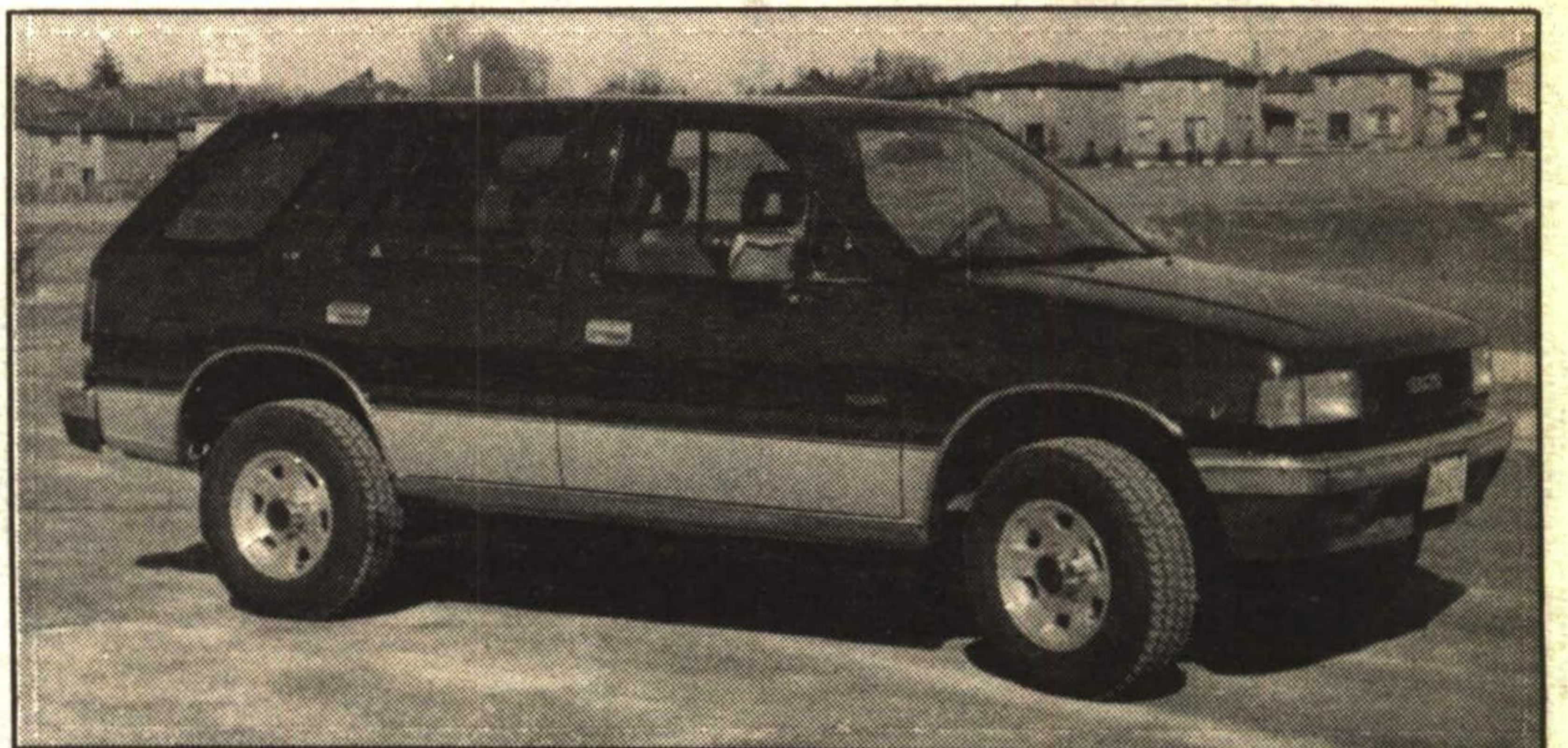
The Isuzu Rodeo LS 4X4 is a significant improvement over its last four-door offering, the Trooper.

Passport realizes they are in an explosive, lucrative, and highly-competitive marketing niche, and they have brought the Rodeo up to snuff in order to be a player.