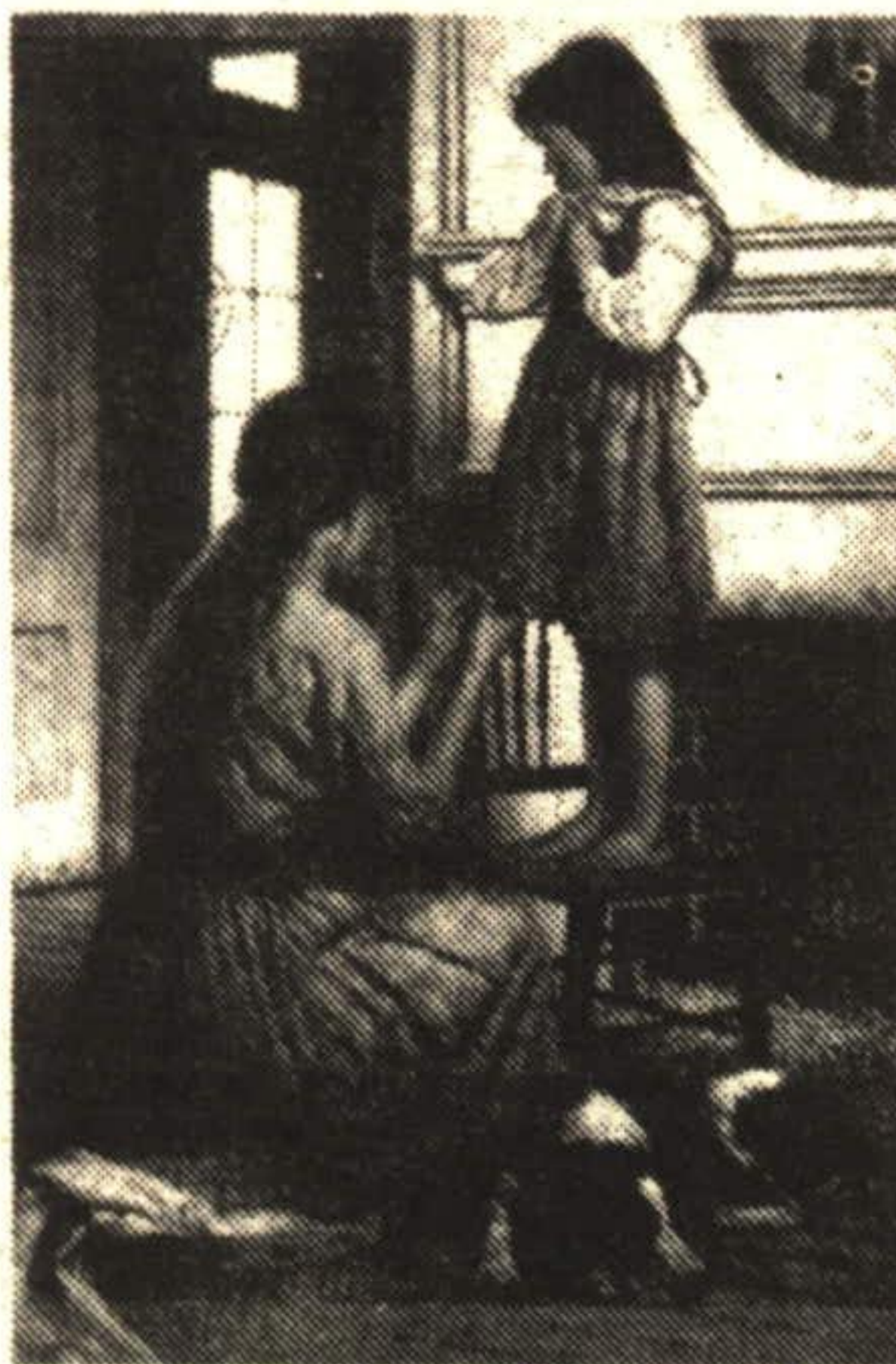
"HOMEMADE" $185.00 Unframed

An excellent selection of his artwork will be available for purchase during the show.