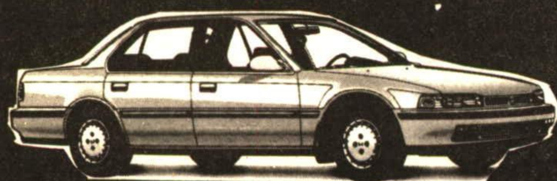
EX ACCORD 1991

1986 CAVALIER Z24 HATCHBACK 2.8 Ltr. 4 speed Special Edition Low kms.