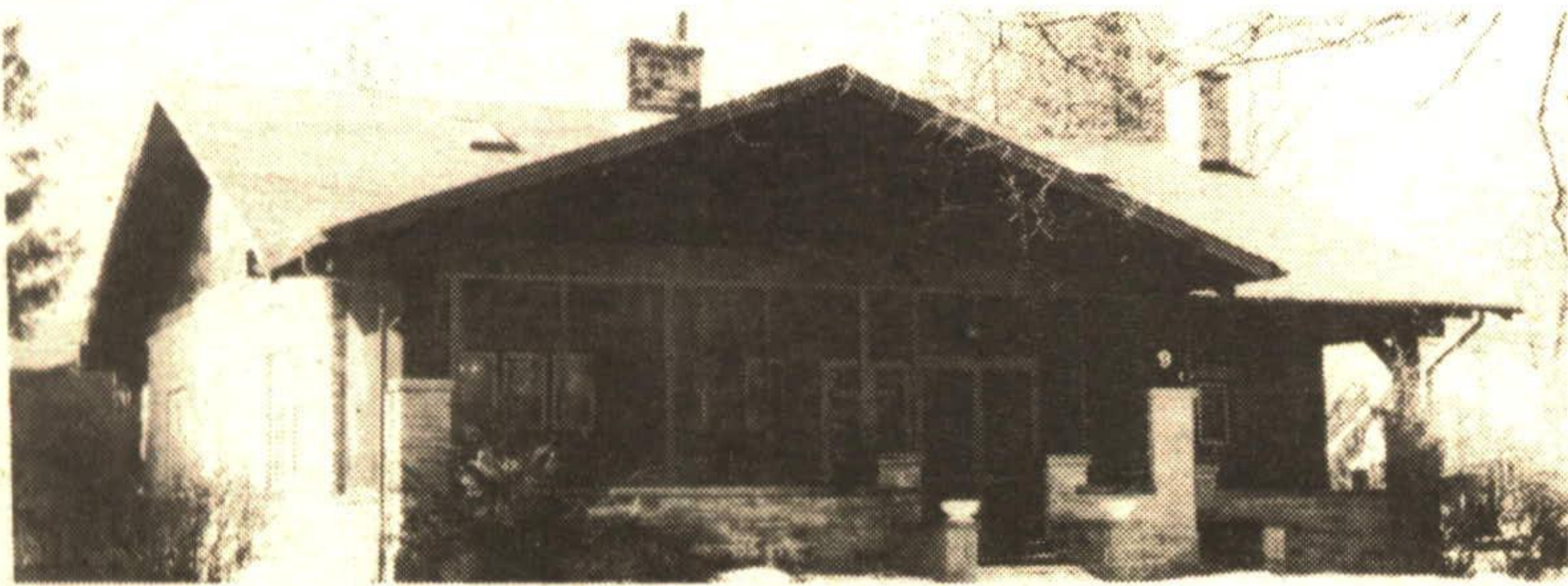
GRACIOUS STONE HOUSE

Georgetown has one of 92 Red Cross branches in Ontario, part of a $65 million a year operation that not only supplies blood and emergency services where needed, but also loans out sickroom equipment and medical supplies, helps veterans, seniors and home owners, and coaches the public on water safety and boating safety. Remember, March is Red Cross Month.