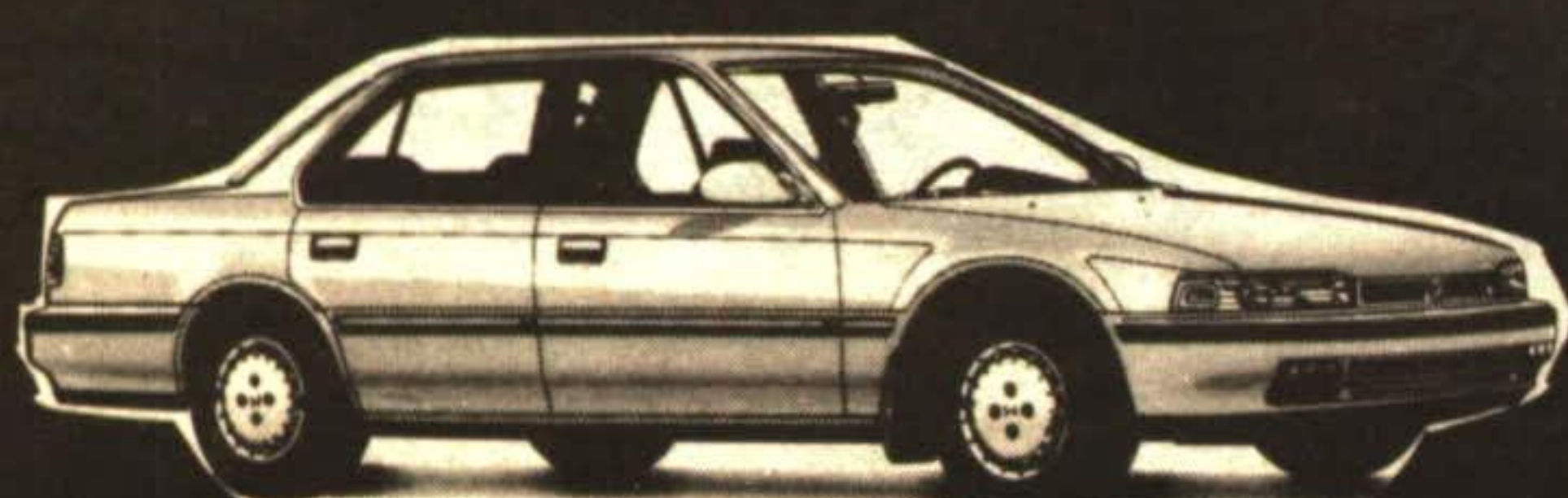
EX ACCORD 1991