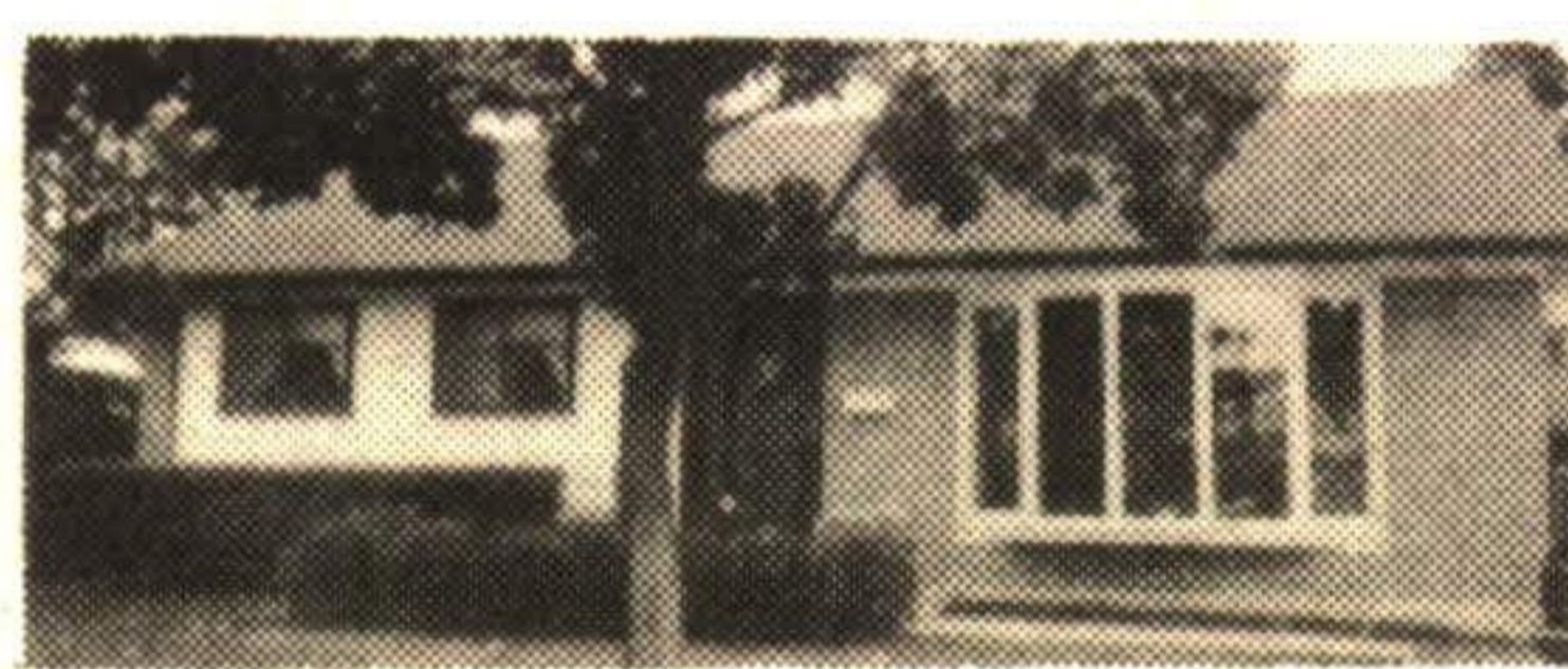
QUIET STREET, GREAT NEIGHBOURS

Country living 10 minutes from town. 1800 sq. ft. of very comfortable living space. 3 bdrm., main fl. family rm./2 fireplaces. Bright and clean, just move in and enjoy! $248,000. Call Ursula Zeidler* to show you. 90-449