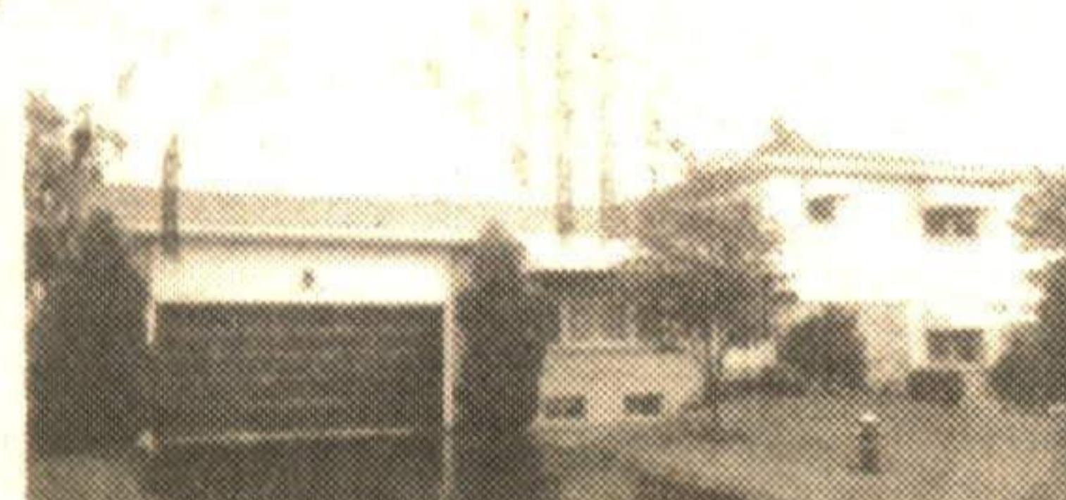
BRAMPTON BEAUTY JUST LISTED

Vendor also will help with mortgage. 85 acres with century home, woods, pond, barn. Call for all the details, ask for Cathy*. 89-437