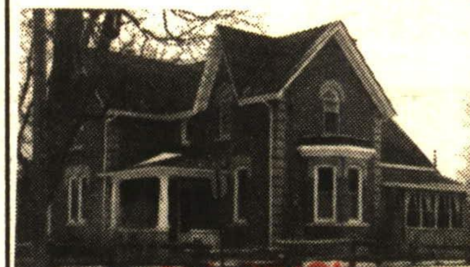
ALL BRICK VICTORIAN

* Sales Representative ** Associate Broker