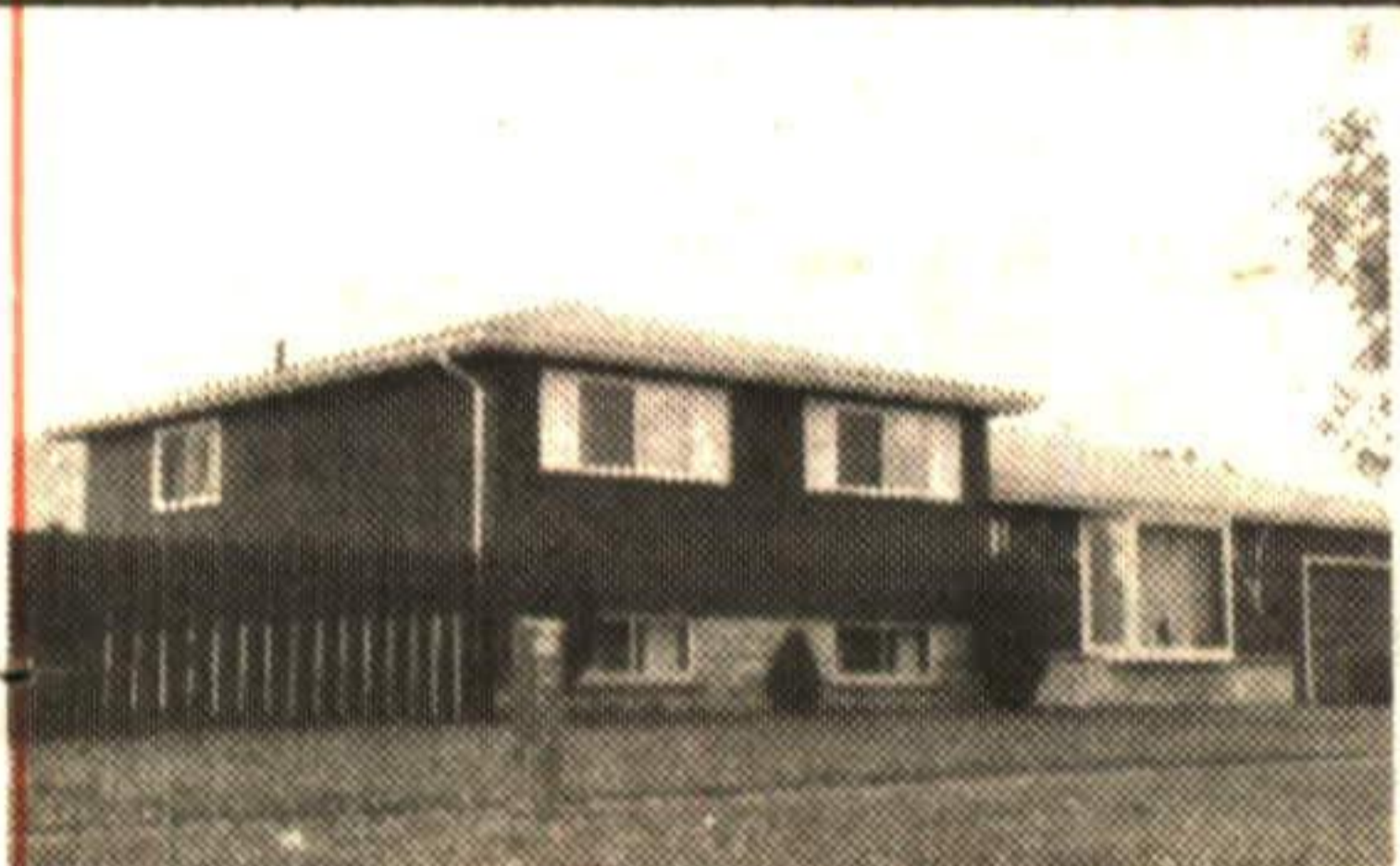
MANY MAJOR UPGRADES