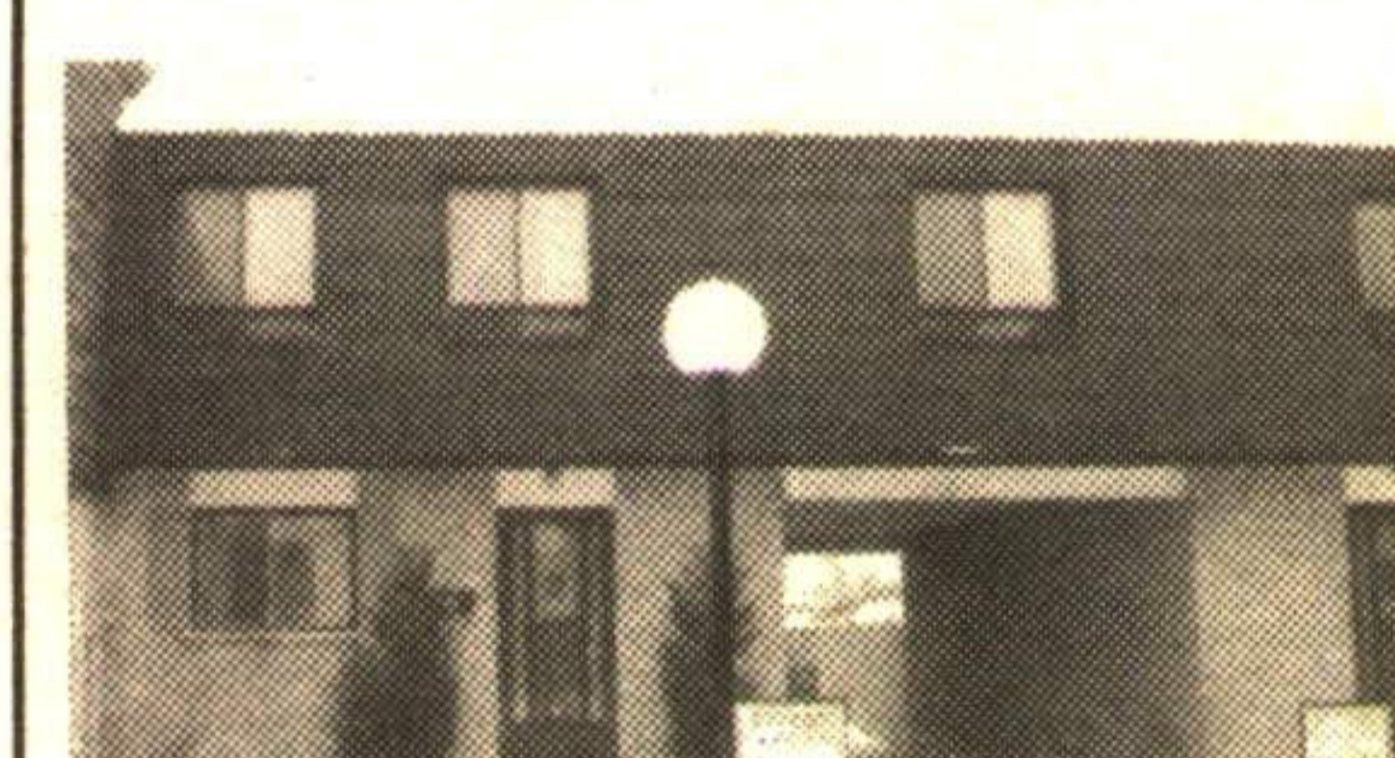
NEW LISTING - 4 BDRM. TOWNHOUSE...

Gracious 4 bdrm. custom home with fireplace in main fl. family room, central air & vac, main floor laundry. Beautifully landscaped and fenced lot steps to schools, park, shops, cultural centre and more. Call Sandra Nairn*. 90-247