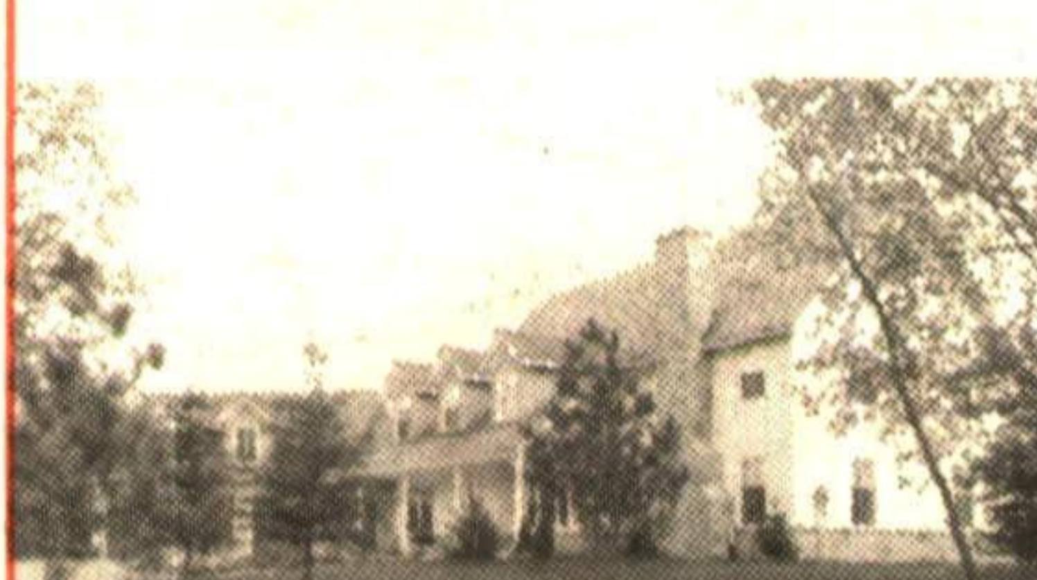
A SUPERB RESIDENCE