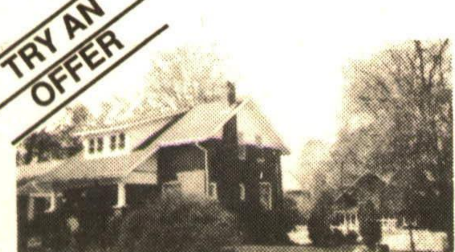
TRY AN OFFER

Grand country style 4,000 sq. ft. home with pine floors & doors and a grand view. Tom Comery* 90-150