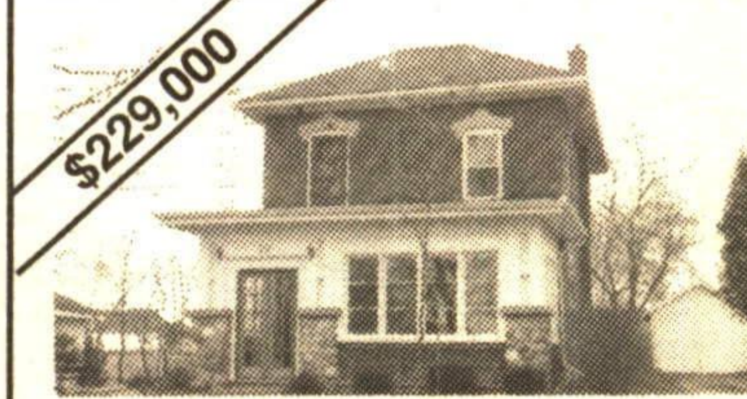
SMALL TOWN COUNTRY CLASSIC

Sunlight greenhouse kitchen and family room overlooking ravine, separate dining room with French doors, whirlpool ensuite, full walkout basement, located in prestigious neighbourhood. Gloria Foreman*. 90-275