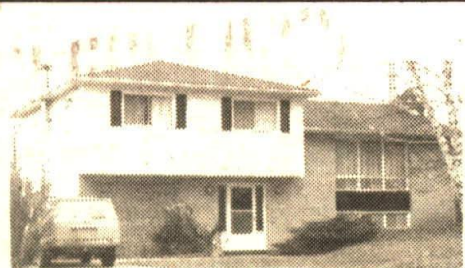
NATURE RIGHT AT YOUR DOORSTEP

New roof, new windows, new broadloom, extra bath, sparkling 3 bedrooms, remodelled kitchen and main bath. Also appliances included. Call Ev Patterson* for more details. 90-394