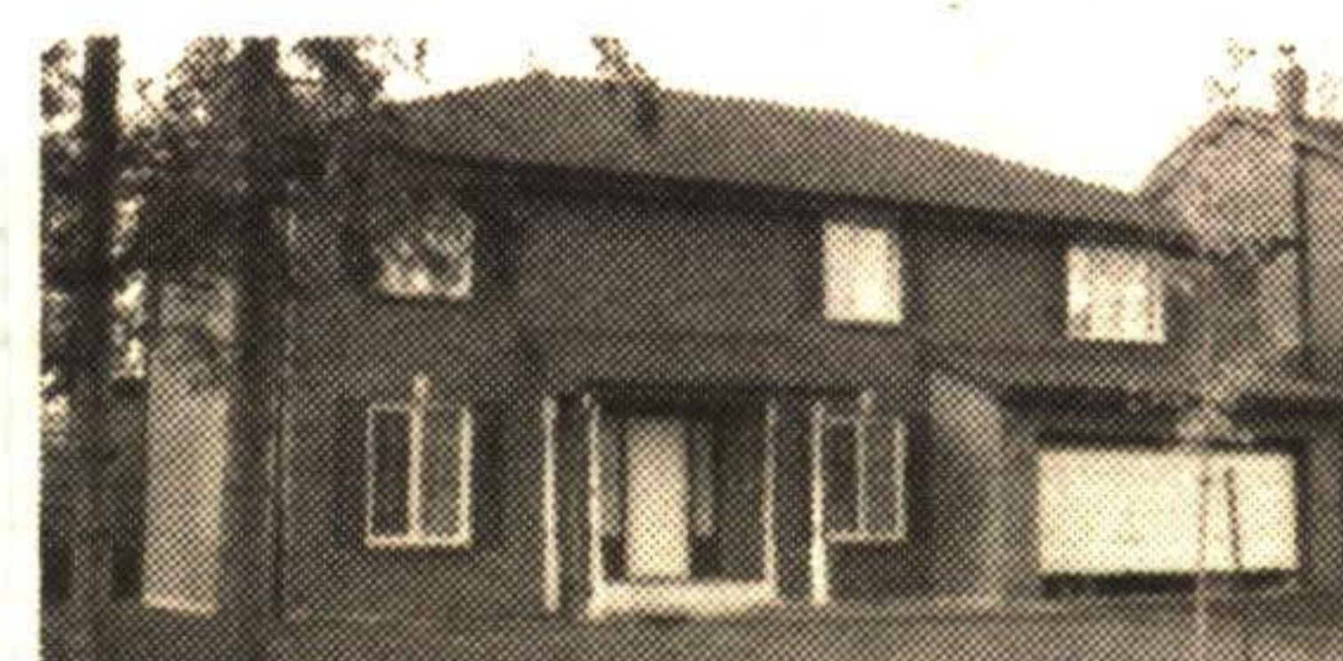
DO YOU HAVE A LARGE FAMILY?

3 bedroom bungalow - shows beautifully. Large private lot. Finished rec room with bar, includes 6 appliances, all window coverings and electric light fixtures - a must to see! Call Pam Reid*. 90-422