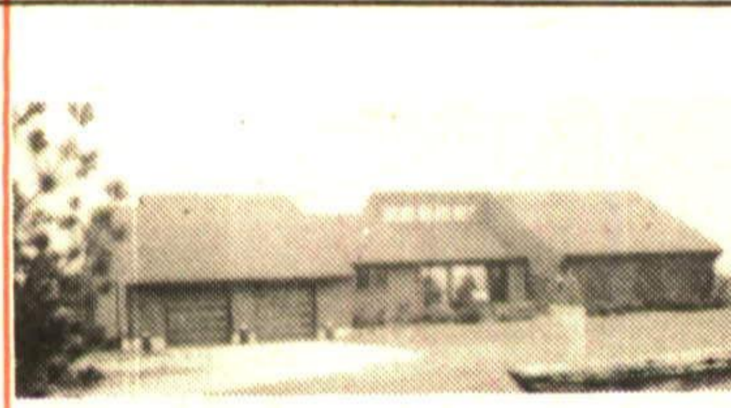
COUNTRY AT ITS BEST!

in mint condition. 2 bathrooms. Include 5 appliances and window coverings. $145,000. Call Iris Irwin*. 91-112