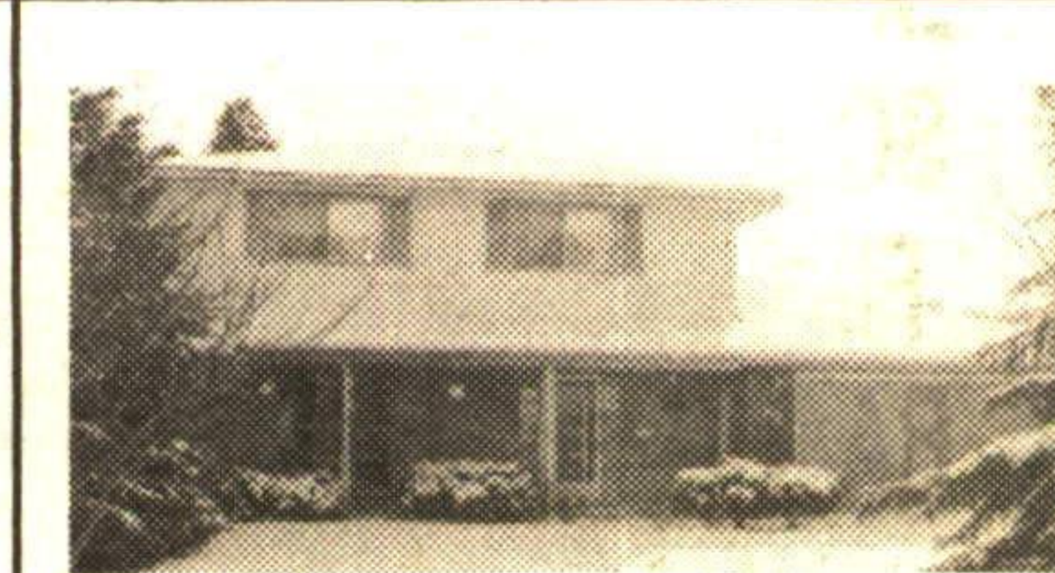
400 FT. OF SPARKLING STREAM...

Oak staircase, upgraded carpets, central vac, family room with corner fireplace, double garage. Serious vendors. Asking $224,500. Call Bill Henderson* 453-1286. 90-434