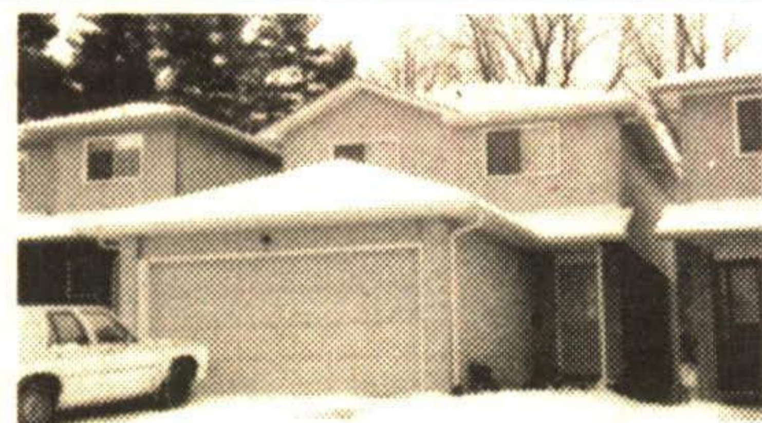
LOTS OF "LIVING" ROOM

Spacious 4 bedroom home, quiet court location, great curb appeal, double car garage. Suitable for in-law accommodation. Motivated vendors. Call Evelyn Henderson*. 90-450