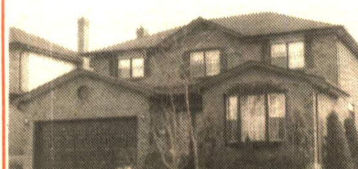
SPACIOUS AND GRACIOUS

Beautifully appointed brick home set on an exquisite lot protected by century old Maple. Picture your family gathered in the gorgeous dining room accented by pocket doors. Magnificent woodwork, dbl. garage, new cook's delight kitchen and lots of French doors are just some of the many features. Michele L. Smith*. 90-446