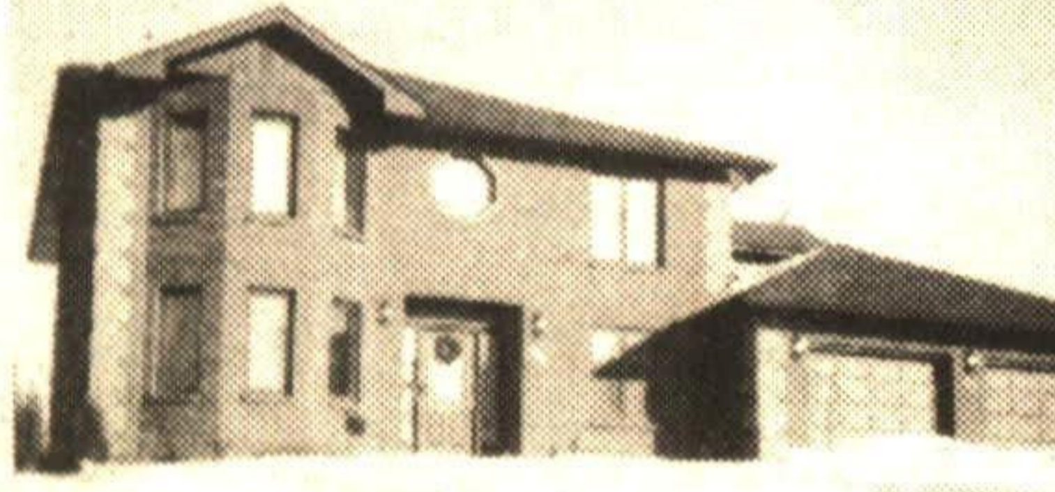
OH MAN! WHAT A HOUSE!

This 4 bdrm. stately home has been decorated to perfection. Greenhouse kitchen, ensuite, central air, fireplace, ceramic tiled foyer with stunning skylight. Discriminating buyers only call Linda Armstrong* for your tour of luxury! 873-3070. 90-419