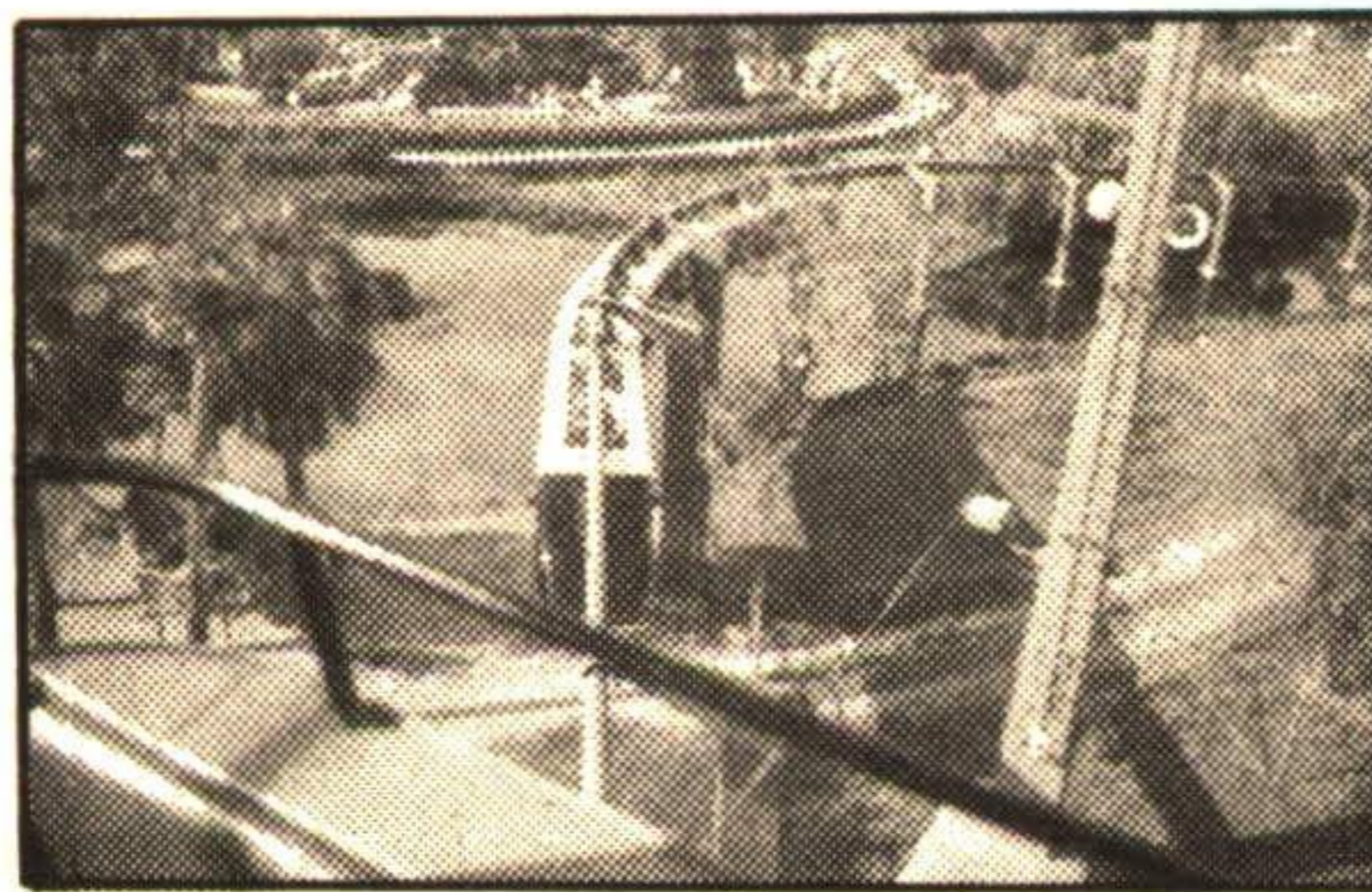
Guests may board the mono rail for a spectacular view of the animals roaming free in their natural setting.

Next week the travel page will continue the tour of Busch Gardens visiting four more areas of the park - Nairobi, Timbuktu, Morocco & the Congo.