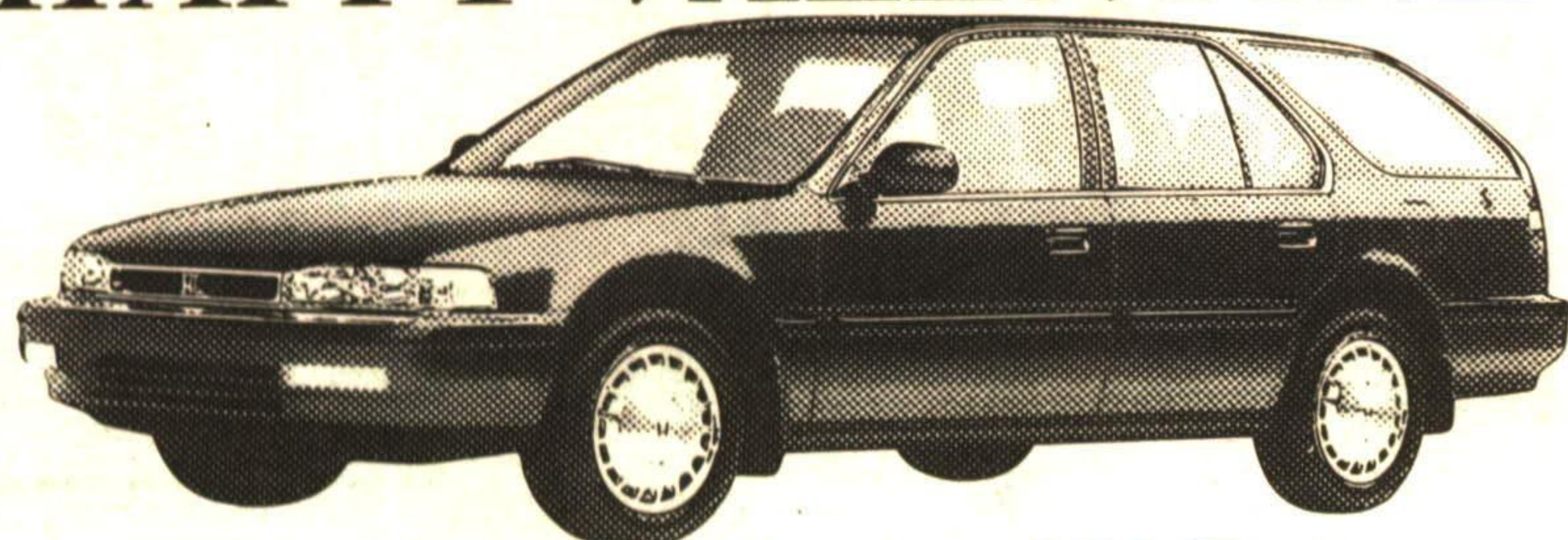
Accord Wagon EX-R