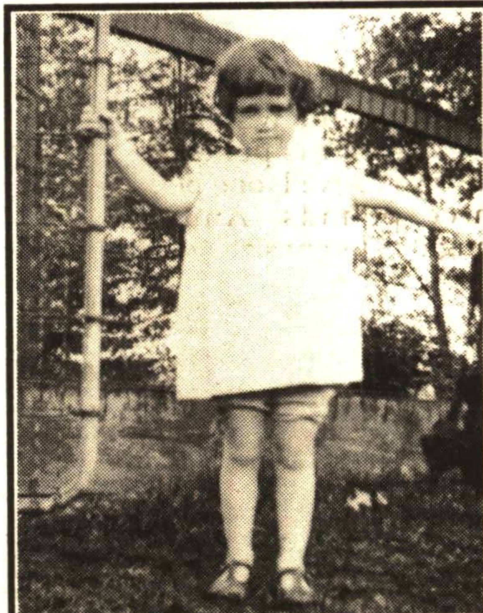
Happy 60th Mummy!

Stroll to everything. Spacious 2,500 sq. ft. 6 year old home in Georgetown. Super closet organizers in 4 bedrooms. Whirlpool and upright shower ensuite with master. Barb will be happy to show you through. RCA1-116