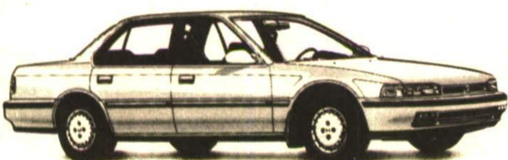
EX ACCORD 1991

MOST 1991 MODELS IN STOCK AVAILABLE FOR IMMEDIATE DELIVERY. *FINANCING FROM 12 TO 60 MONTHS AVAILABLE. LEASE AT FAIR MARKET VALUE WITH $1500 DOWN OVER 60 MOS. FRT., PDI, LIC & TAXES EXTRA. O.A.C. CANNOT BE COMBINED WITH ANY OTHER OFFER OR PREVIOUS SALE.