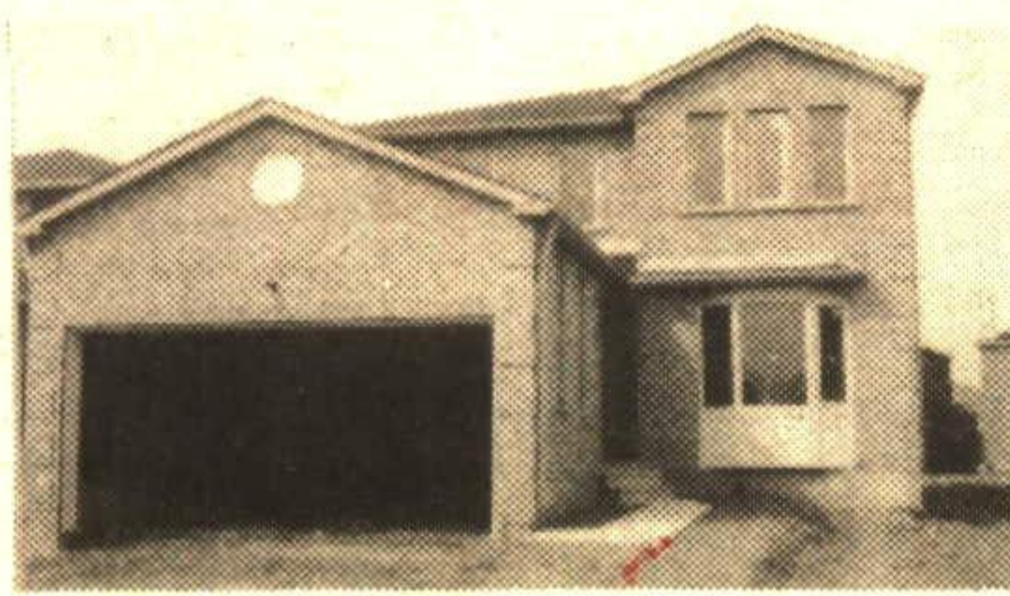
4 bedroom house for rent south of Georgetown. Family room, 2-car garage, 1st. of April, 1991. $1,100 per month plus Utilities. No Pets. call Beatrice Keck 853-2074 or 853-0100. RCA9-008