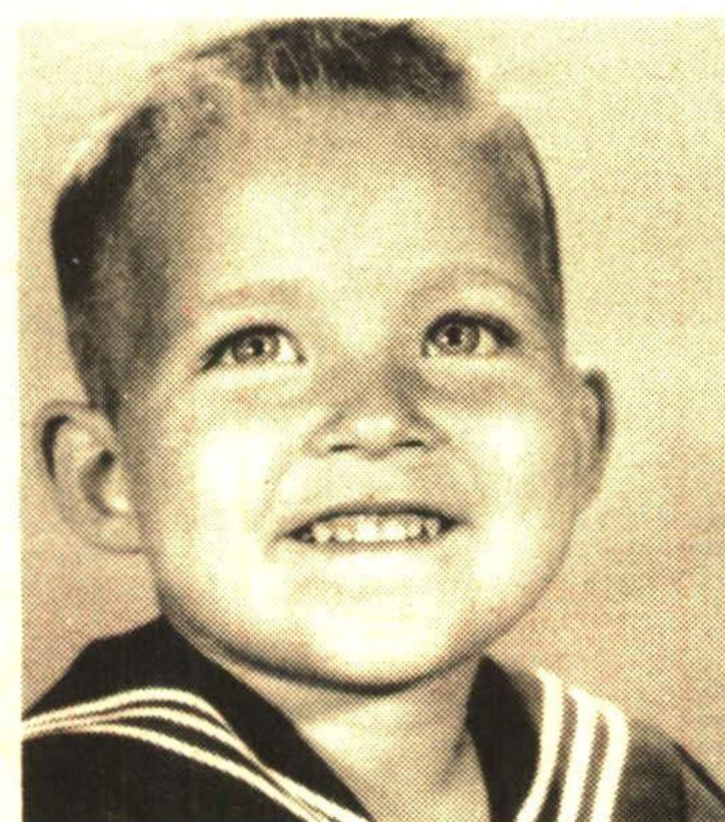
Guess who just joined the 30's club and lives in Rama, Ontario?