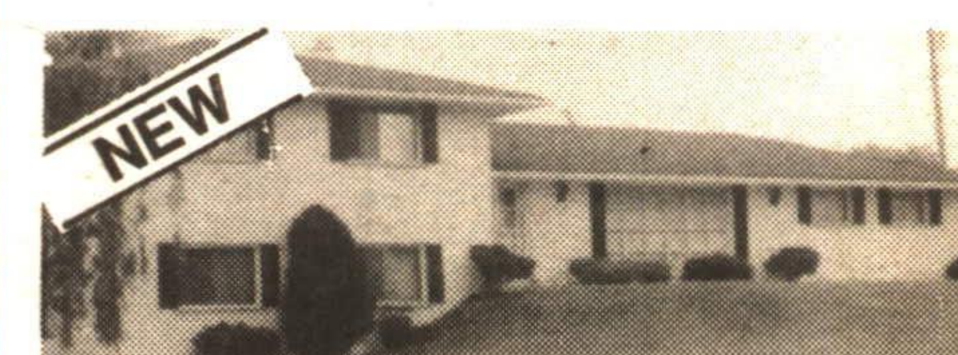
SCENIC 10 ACRE MINI FARM - $525,000!

Income producing apartments plus space for a commercial business in downtown Georgetown. Priced to sell at $269,000. RM180-90