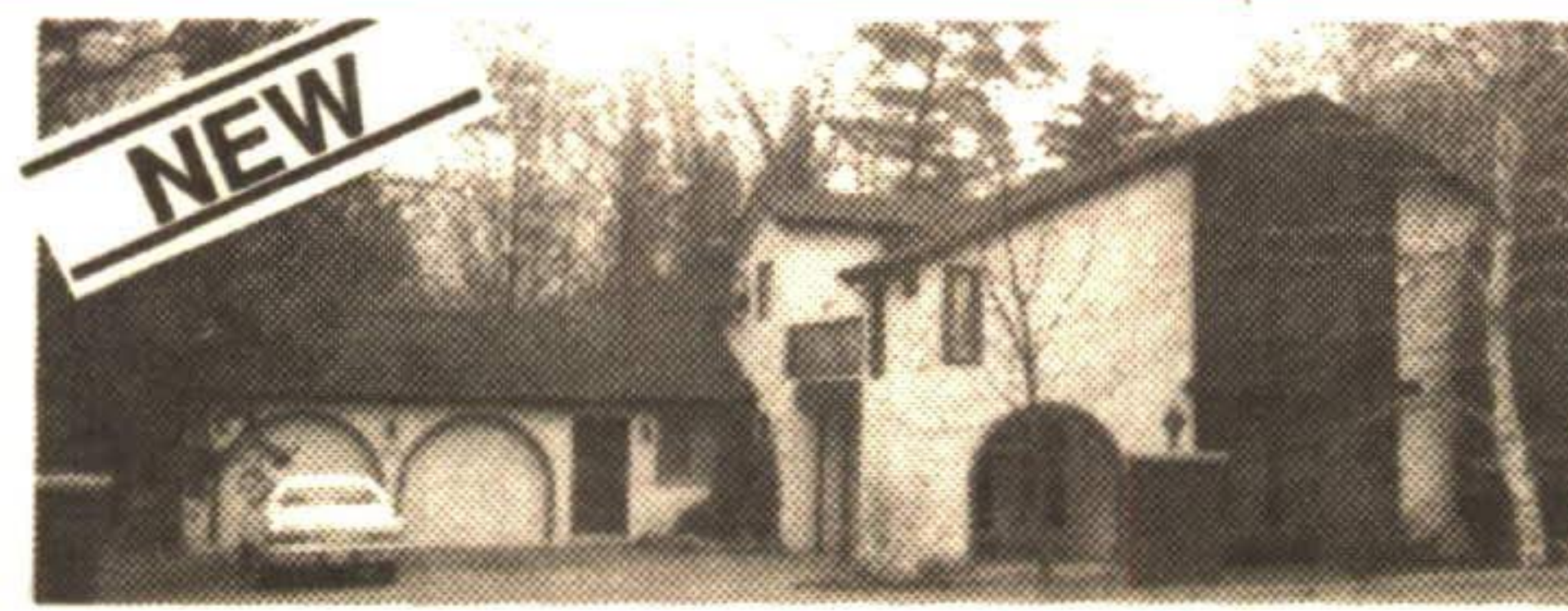
DISTINCTIVE CUSTOM HOME

Stunning new 5 bedroom home comprised of 4000 sq. ft. of luxury space. Some of the many fine features include 3 skylights, 2 jacuzzi's, plaster mouldings, gorgeous oak panelled family room with stone fireplace, French doors, lovely oak kitchen, 50 oz. broadloom throughout, ceramic floors in entry & all baths and much much more. RM045-90