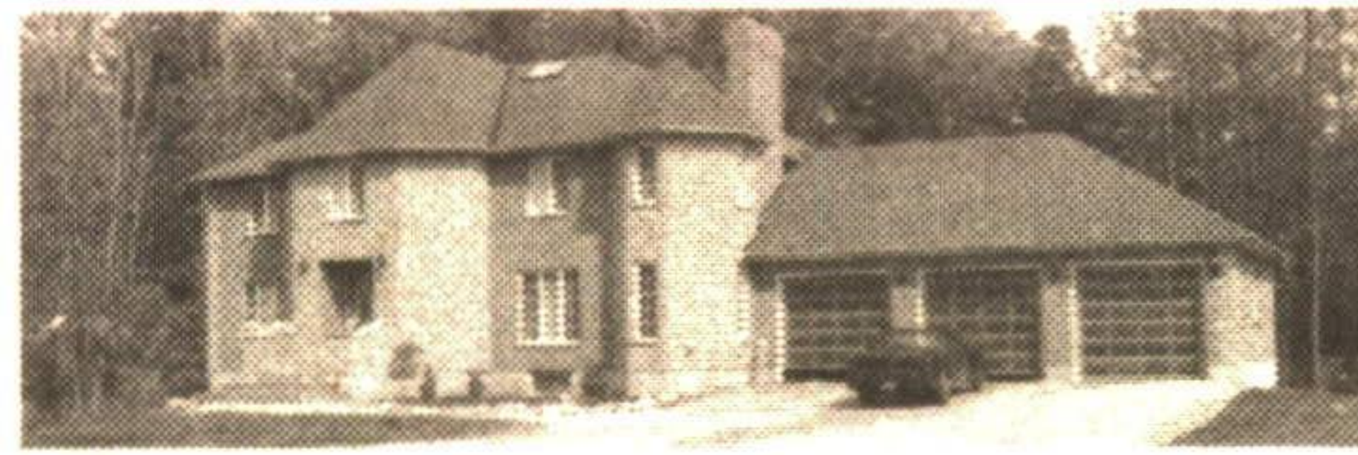
COUNTRY ELEGANCE NESTLED ON PICTURESQUE WOODED PROPERTY

Constructed with top quality features including 9' ceilings on main floor, oak plank flooring throughout ceramic floor in baths, 2 fireplaces, circular oak staircase, sunken living & dining rooms, main floor family room, triple car garage & much more. RM158-90