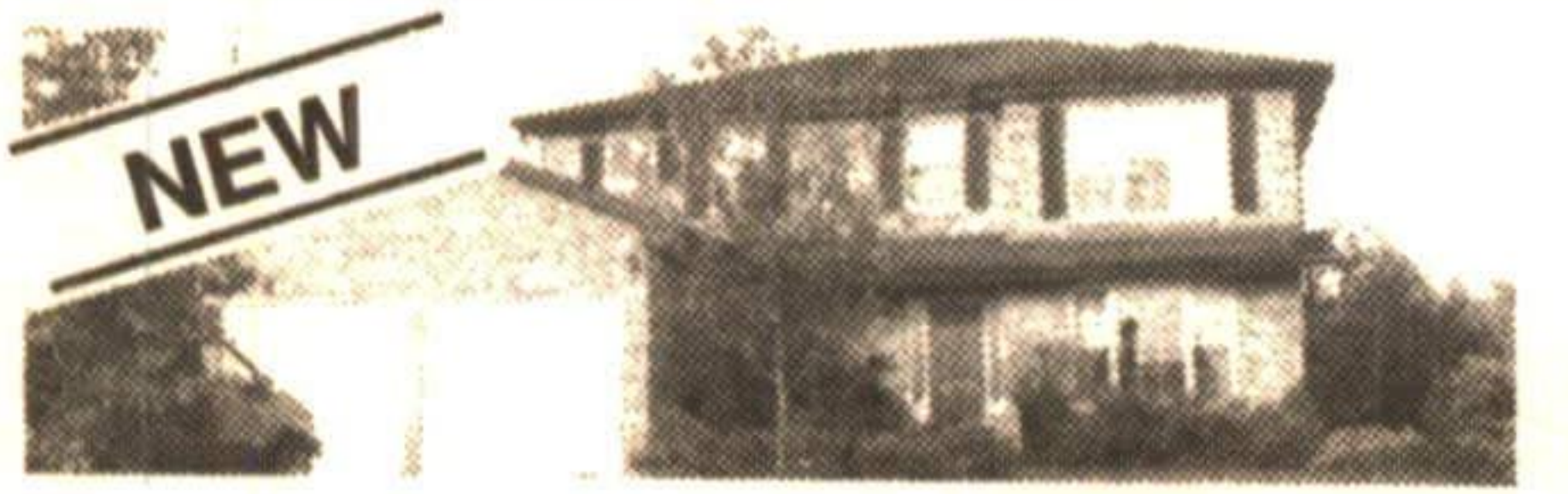
ELEGANT EXECUTIVE HOME ON QUIET COURT

Can be found throughout this exquisite home. A centre hall of stately proportion distinguishes this fine floor plan. Lovely master bedroom suite and 3 other spacious bedrooms, 4 baths, main floor family room, 2 fireplaces, triple car garage and much more. This lovely home backs onto a ravine and is beautifully landscaped. A must to see. RM9203