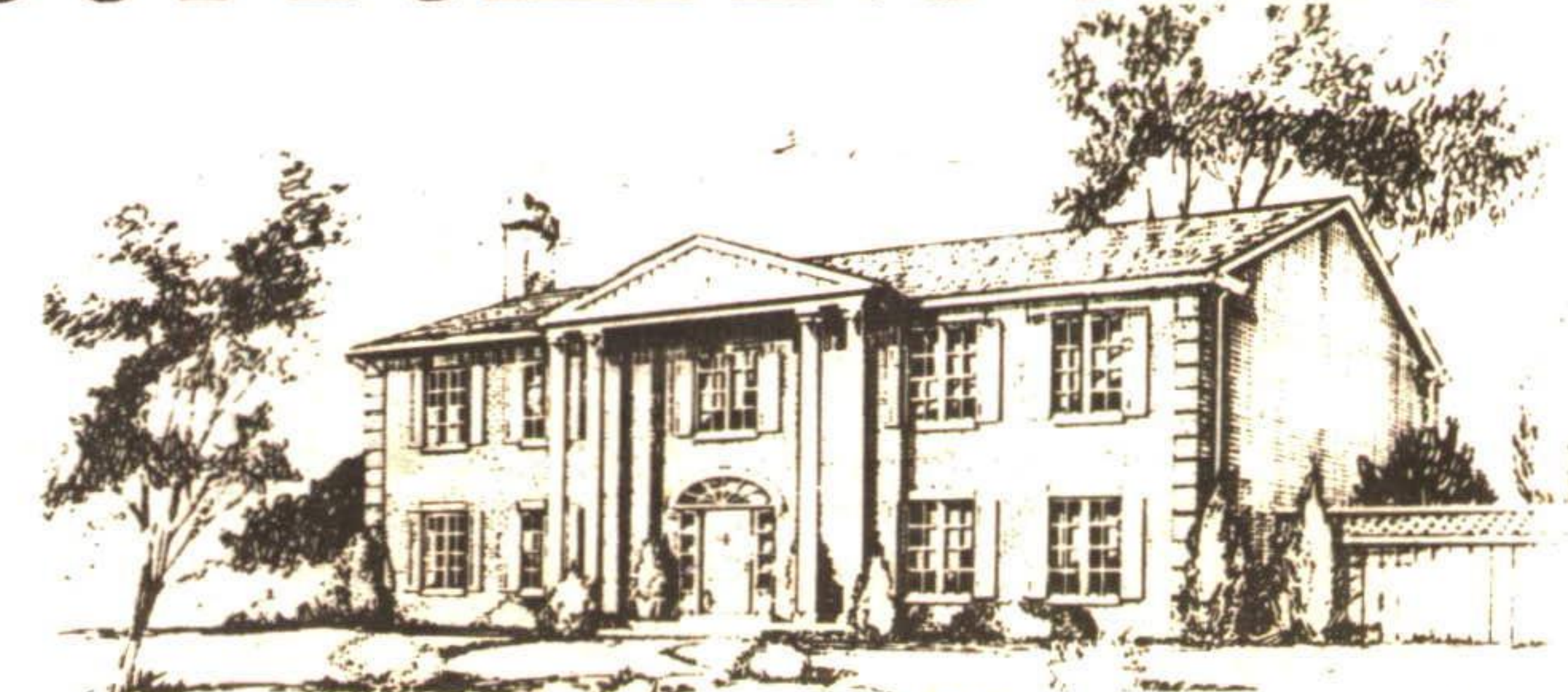
2 STOREY - 2,800 SQ. FT.

UPON REQUEST FACTORY CONSTRUCTED HOME INFORMATION IS AVAILABLE