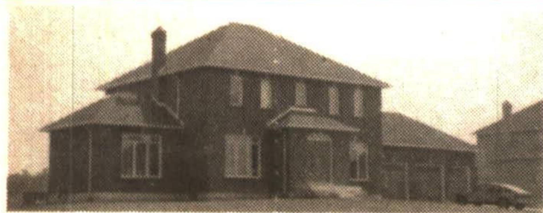
STUNNING EXECUTIVE HOME ON HALF ACRE $479,900

Constructed with top quality features including 9' ceilings on main floor, oak plank flooring throughout ceramic floor in baths, 2 fireplaces, circular oak staircase, sunken living & dining rooms, main floor family room, triple car garage & much more. RM158-90