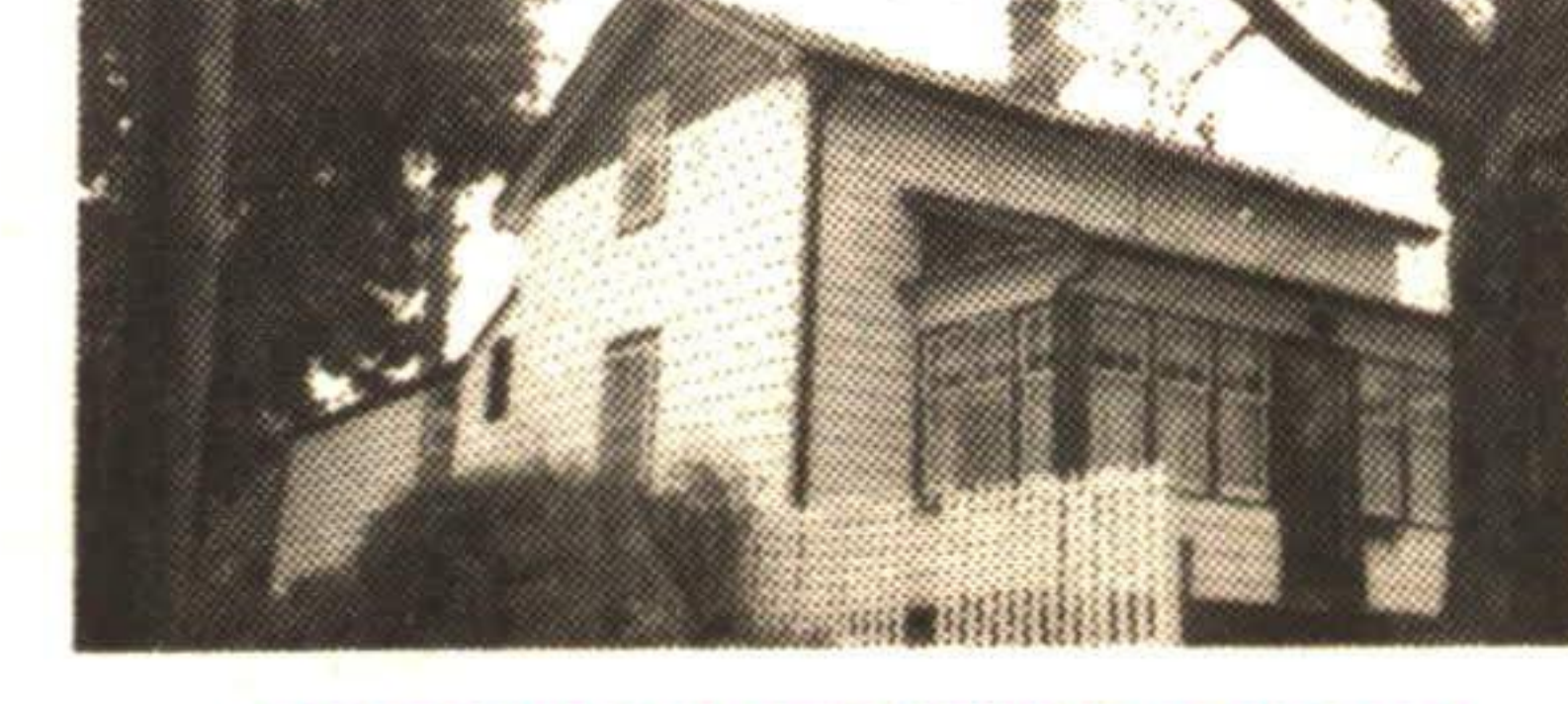
CHARMING OLDER HOME - $189,000

Spacious brick & stone rancher on lovely treed property located just minutes from Georgetown, with excellent access to Hwy. #401. Features include main floor family room with fireplace, 3 bedrooms, double car garage and more. RM9240