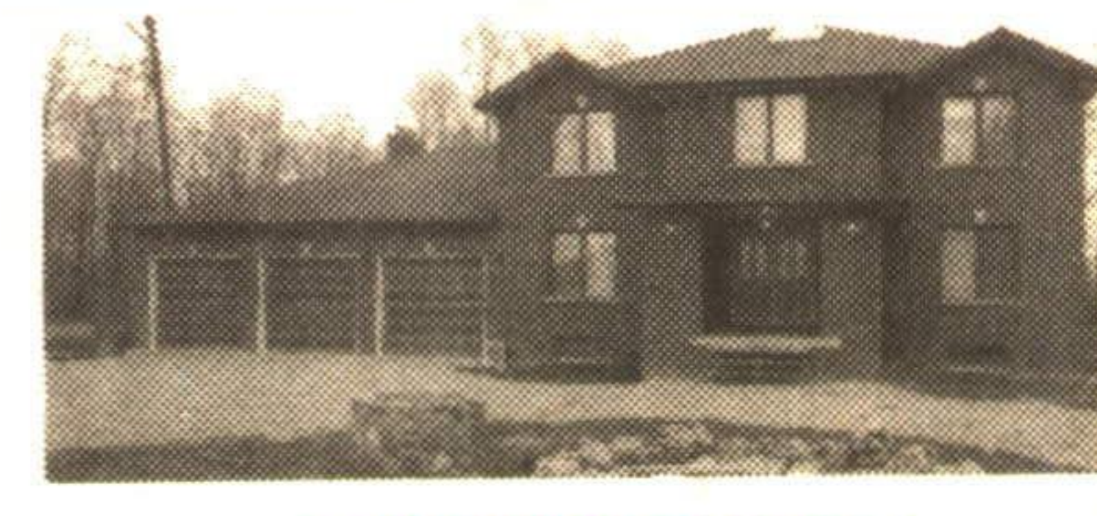
2 ACRE WOODED ESTATE

With spectacular river setting! Set on almost 1 acre lot in town backing onto Credit River, this unique home features cathedral ceilings, 2 fieldstone fireplaces, custom oak kitchen with built-in appliances, walkout to flagstone patio with hot tub and lovely rock gardens, private balconies, 2-1/2 baths, extras such as central vacuum, central air & air cleaner and much more. Don't miss seeing this delightful home. RM264-90