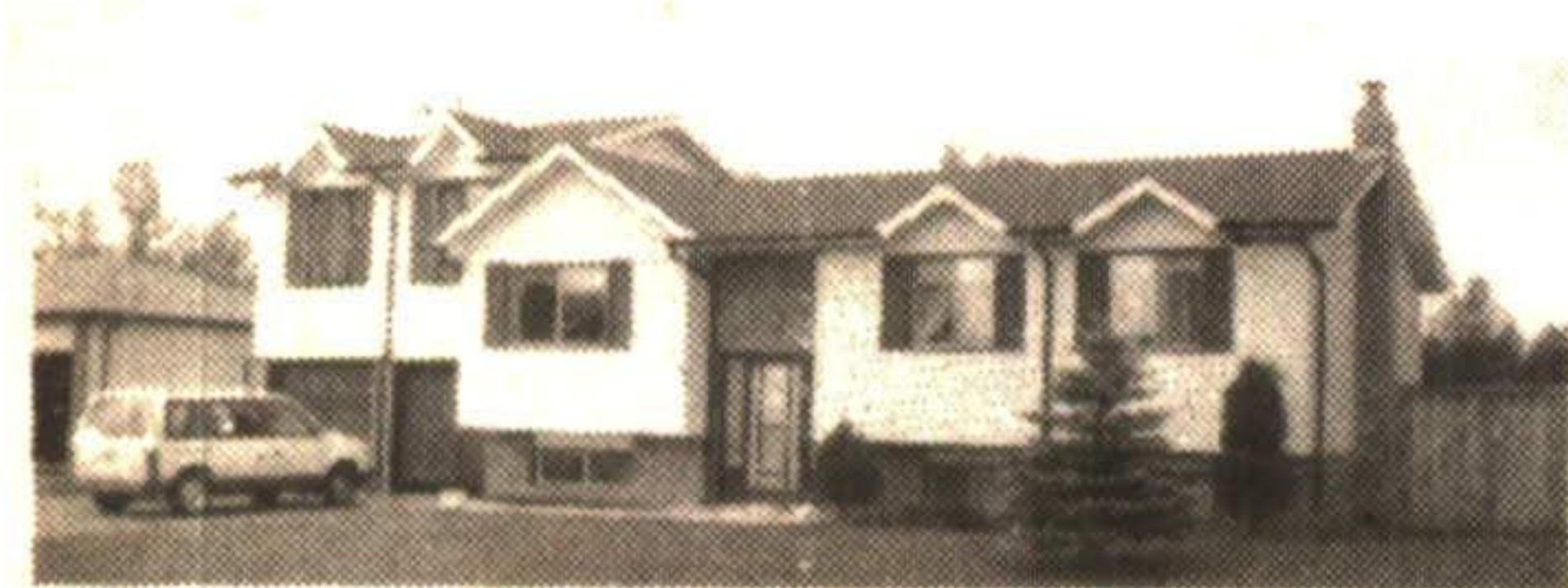
SPACIOUS FAMILY HOME BACKING ONTO STREAM - $209,900!!

Gorgeous home located just minutes from Mississauga, Brampton and Georgetown. Intercom, security system, central vac, 3 baths, ceramic and hardwood floors throughout, 3 fireplaces, oak custom kitchen, triple car garage, skylight, large deck, oak panelling and stone fireplace in family room, much more. RM037-90