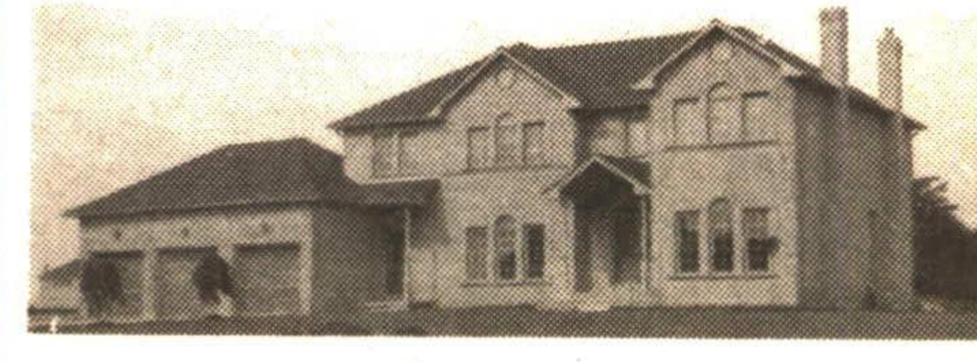
QUALITY AND ELEGANCE!

This lovely 4 bedroom home set on a picturesque property with town water includes quality features such as pegged oak flooring, Berber rugs, sunken family room with fireplace, spacious oak kitchen, wraparound deck, finished rec room with ground floor walkout & much more. RM187-90