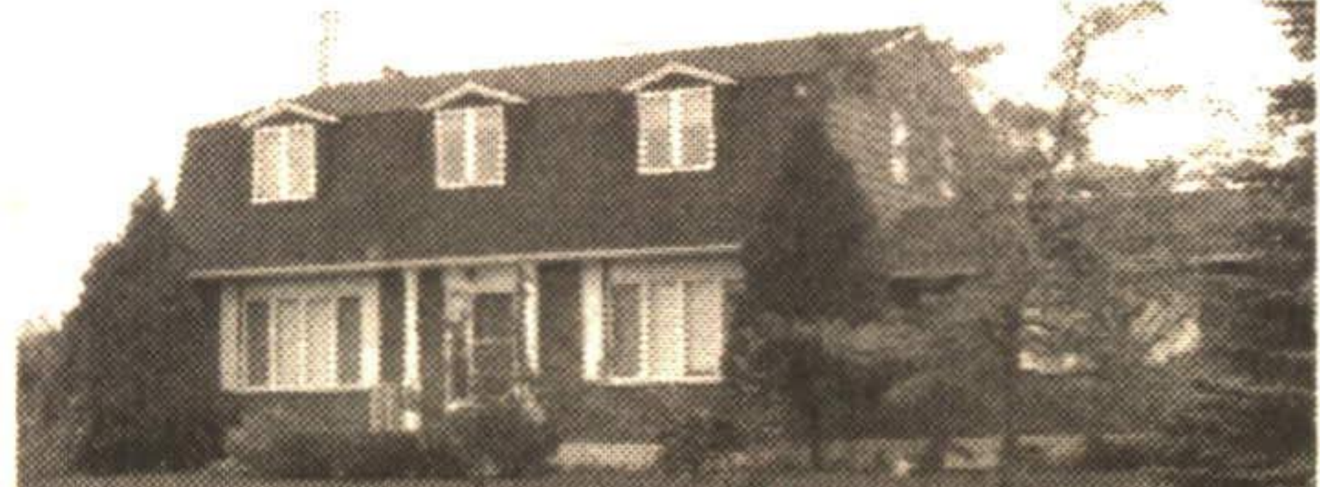
COUNTRY HOME ON 11 ACRES - SOUTH OF TOWN!!

Situated in a prestigious area of fine homes, this lovely custom designed estate comprised of 2900 sq. ft. and includes many fine features such as cathedral ceilings, double fireplace between living & dining rooms, spacious kitchen with walkout to deck, central air, central vac, intercom, circular driveway and much more. RM234-90