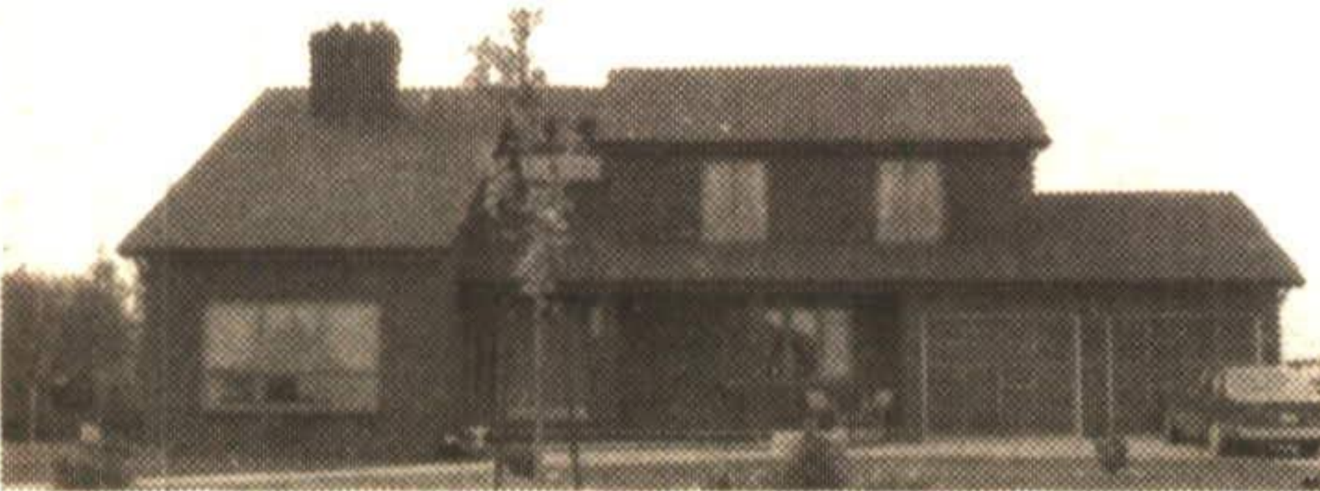
COUNTRY ELEGANCE ON 1 ACRE!!

This spacious family home has been beautifully decorated and well maintained. Features include main floor family room with fireplace, oak kitchen with built-in appliances and raised eating areas with pine floors and bench, main floor laundry, new gas furnace, new shingles, new windows, lovely large lot and much more. RM241-90