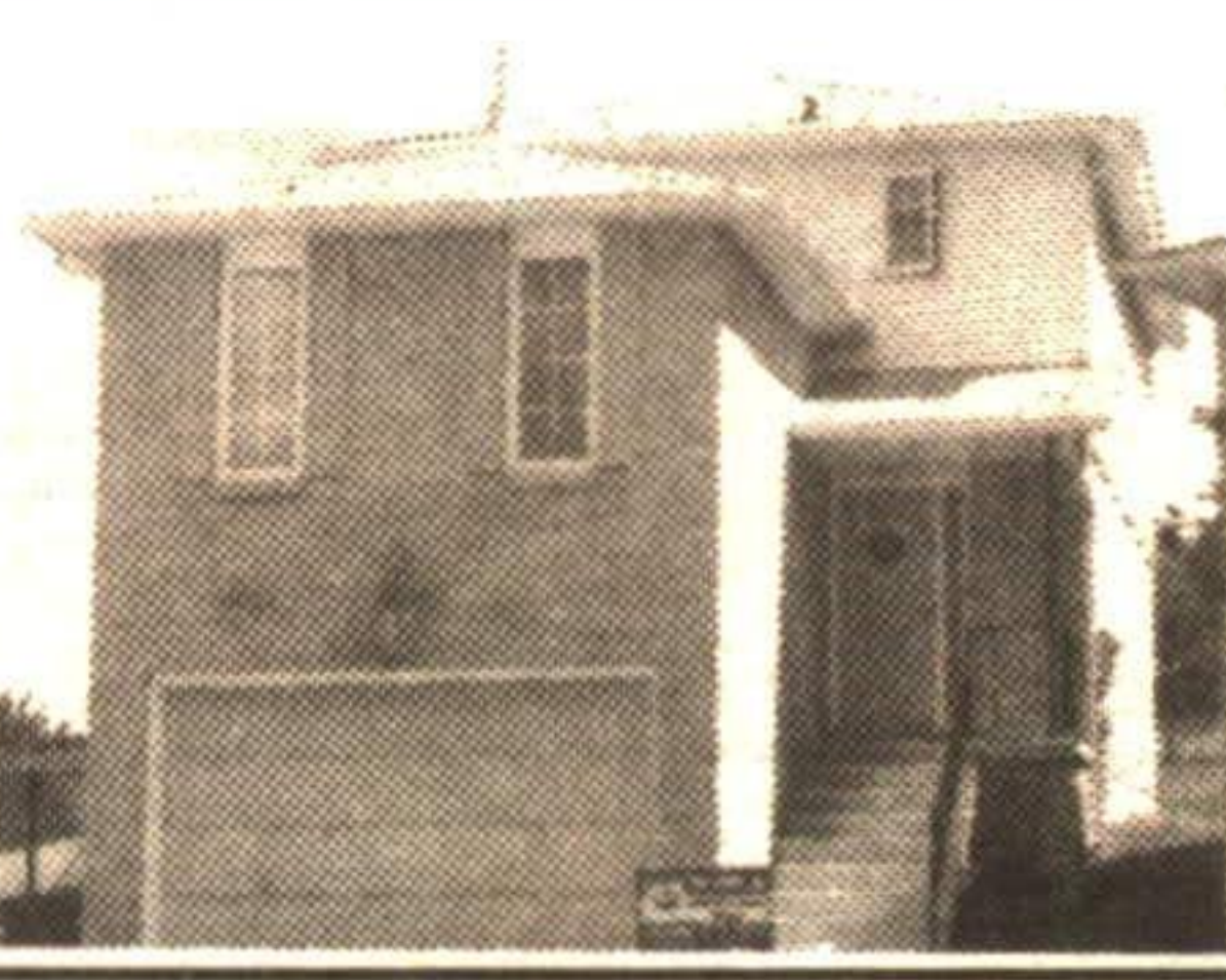
VENDOR ANXIOUS EXCELLENT VALUE AT $209,900

Set on a beautifully landscaped property, this fine home is stunning throughout with quality features such as oak plank flooring, oak trim & mouldings, formal living & dining rooms, circular oak staircase, ceramic tile entry, lovely rec room with fireplace, heat pump, central vacuum & numerous more deluxe features. RM252-90