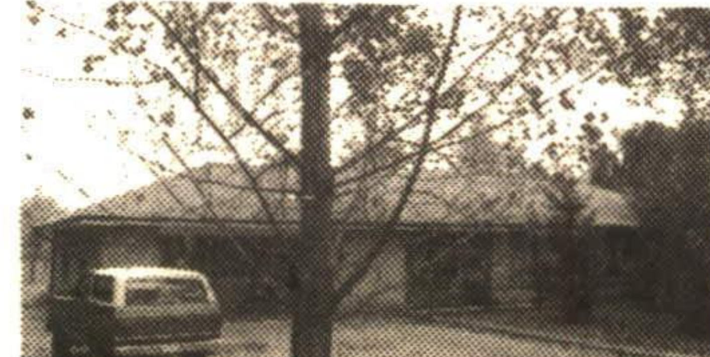
COUNTRY BUNGALOW GREAT LOCATION - $294,900

Set a new standard of living in this wonderful 4 bdrm, 2 storey home nestled in a residential neighbourhood. 9 ft. ceilings on main floor, all clay brick, casement windows, 2 FPs, double garage, 3 baths, lovely master suite with dressing table and sep. bathroom with whirlpool, lovely oak kitchen. Many more quality features. Asking $529,900. RM162-90