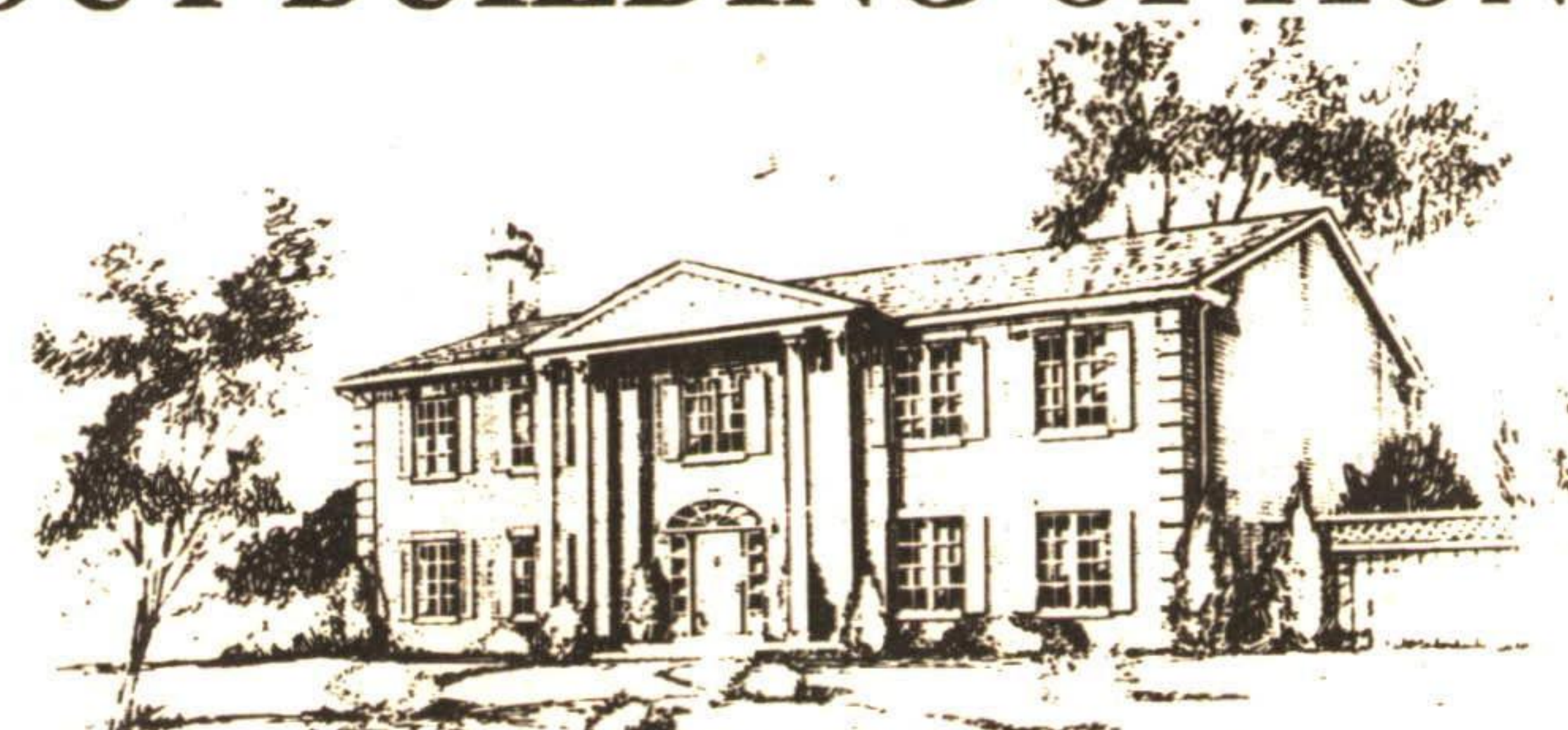
2 STOREY - 2,800 SQ. FT.

UPON REQUEST FACTORY CONSTRUCTED HOME INFORMATION IS AVAILABLE