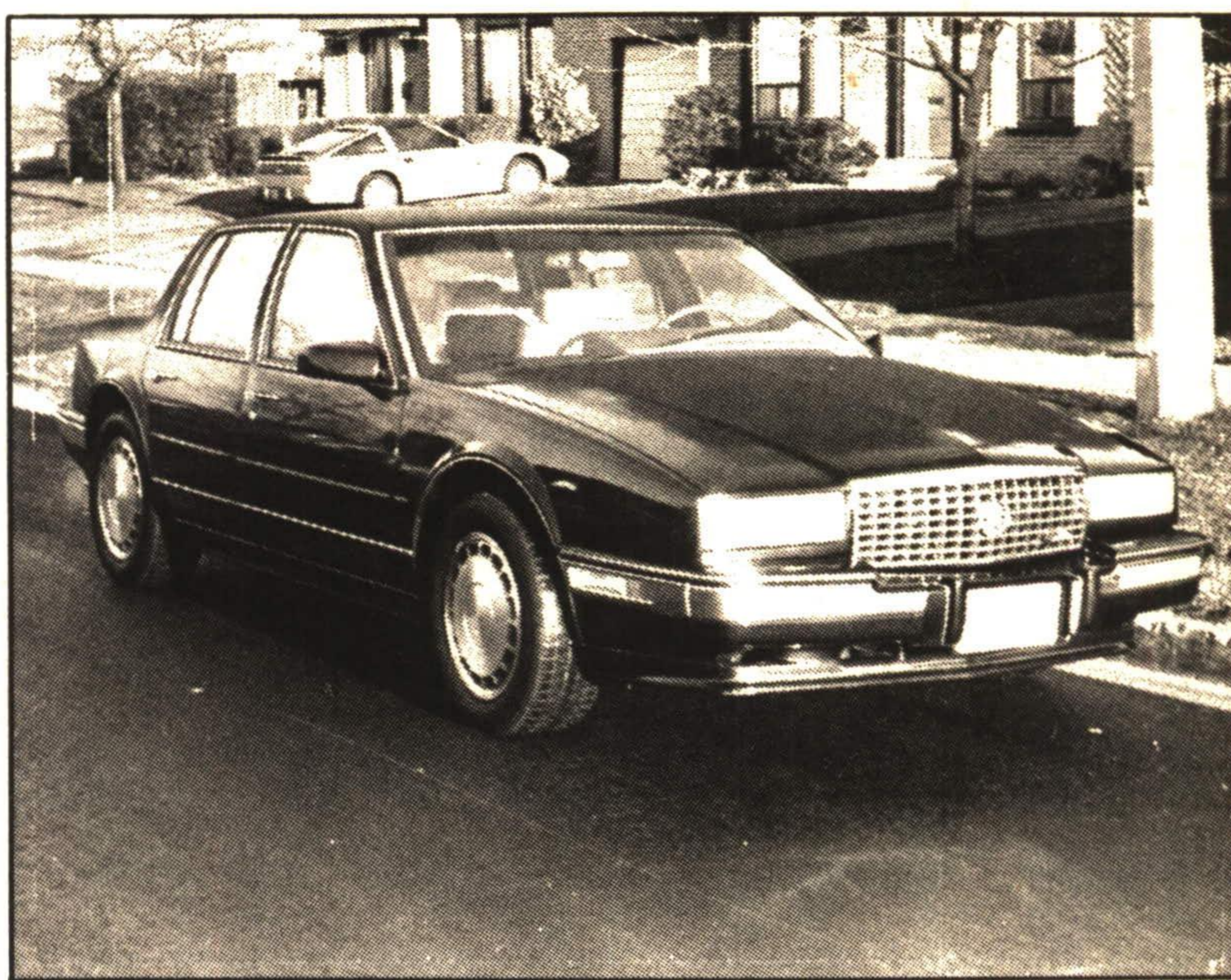
All dressed up and ready to hold its own in any road company, the 1991 Cadillac Seville STS impresses with its power and handling.

1-3, there were more than 3,000 registered test drives by the journalists and corporate members. One of those was myself and the head of PR for another large automaker. We drove from Shan-