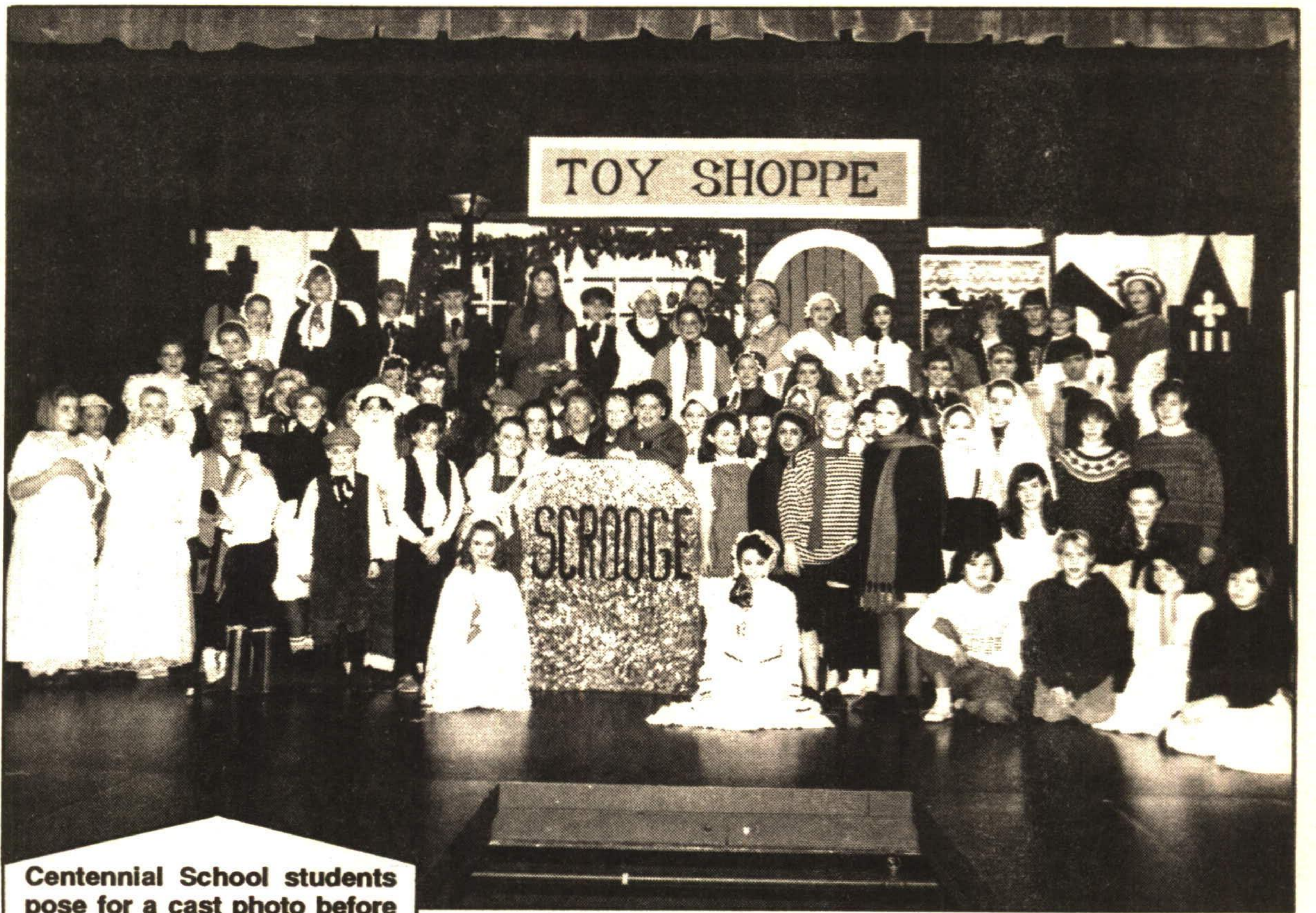
Centennial School students pose for a cast photo before the dress rehearsal of Scrooge. The play was performed Dec. 5-6 at the JET.