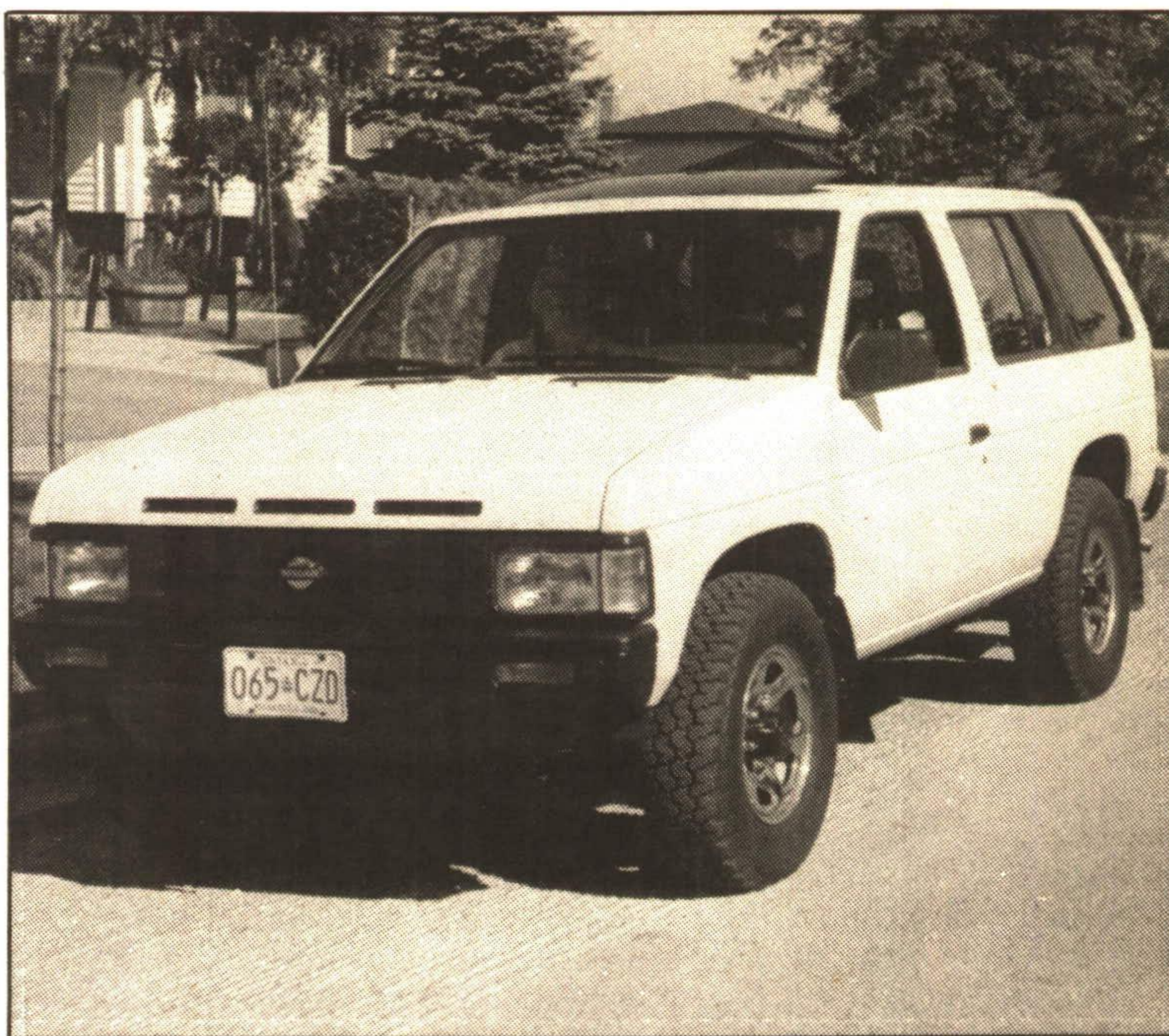
The 1981 Nissan Pathfinder adds a four door model to its purpose-built body lines and the power of the engine from the 300ZX sportscar.

The two rear doors are nicely flared into the overall body design with the handles up on