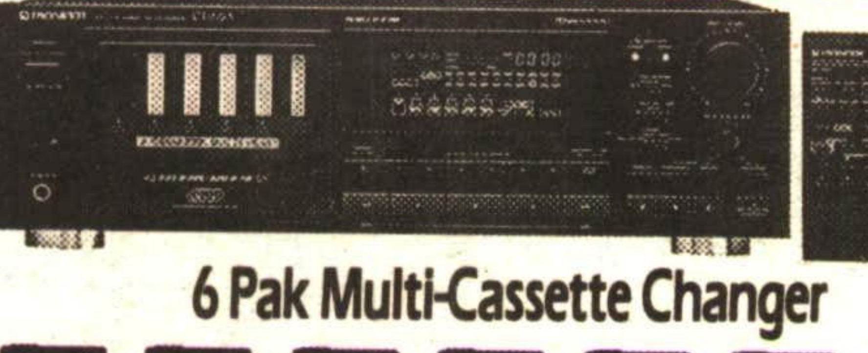
6 Pak Multi-Cassette Changer