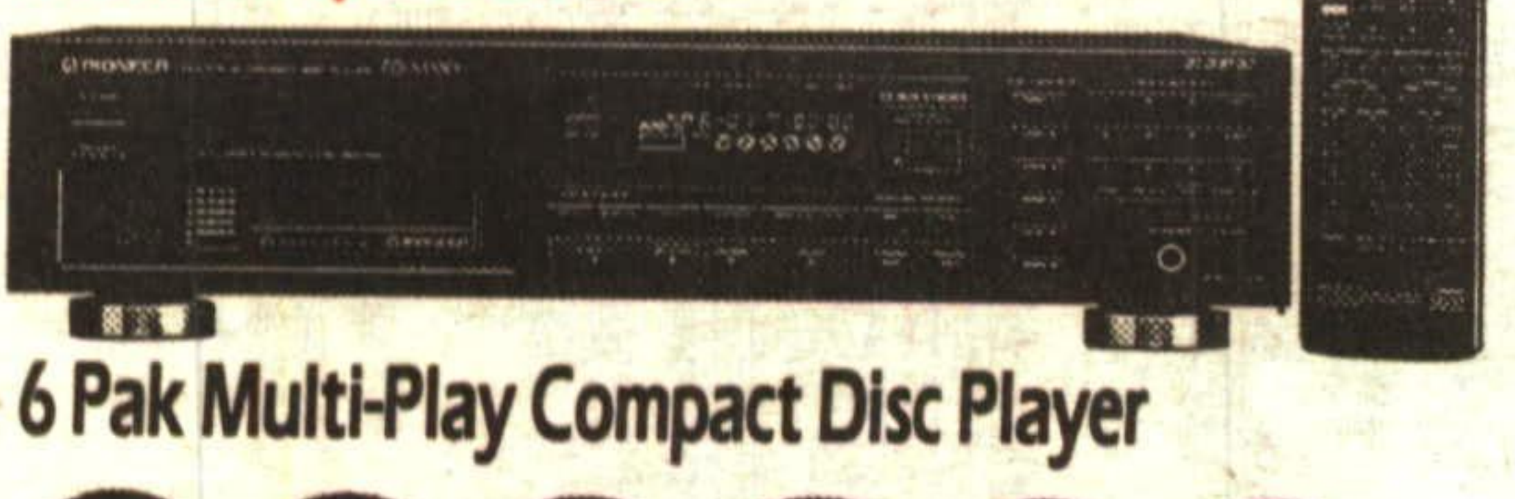
6 Pak Multi-Play Compact Disc Player