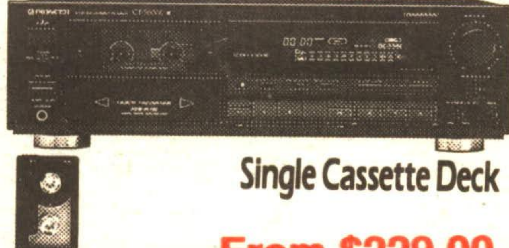
Single Cassette Deck