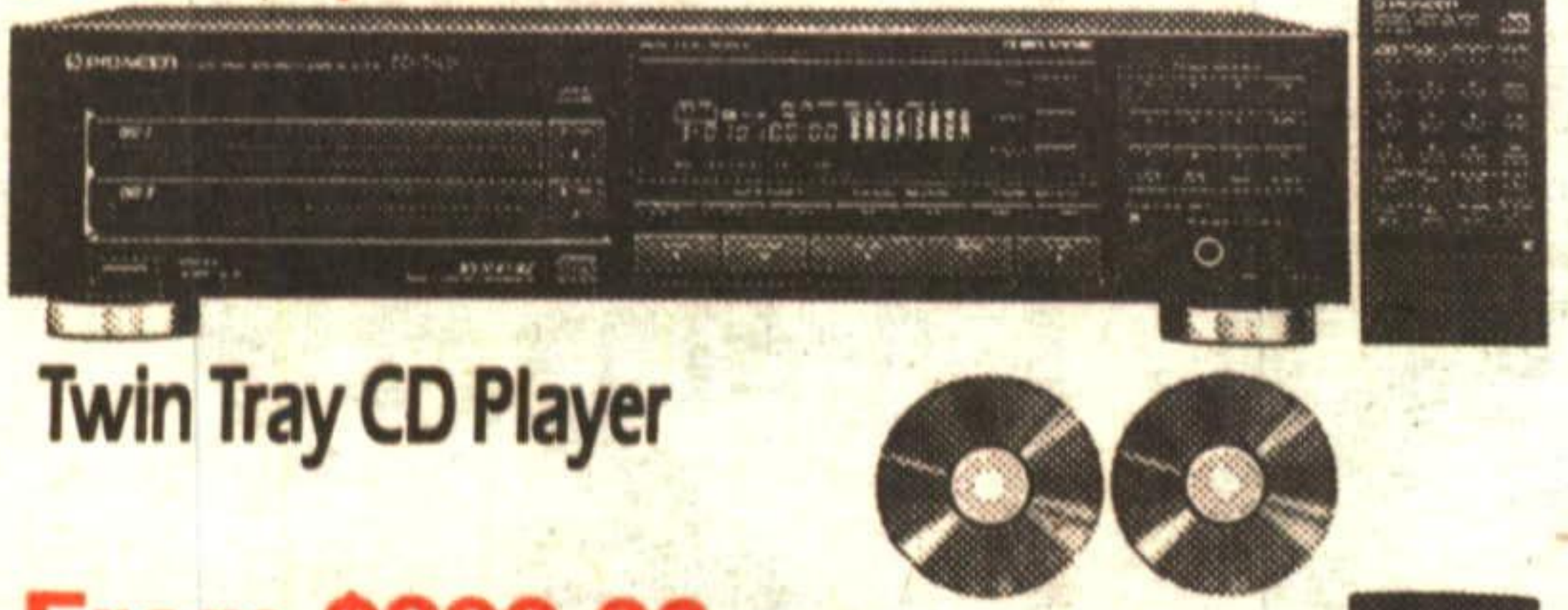
Twin Tray CD Player