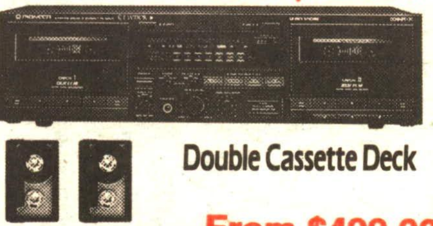
Double Cassette Deck