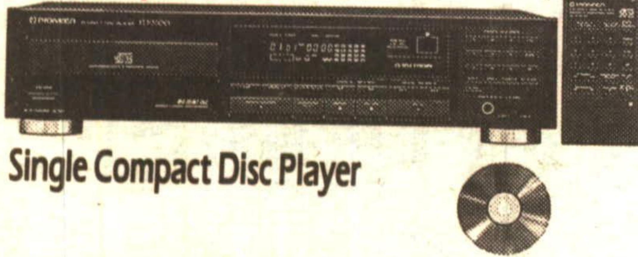
Single Compact Disc Player