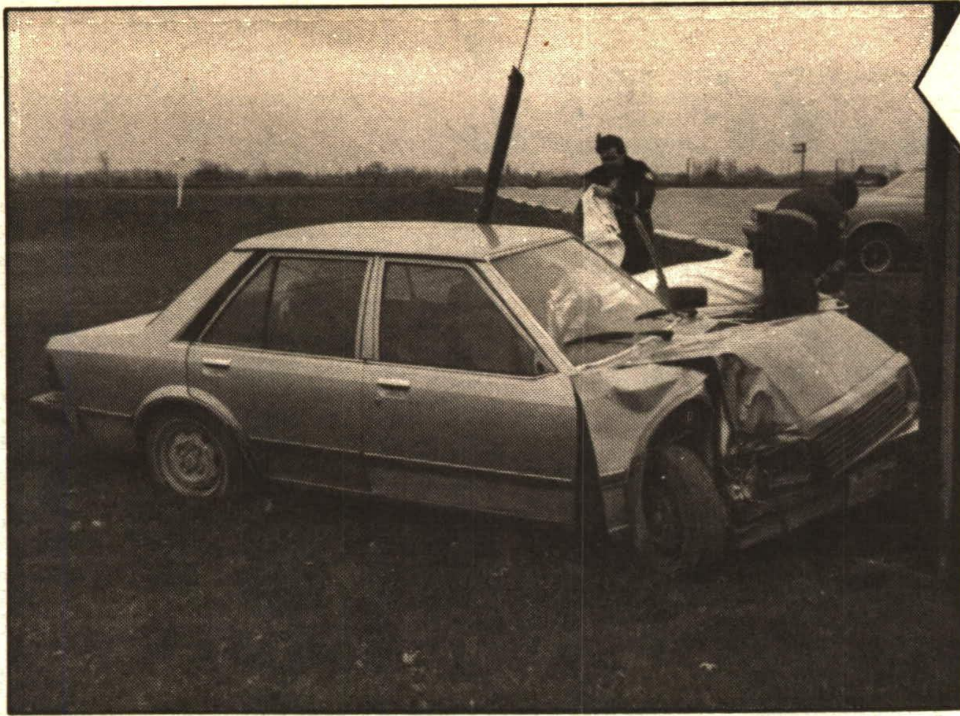
Ambulance officers from Georgetown prepare to transport the driver of this Mazda who suffered minor injuries after the vehicle went out of control and struck a hydro pole in front of Stewarttown Public School last Monday afternoon.