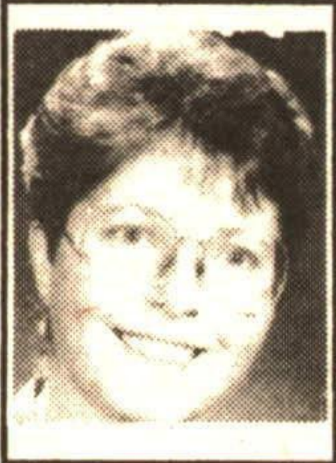
Pat Akers* Res. 873-6744

Features glassed in sunroom, hardwood floors throughout, main floor laundry, family room, formal dining room. Priced at $219,900. Call Jim Akers** or Pat Akers*. CW90-31