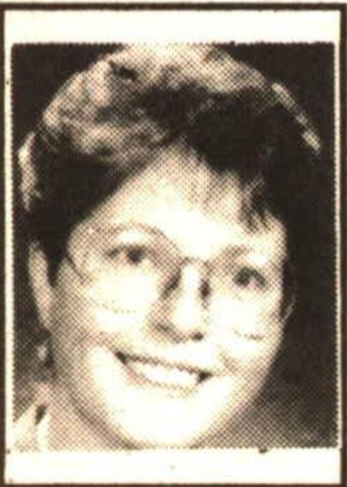
Pat Akers* Res. 873-6744

Beautifully kept 3 bedroom home on quiet street has many extras including main floor family room, oak railings, 3 bathrooms, central air, central vac, deck and much more. A must to see for only $239,900! For appointment to see call Jim Akers** or Pat Akers*. CW90-152