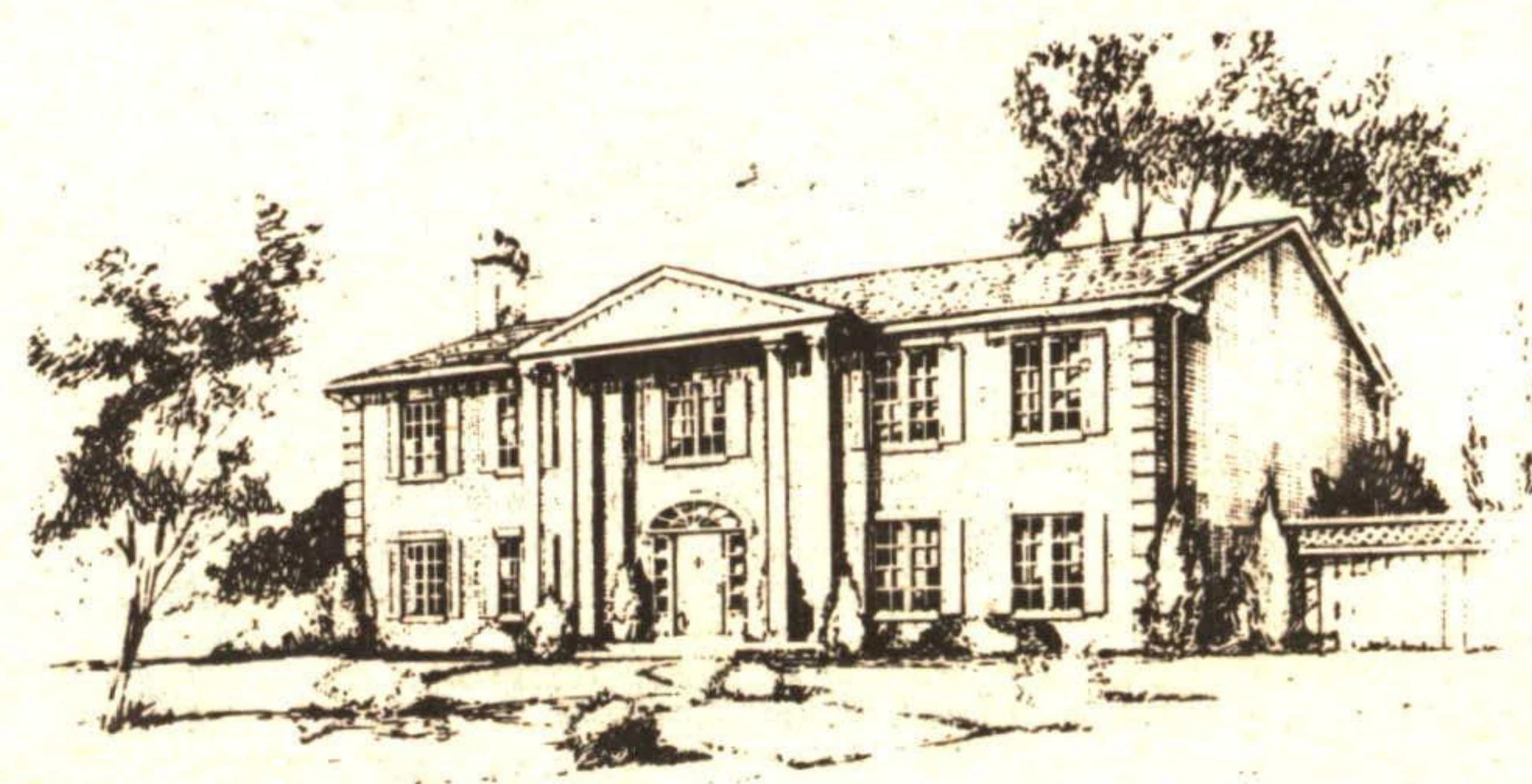
2 STOREY - 2,800 SQ. FT.

UPON REQUEST FACTORY CONSTRUCTED HOME INFORMATION IS AVAILABLE