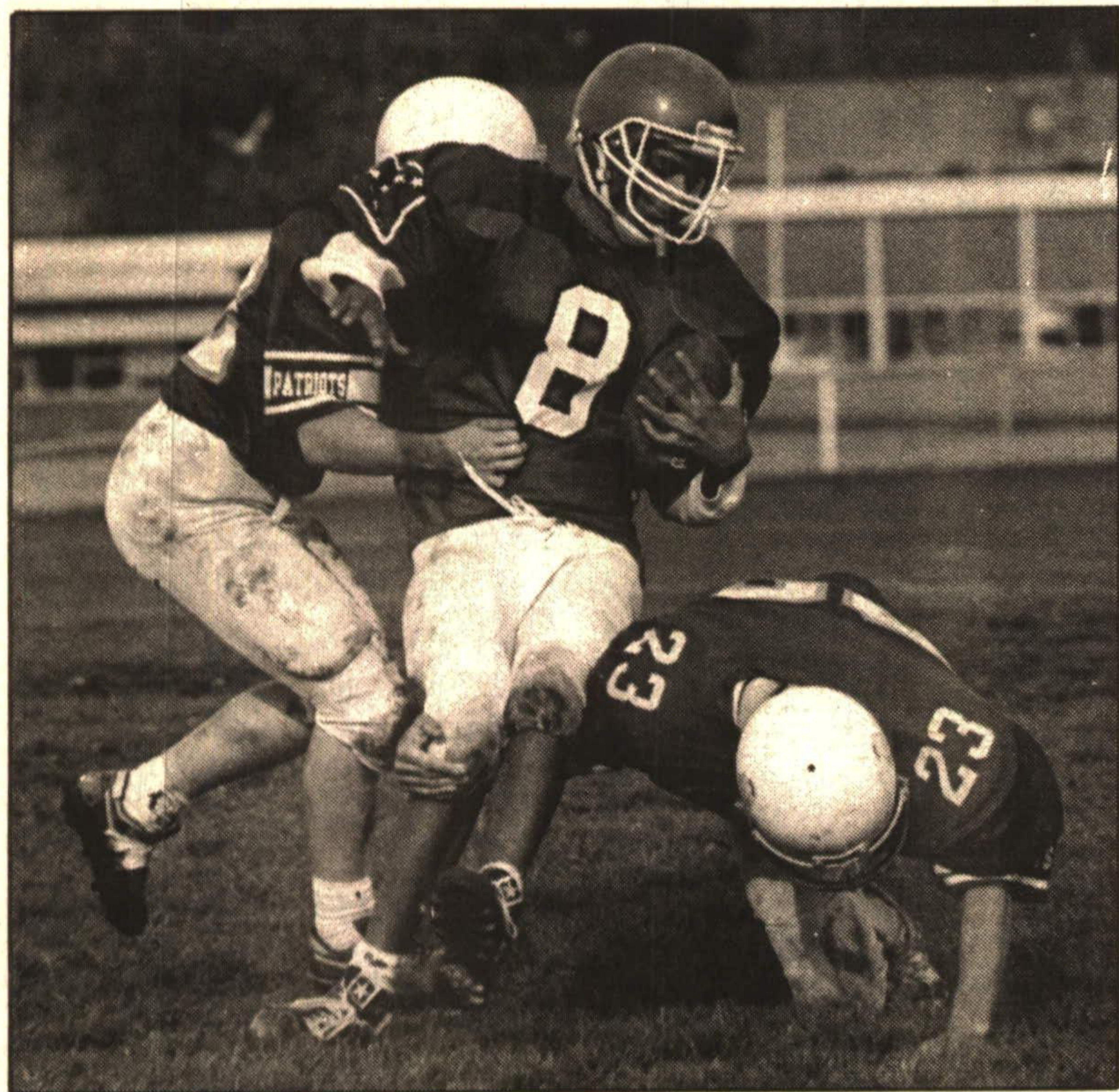
The Georgetown Rebels junior grid squad kept pace with Pearson last Wednesday for a half, but the visitors scored 27 unanswered points in the final half to down Georgetown 41-14. The Rebels played a little long ball in the first half, netting both their majors on long passes.

SOUTH SIDE OF HWY. 7, 1/4 KM. WEST OF WINSTON CHURCHILL BLVD. (416) 840-3251 (416) 873-0437