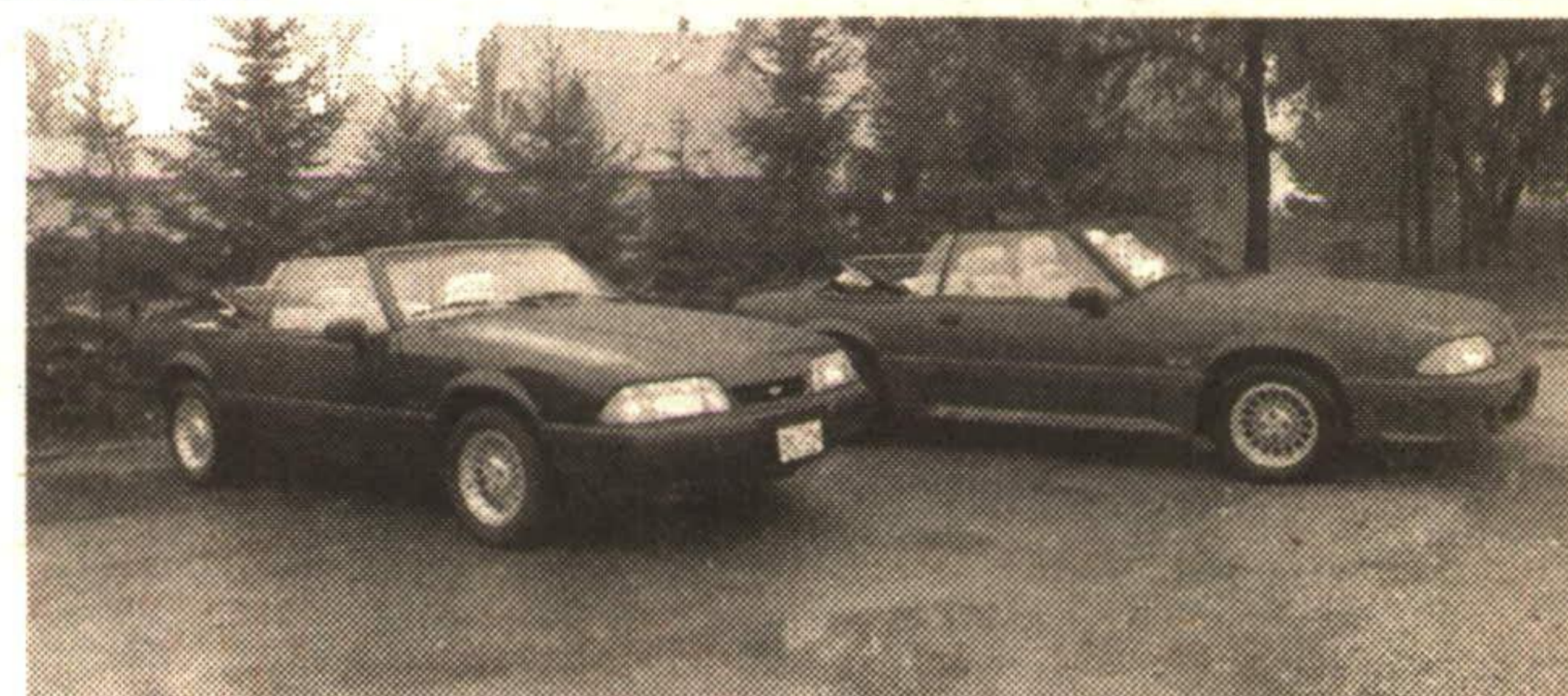
1989 Mustang GT Convertible Hot Red with white leather sport buckets, 5.0L HO with automatic overdrive. Only 41,000 kms. #1037A