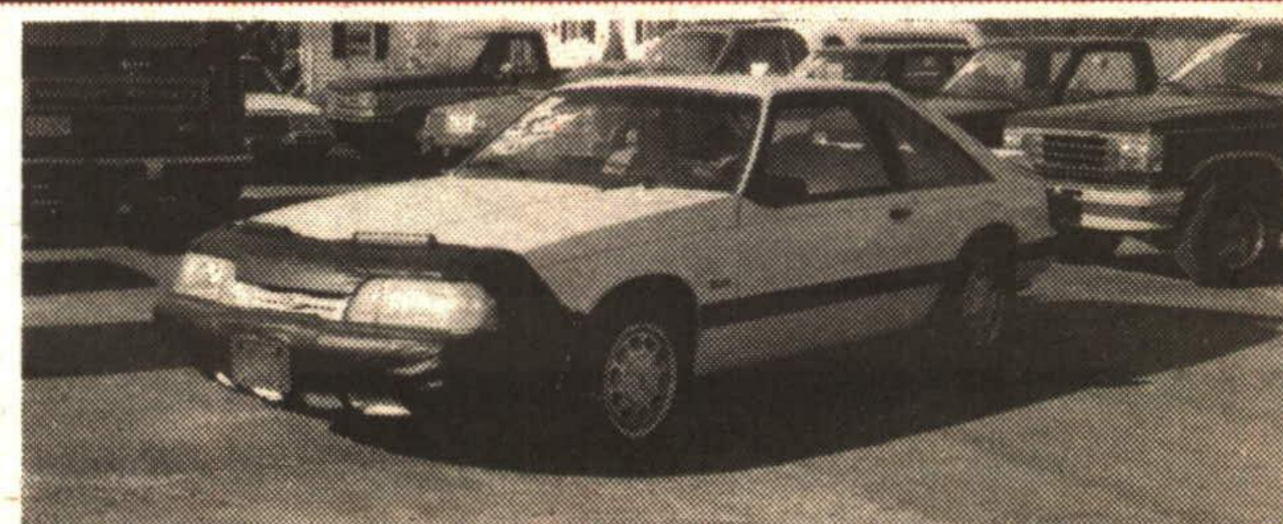
1988 Mustang 5.0L HO 5 speed with air, hatchback, oxford white tan interior. Low km. LADY DRIVEN, HONEST!! #242-1