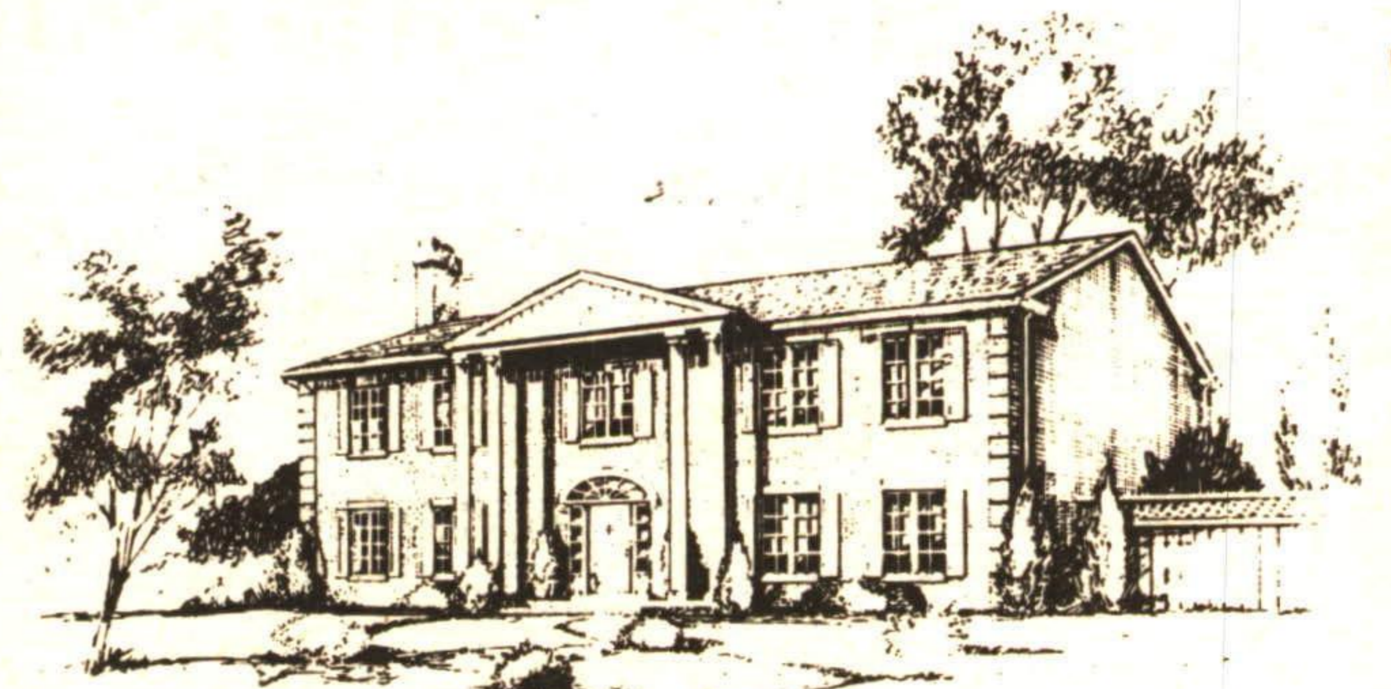
2 STOREY - 2,800 SQ. FT.

UPON REQUEST FACTORY CONSTRUCTED HOME INFORMATION IS AVAILABLE