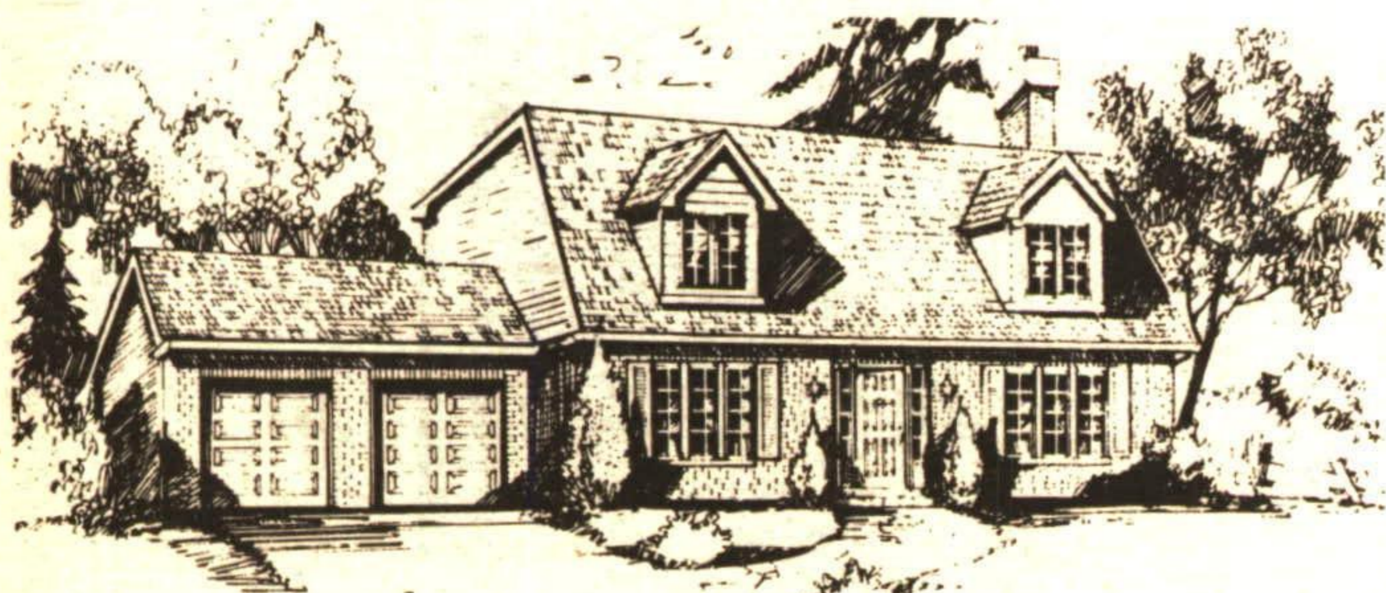
CAPE COD - 2,000 SQ. FT.

UPON REQUEST FACTORY CONSTRUCTED HOME INFORMATION IS AVAILABLE