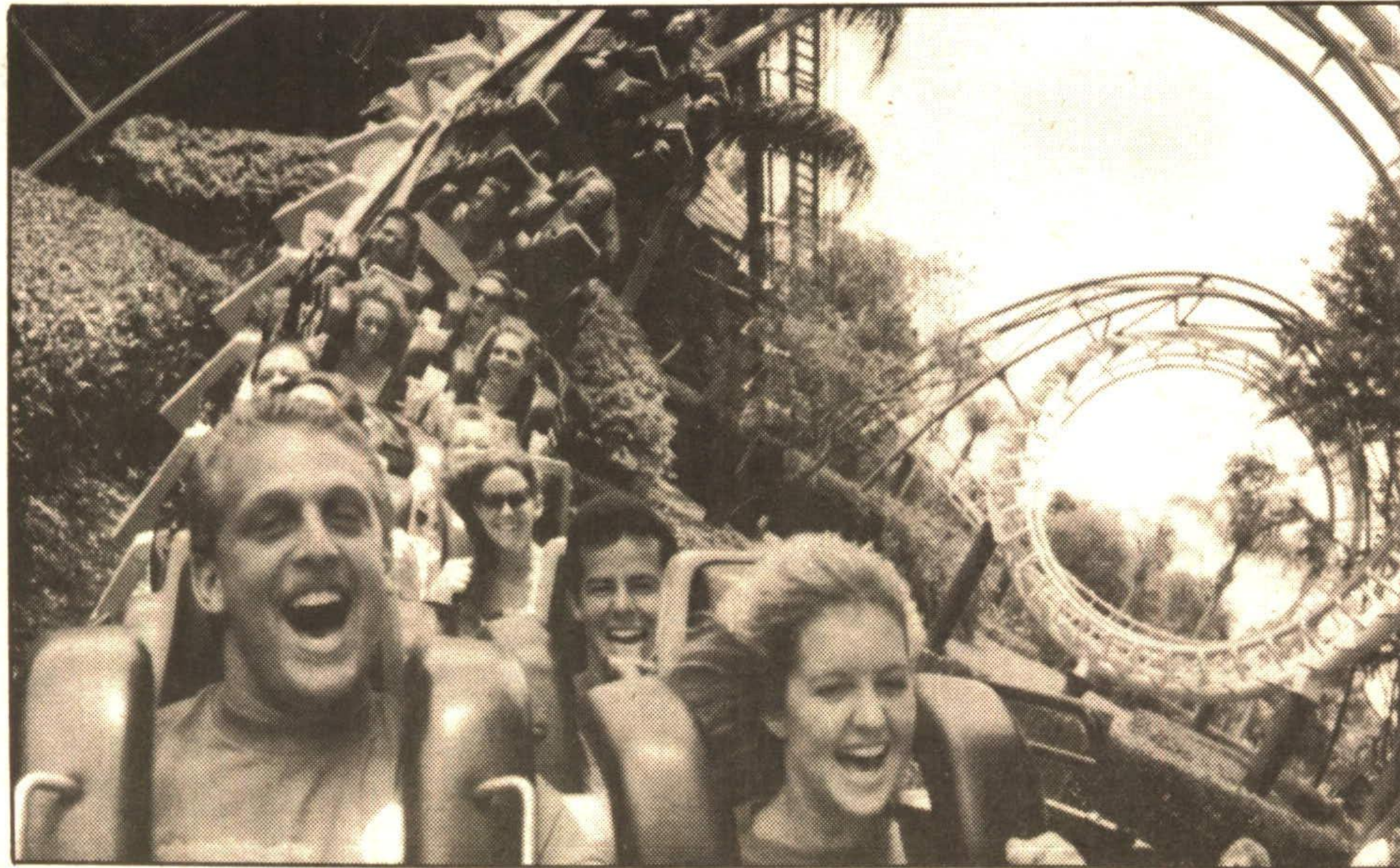
CAREEN MACHINE - Visitors to Tampa's Busch Gardens hang on tight as the Python roller coaster delivers its special brand of slithery high speed excitement. 1990 Busch Gardens, Tampa

Located only a quarter mile from Busch Gardens is Adventure Island, a water play park also owned and operated by Busch Entertainment Corporation. Open seasonally from March through October, Adventure Island this year introduces the "Caribbean Corkscrew," a high-speed water thrill ride.