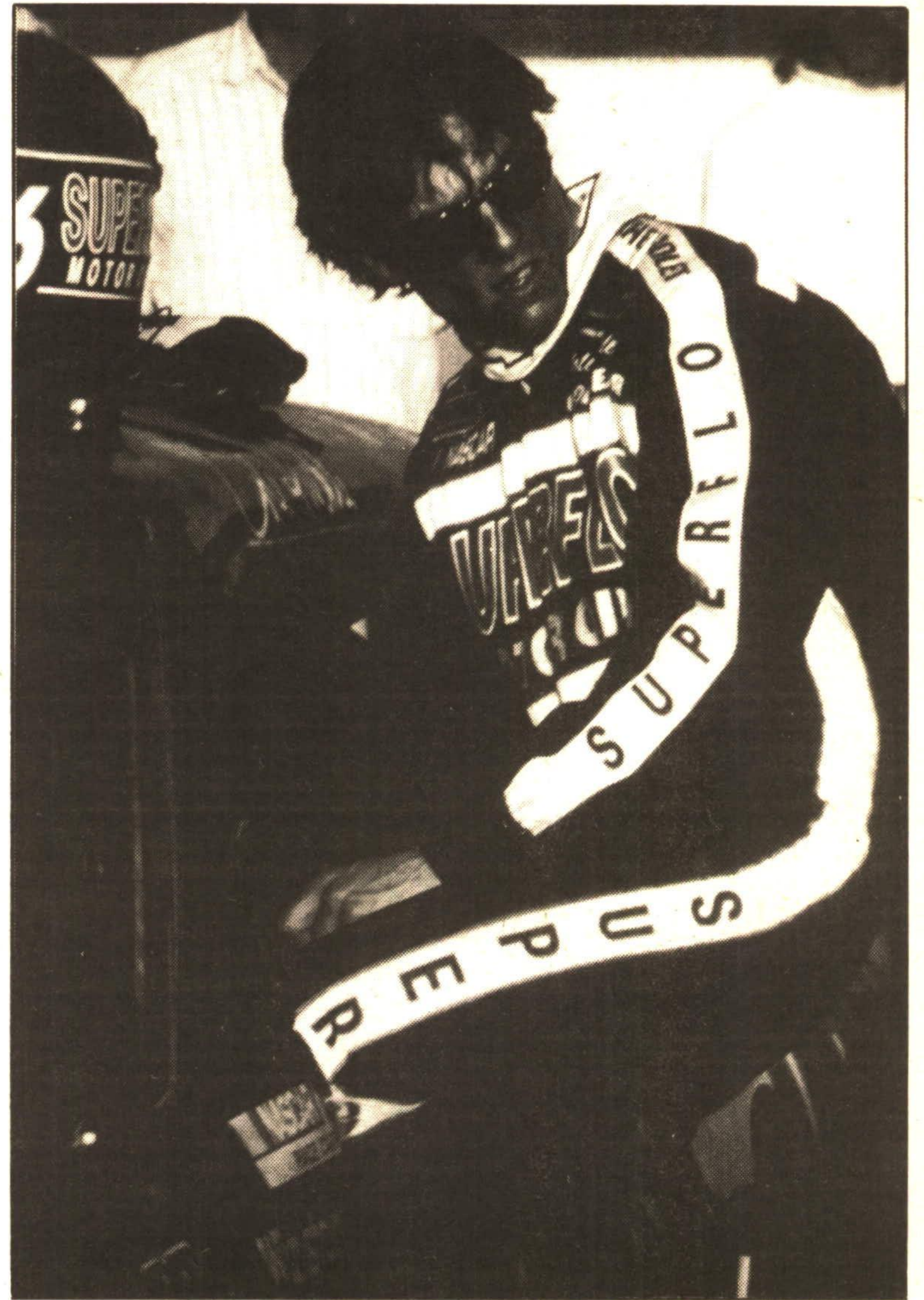
Tom Cruise's Days of Thunder has been called a racing car version of Top Gun , but nevertheless is still a top quality film.

However, in its own little way, Days Of Thunder works and mostly due to Cruise's enthusiastic and inseparable devotion to the project from start to finish, having worked very closely with screenwriter Robert Towne in developing the story. Robert Duvall's solid presence is also a nice touch, bringing extreme vitality to a rather standard character. As